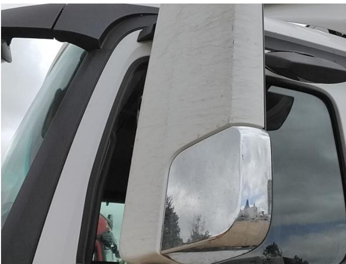
7: Door Mirror Assy nsf Scratched (Painted) Over 25mm Thru Paint