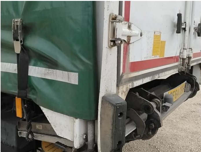
11: Other N/A N/A