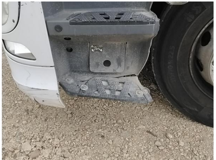
6: Other N/A N/A