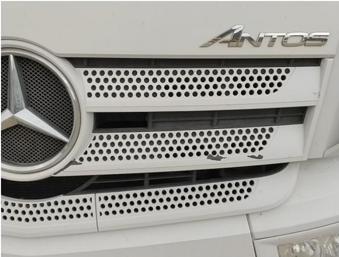
3: Bonnet Scratched Over 25mm Thru Paint