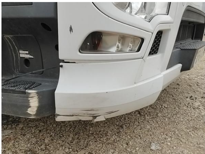
1: Bumper Front Cracked Over 25mm