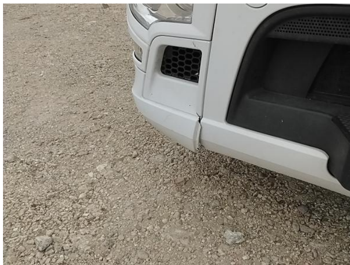
2: Bumper Front Cracked Over 25mm