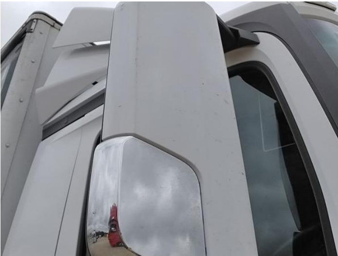
12: Door Mirror Assy osf Scratched (Painted) Over 25mm Thru Paint