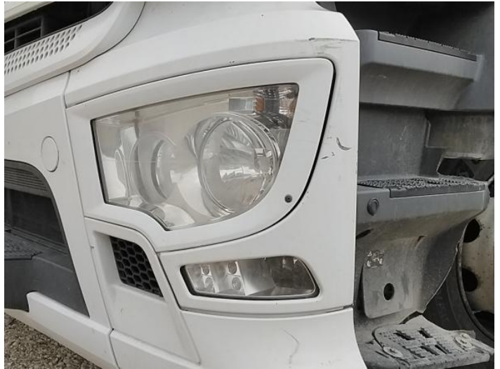
4: Bumper Front Cracked Over 25mm