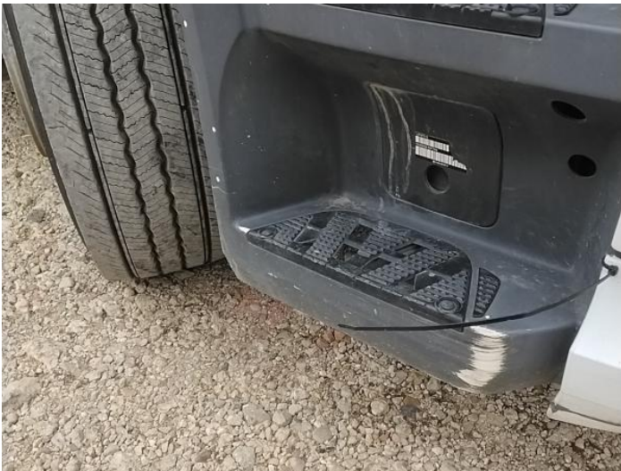
13: Other N/A N/A