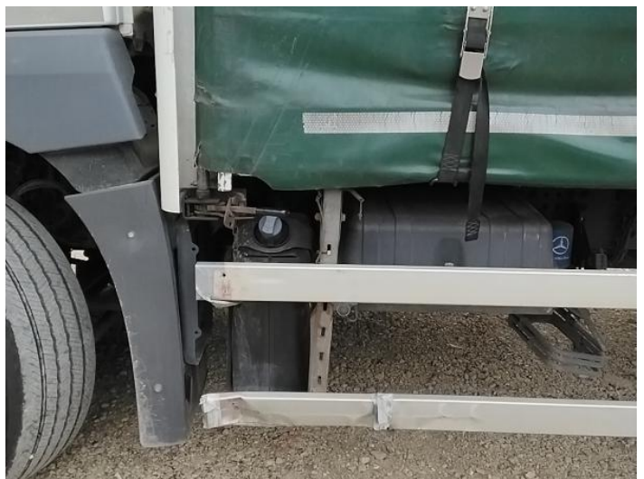
8: Other N/A N/A