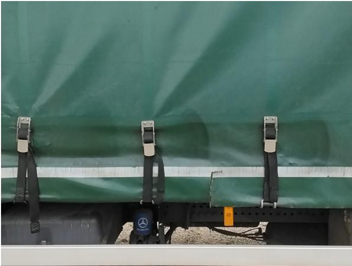
9: Other N/A N/A