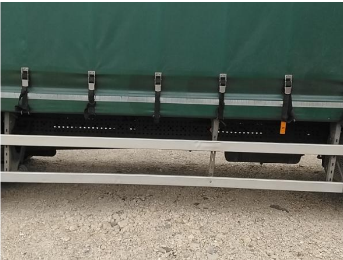
14: Other N/A N/A