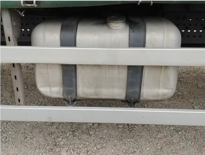
10: Other N/A N/A