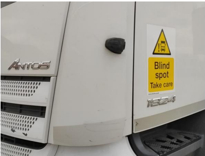
5: Wing nsf Scratched Over 25mm Thru Paint