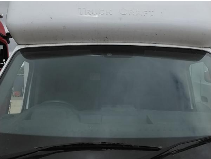
1: Screen Front Chipped Over 10mm