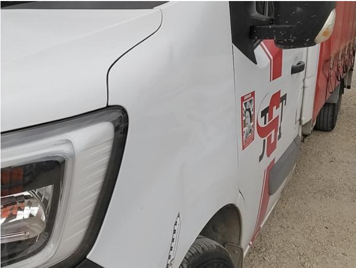
4: Wing nsf Dented Over 30% Of Panel