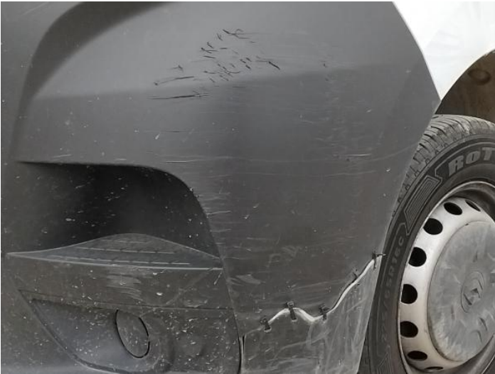
3: Bumper Front Cracked Over 25mm