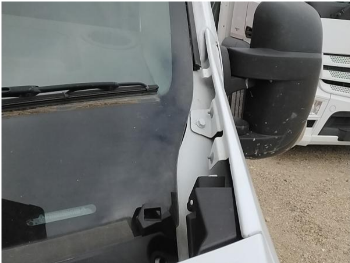
2: Other N/A N/A