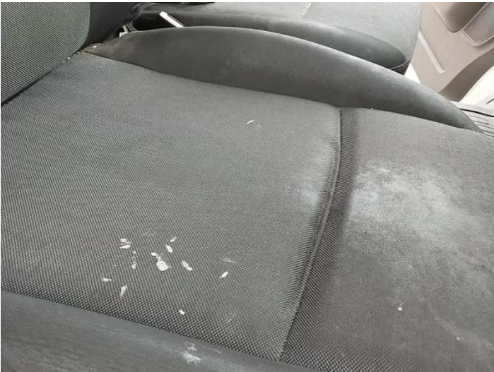
6: Seat Base Cover osf Soiled Heavy