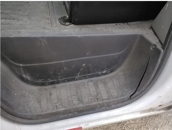
7: Other N/A N/A