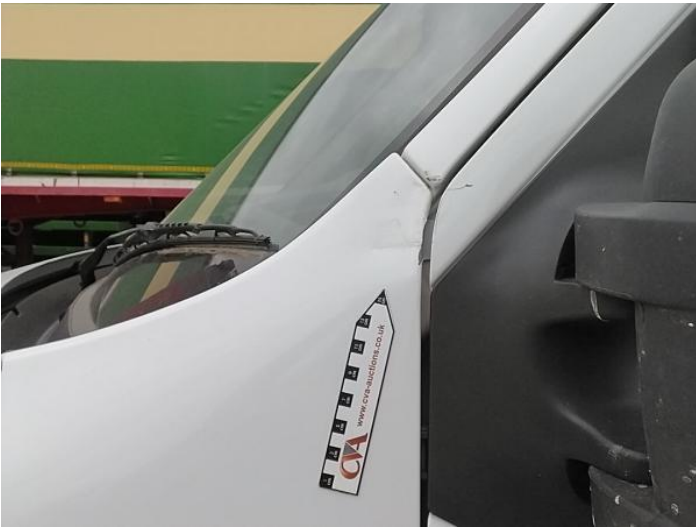
5: Wing nsf Dented With Paint Damage