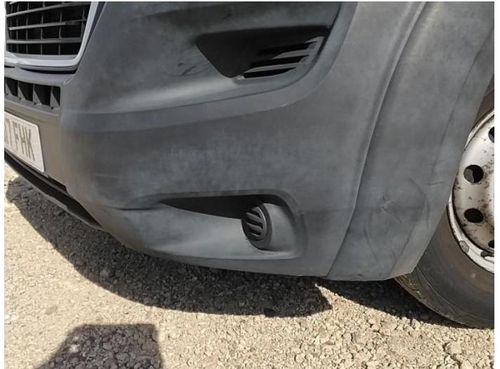
4: Bumper Front Scratched Over 25mm Not Thru Paint