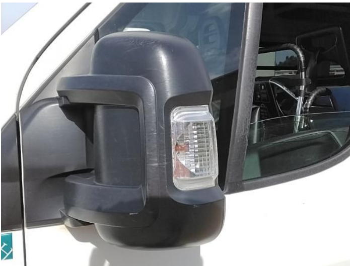
5: Door Mirror Assy nsf Scuffed (Unpainted) UpTo 100mm