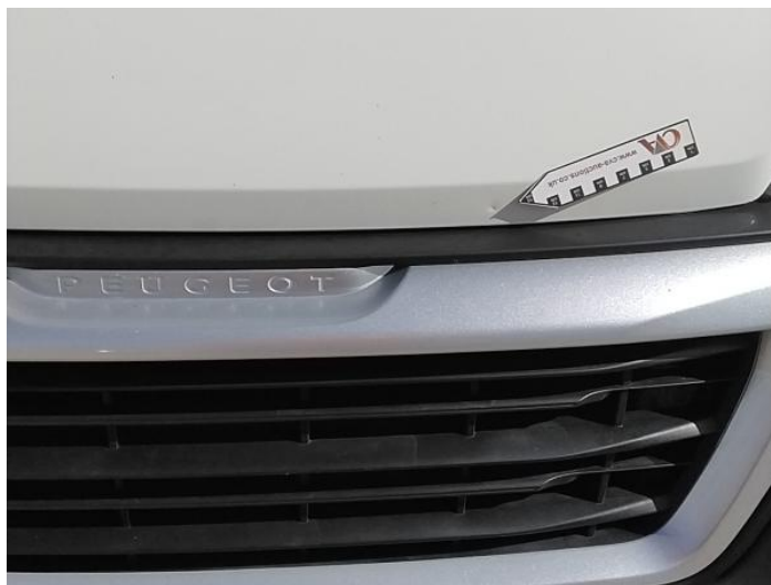
2: Bonnet Dented 2 Or Less UpTo 10mm