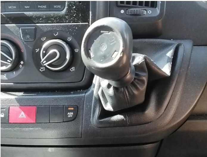
11: Other N/A N/A