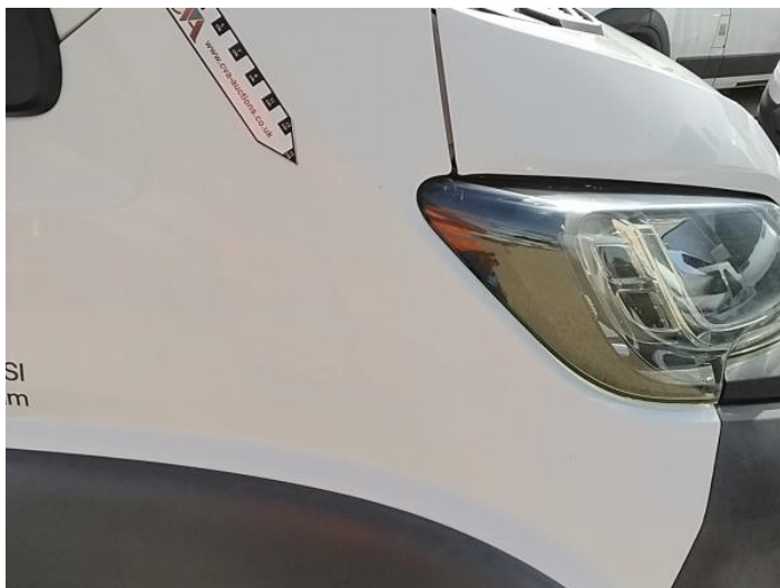
1: Wing osf Chipped Multiple Chips