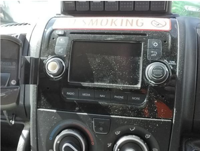
12: Other N/A N/A