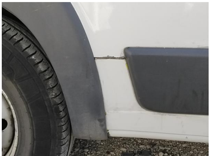
8: Qtr Panel osr Chipped Edge Chip