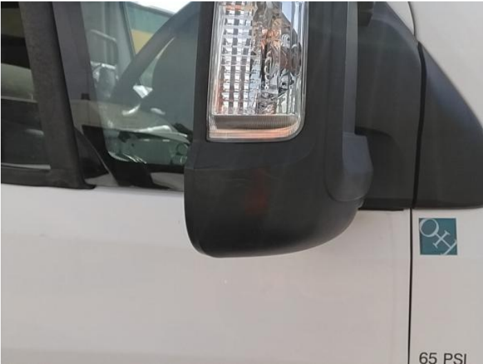
10: Door Mirror Assy osf Scuffed (Unpainted) UpTo 100mm