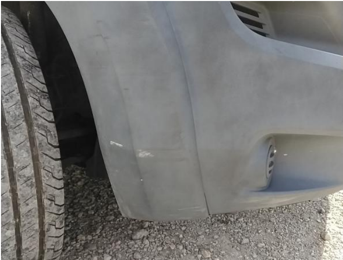
3: Bumper Front Scratched Over 25mm Not Thru Paint