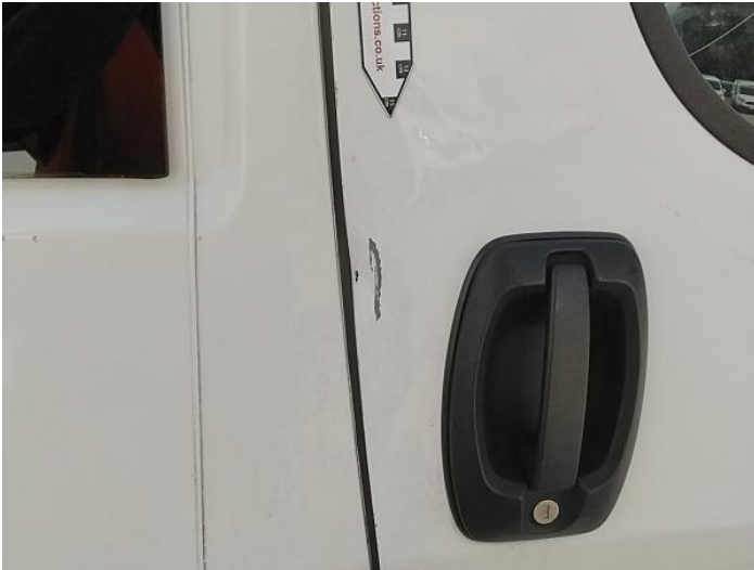
9: Door osf Dented With Paint Damage