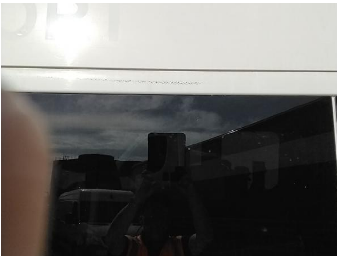
7: Qtr Panel nsr Scratched Over 25mm Not Thru Paint