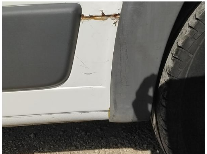
6: Qtr Panel nsr Rusted Over 5mm