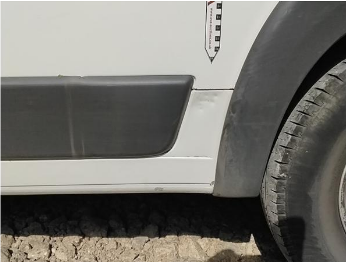
4: Qtr Panel nsr Dented Over 30mm