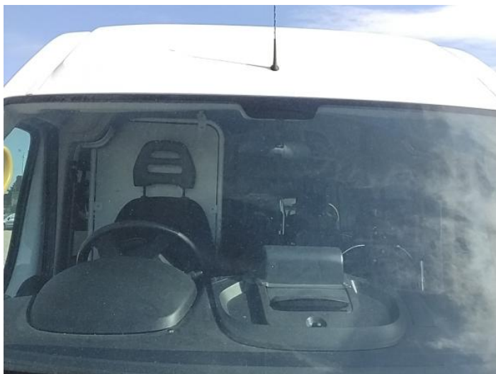
1: Screen Front Chipped Over 10mm