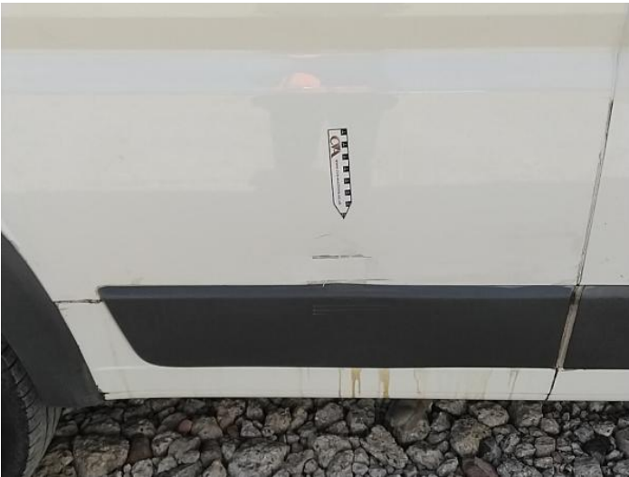
6: Qtr Panel osr Dented With Paint Damage