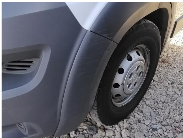
2: Moulding nsf Wing Scuffed (Unpainted) Over 100mm