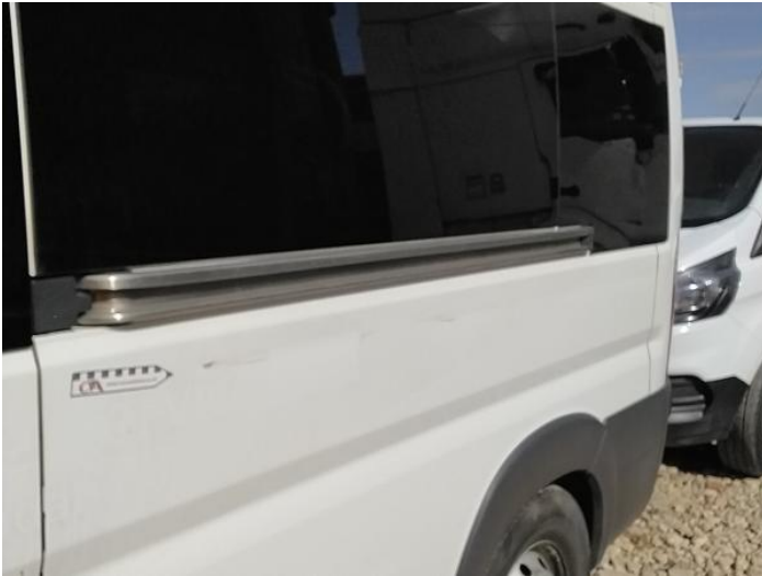
3: Qtr Panel nsr Dented Over 30mm