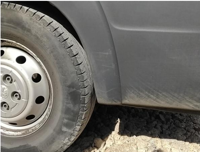
5: Qtr Panel Moulding ns Scuffed (Unpainted) Over 100mm