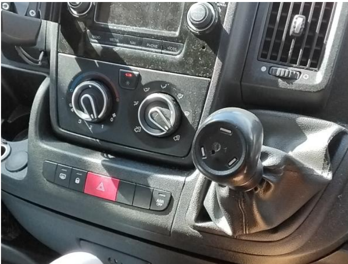
7: Other N/A N/A