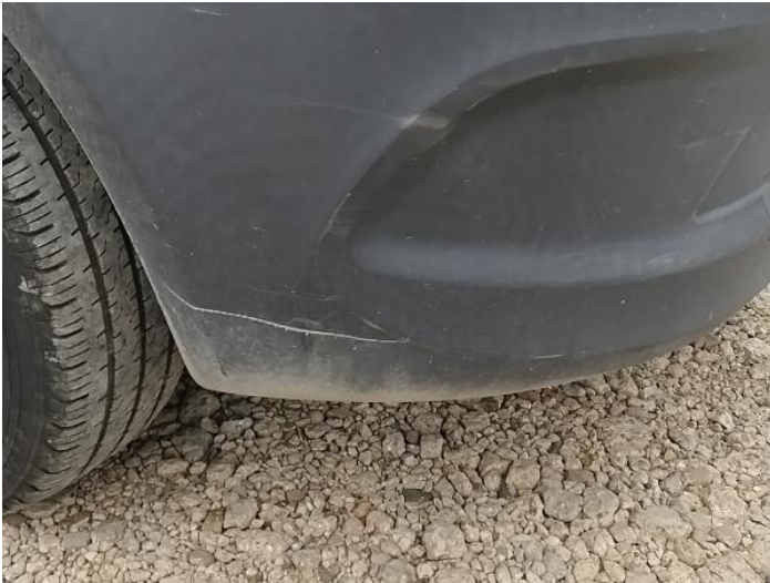
3: Bumper Front Scratched Over 100mm Thru Paint