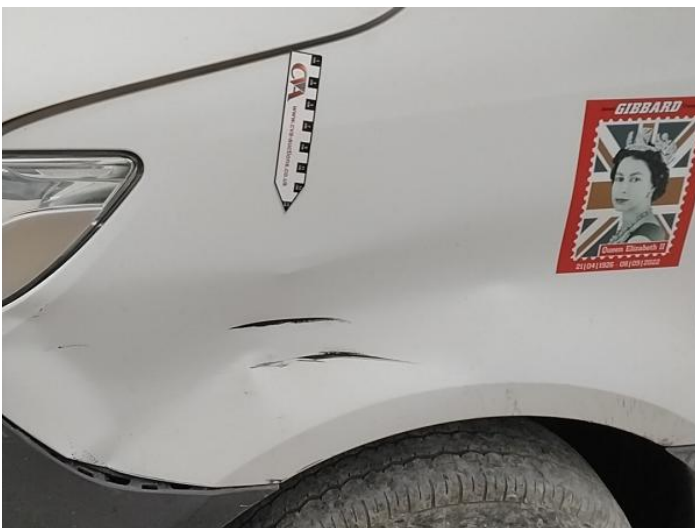
7: Wing nsf Dented With Paint Damage