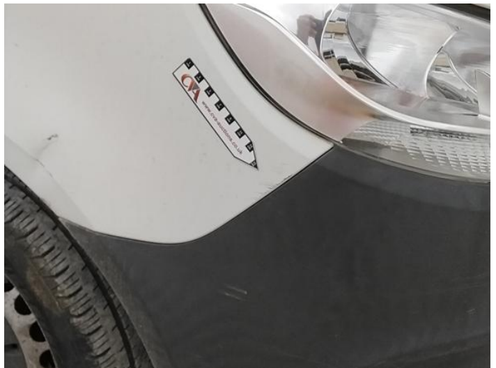
2: Wing osf Scratched Over 25mm Thru Paint