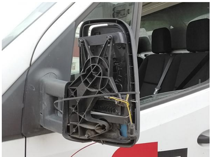
8: Door Mirror Assy nsf Missing Replace