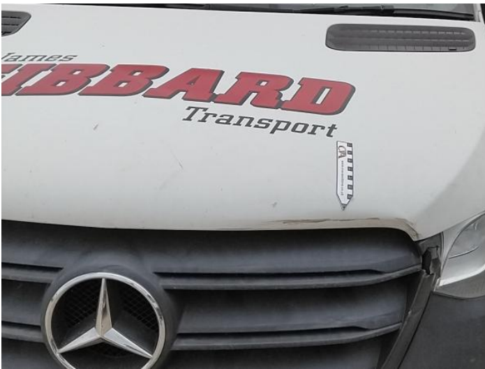
5: Bonnet Dented With Paint Damage