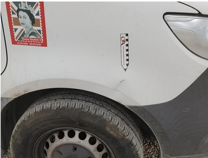
1: Wing osf Dented With Paint Damage