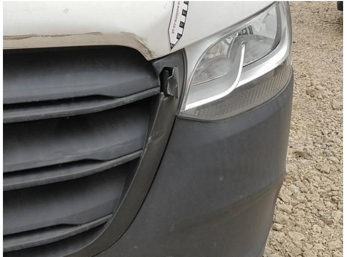
4: Grille Front Broken Replace