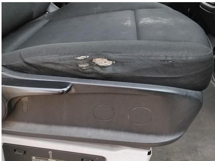
15: Seat Base Cover osf Torn Over 3mm