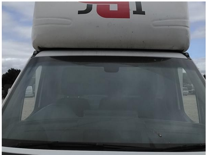
6: Screen Front Cracked Replace