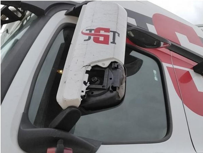
9: Door Mirror Assy nsf Broken Replace