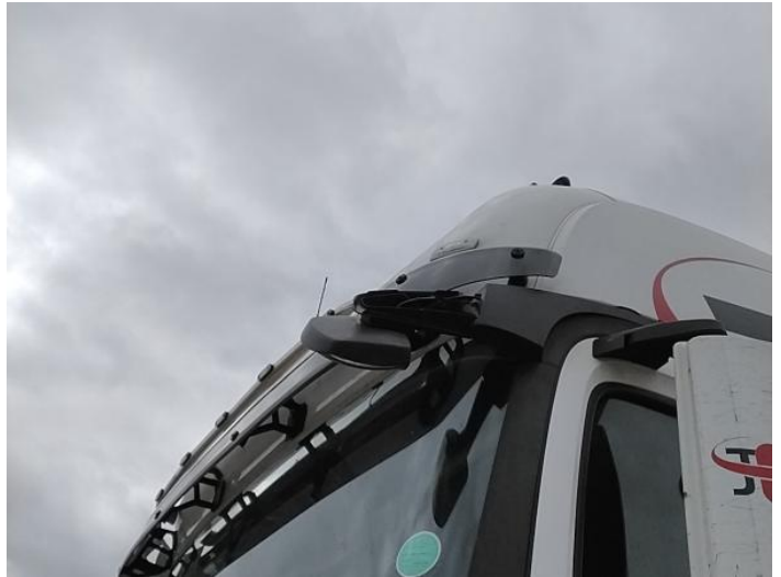
10: Door Mirror Assy nsf Missing Replace