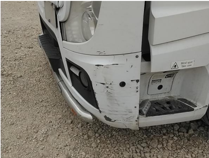
5: Bumper Front Cracked Over 25mm