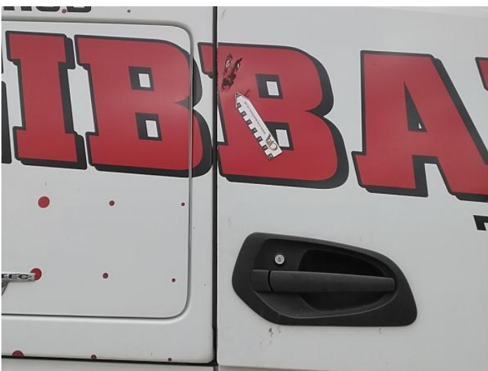
13: Door osf Dented With Paint Damage