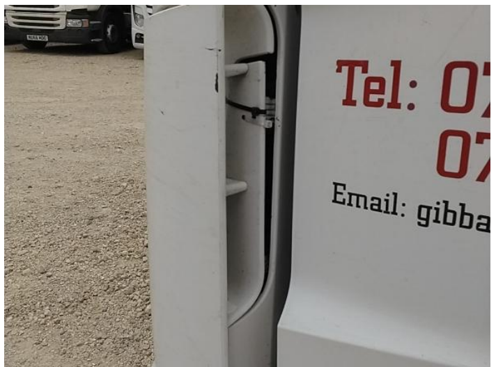
8: Wing nsf Poor Previous Repair Poor Paint