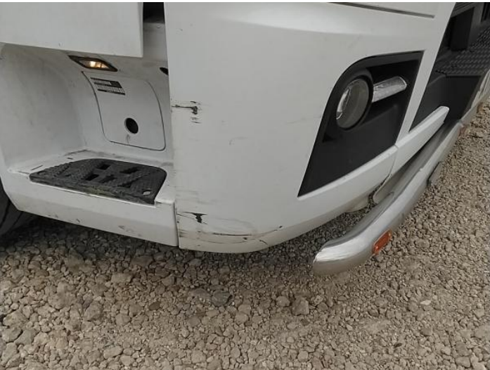
1: Bumper Front Scratched Over 100mm Thru Paint