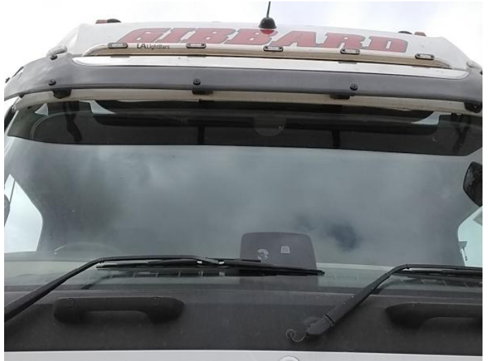
4: Screen Front Chipped Over 10mm