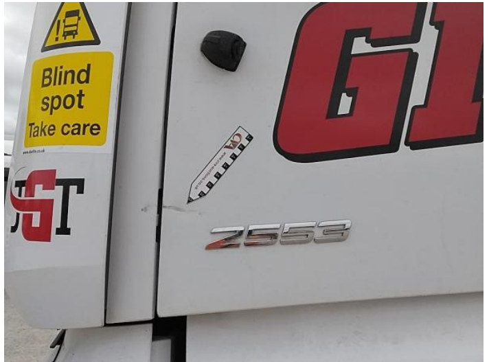
6: Door nsf Dented Over 30mm