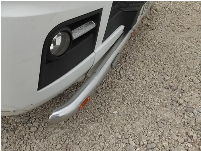
2: Other N/A N/A