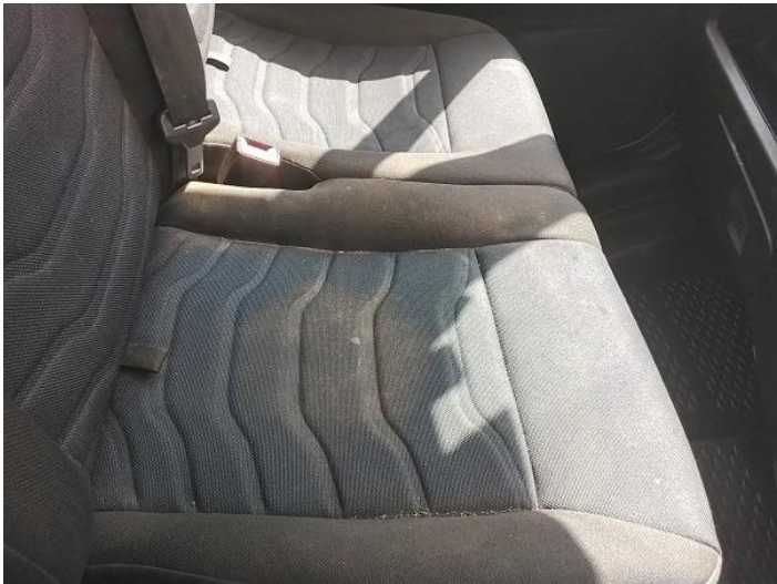
6: Seat Base Cover nsf Soiled Heavy