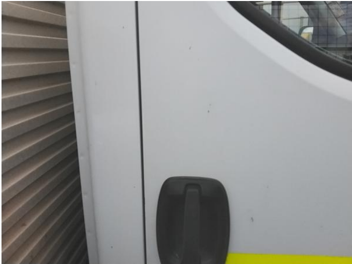
4: Door osf Chipped Multiple Chips