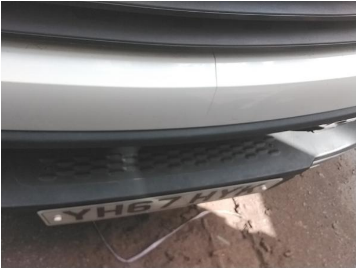
3: Bumper Front Cracked Over 25mm