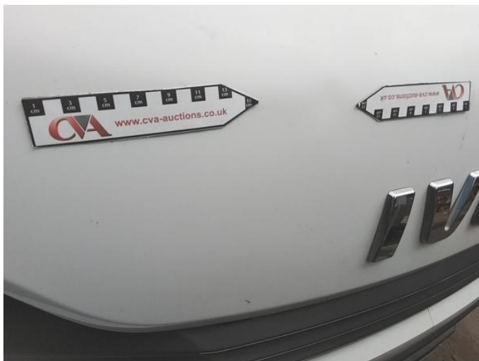
1: Bonnet Dented Over 30mm