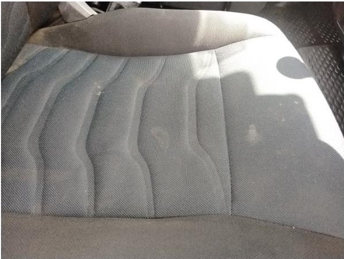
5: Seat Base Cover osf Soiled Light