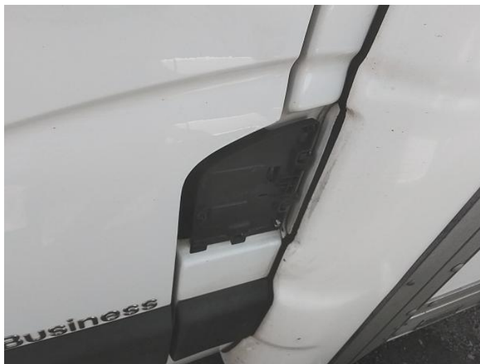
2: Fuel Flap Cracked Replace