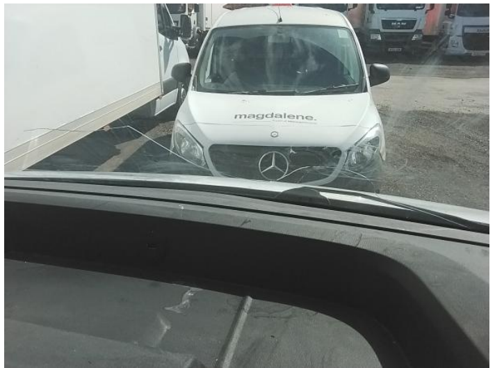
12: Screen Front Cracked Replace