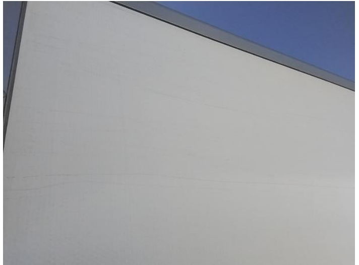
4: Qtr Panel nsr Scratched Over 25mm Not Thru Paint