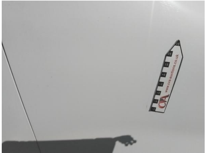
10: Wing osf Scratched Over 25mm Not Thru Paint