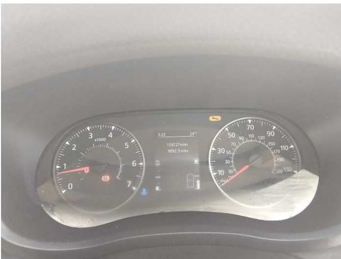
13: Dash Warning Lights Displayed No Action