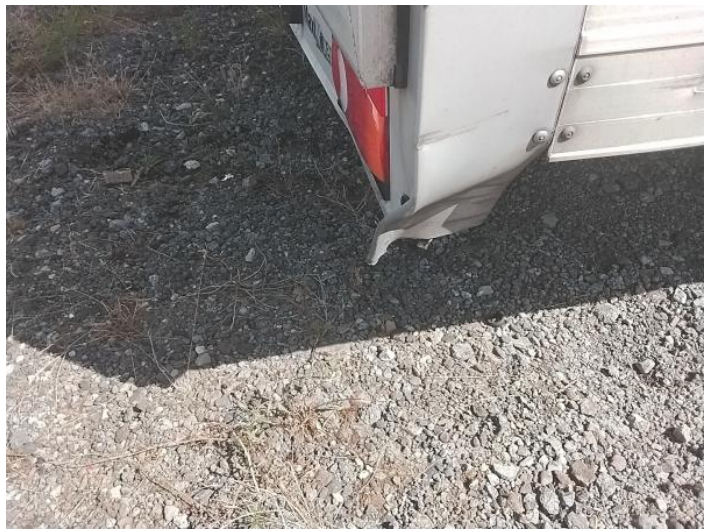
6: Qtr Panel Trim os Broken Replace