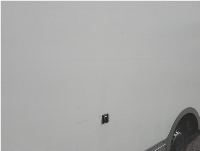
9: Qtr Panel osr Scratched Over 25mm Not Thru Paint