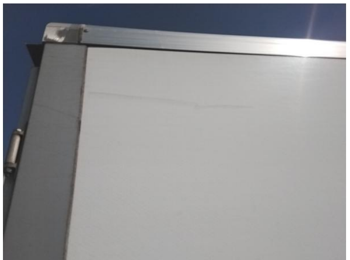
8: Qtr Panel osr Scratched Over 25mm Thru Paint