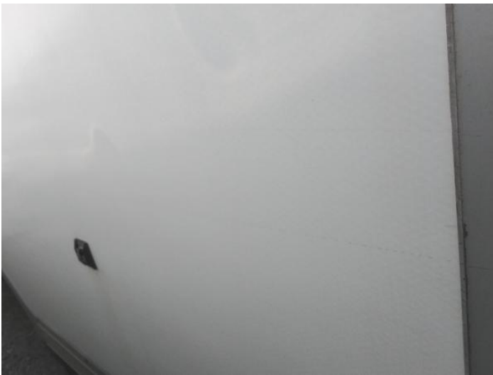
5: Qtr Panel nsr Scratched Over 25mm Not Thru Paint