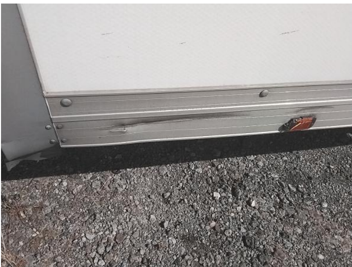
7: Qtr Panel Trim os Broken Replace