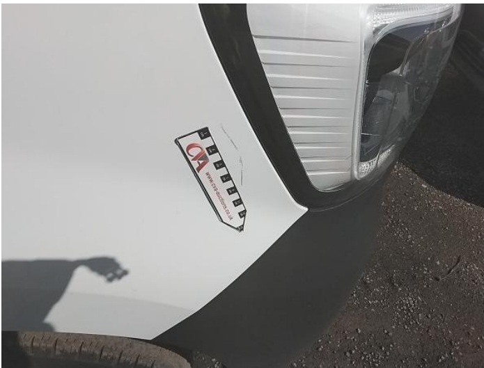
11: Wing osf Scratched Over 25mm Not Thru Paint