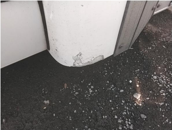
3: Qtr Panel Trim ns Broken Replace