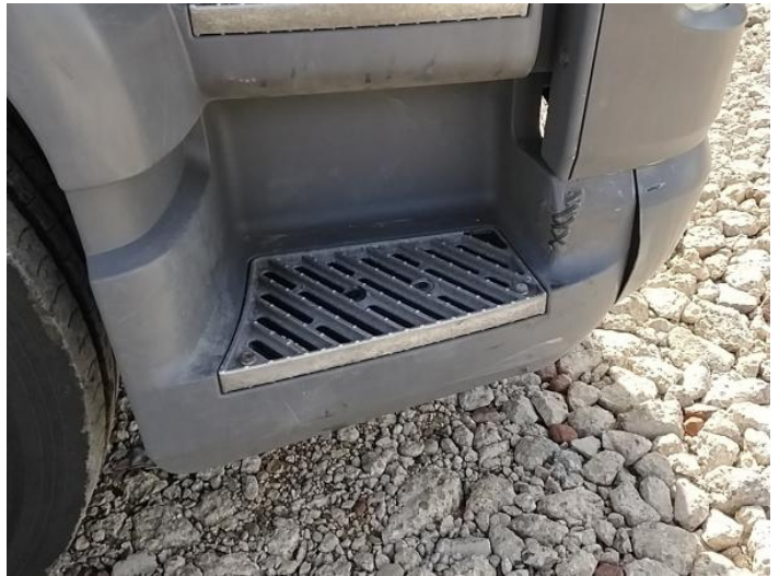
12: Other N/A N/A