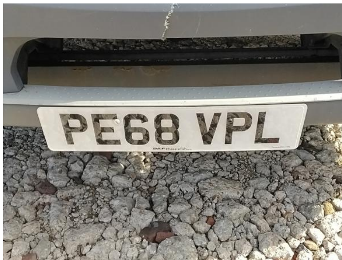
2: Bumper Front Cracked Over 25mm