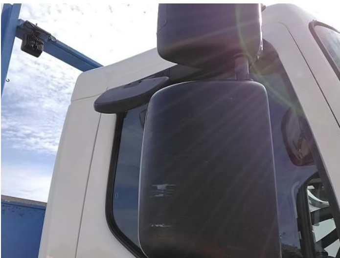
13: Door Mirror Assy osf Broken Replace