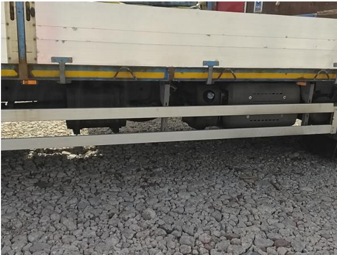
11: Other N/A N/A