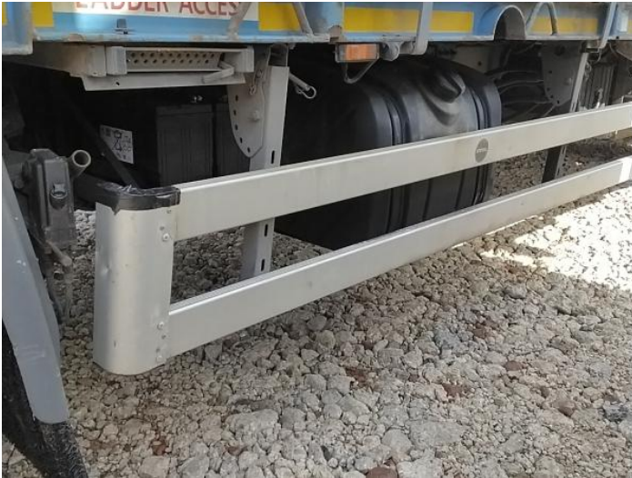
9: Other N/A N/A