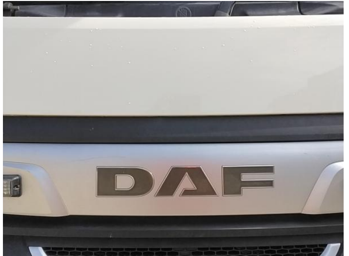
4: Other N/A N/A