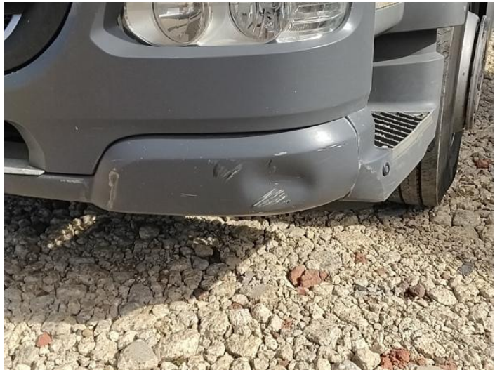
6: Bumper Front Dented With Paint Damage