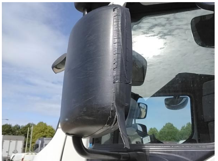
8: Door Mirror Assy nsf Broken Replace