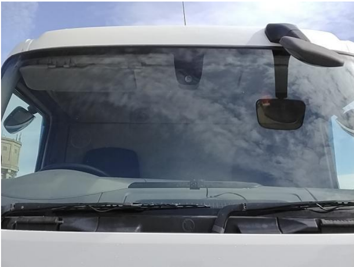
5: Screen Front Chipped UpTo 10mm