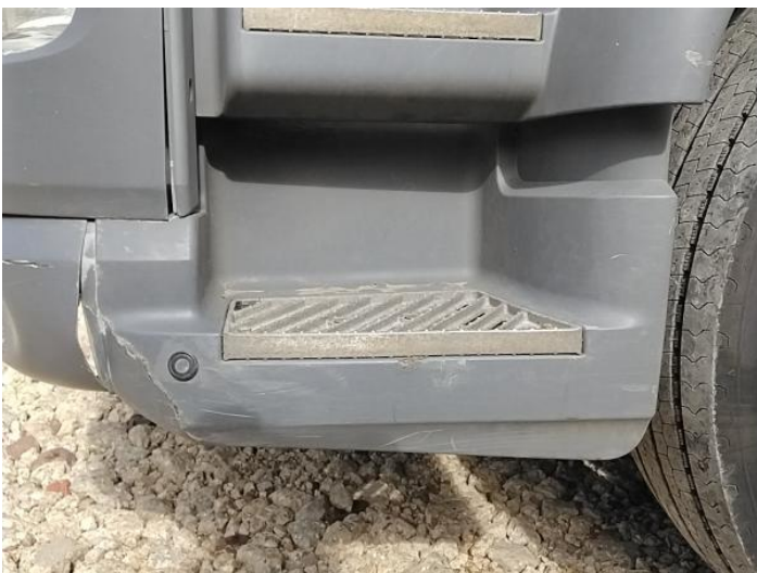
7: Other N/A N/A