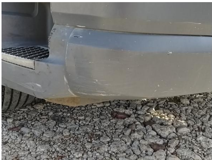
1: Bumper Front Scratched 25 to 100mm Thru Paint