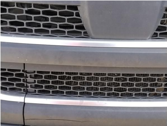
3: Other N/A N/A