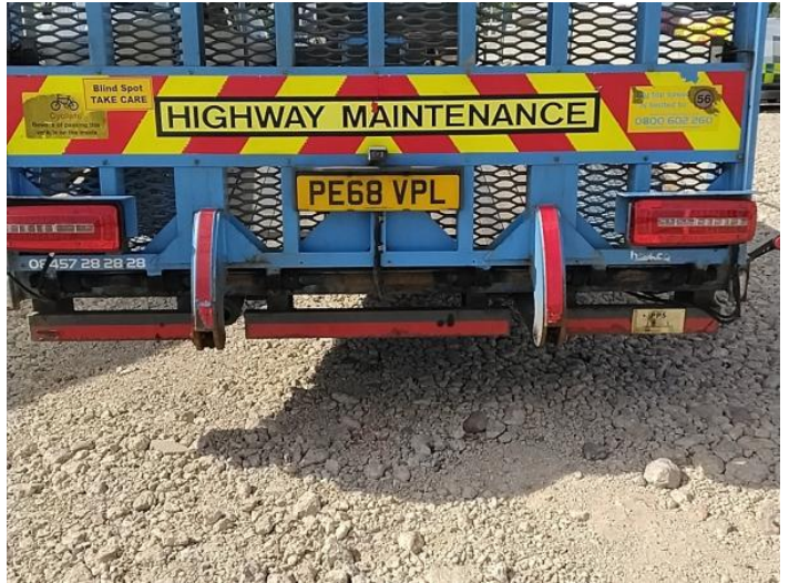
10: Bumper Rear Rusted Over 5mm