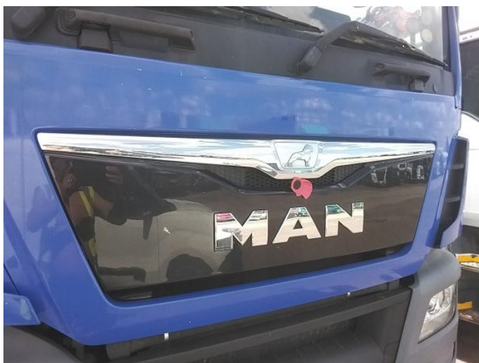
1: Bonnet Chipped Multiple Chips