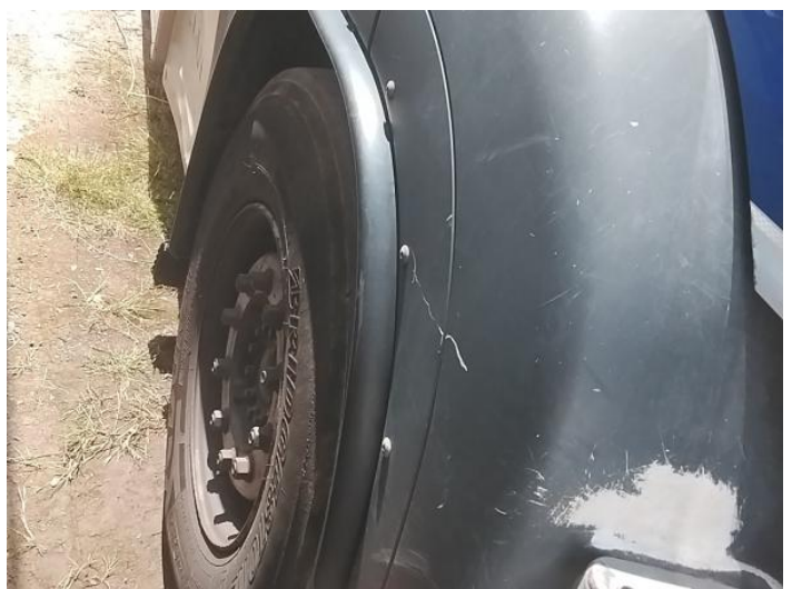
8: Wing osf Scratched Over 25mm Thru Paint