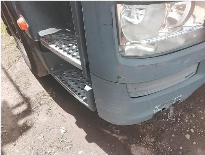
3: Bumper Front Scratched Over 100mm Thru Paint