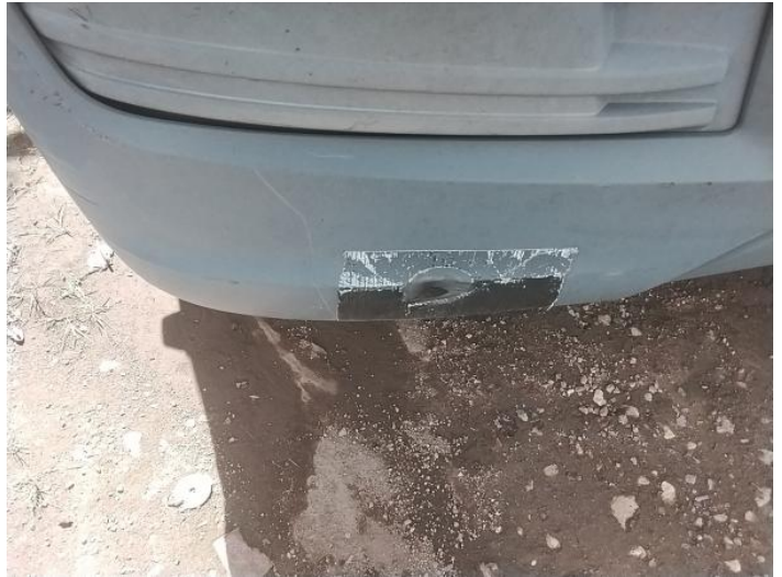
4: Bumper Front Hole Over 25mm