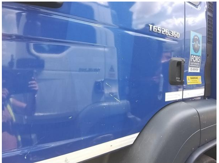
6: Door nsf Scratched Over 25mm Thru Paint