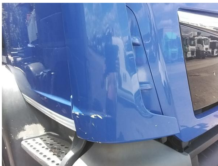
2: Panel Front Scratched Over 25mm Thru Paint