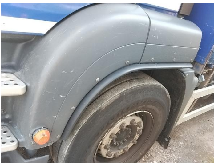
7: Door nsf Scratched Over 25mm Thru Paint