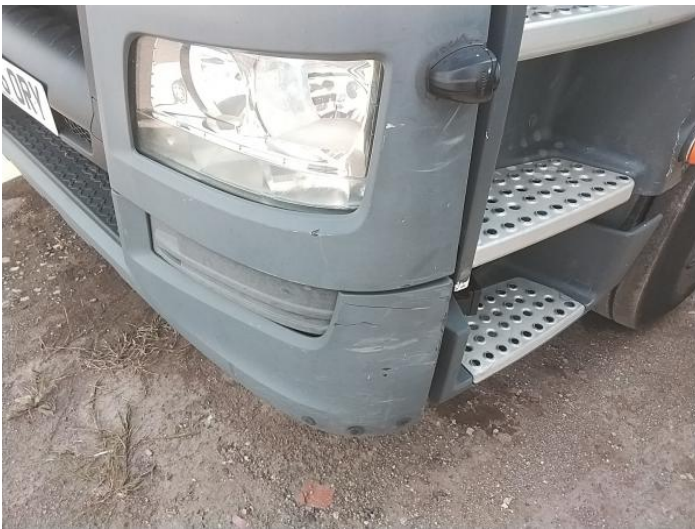
5: Bumper Front Scratched Over 100mm Thru Paint