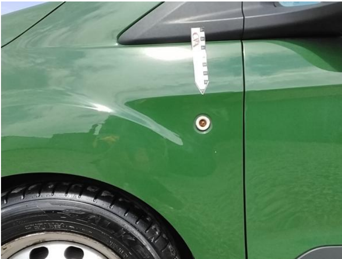
5: Flasher Side Repeater ns Missing Replace