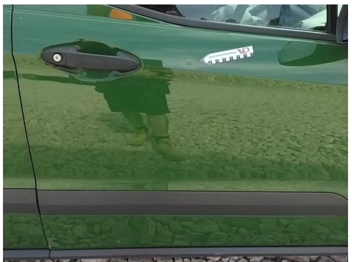
14: Door osf Dented Over 2 UpTo 10mm