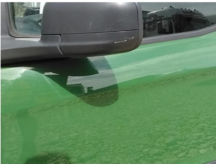
7: Door Mirror Assy nsf Scuffed (Unpainted) UpTo 100mm