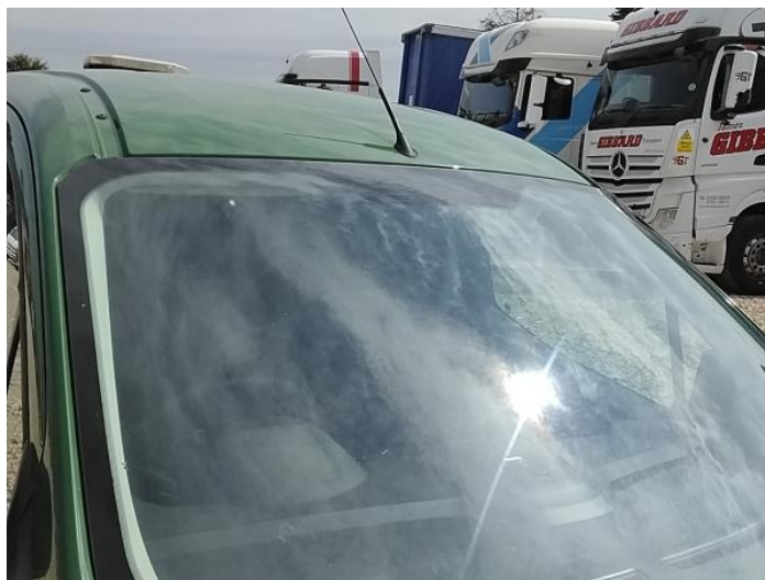
2: Screen Front Chipped Over 10mm