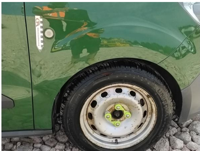
1: Wing of Dented Over 30mm