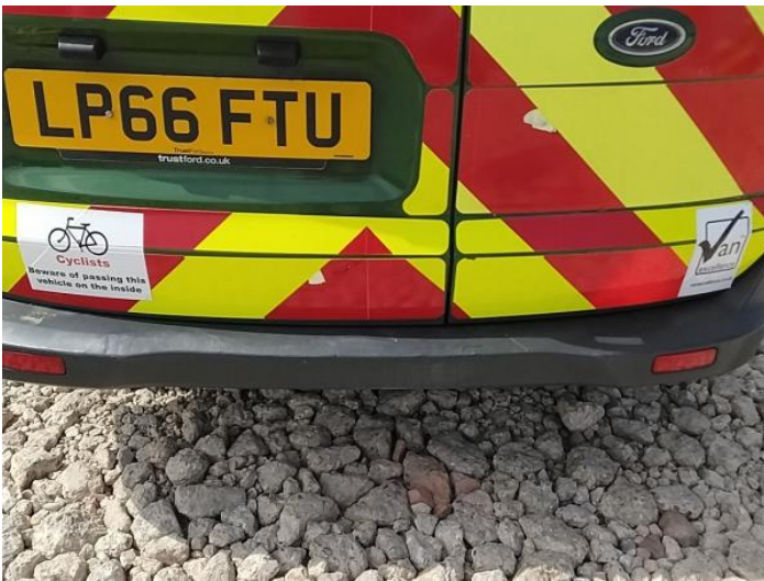
11: Bumper Rear Scratched Over 25mm Not Thru Paint