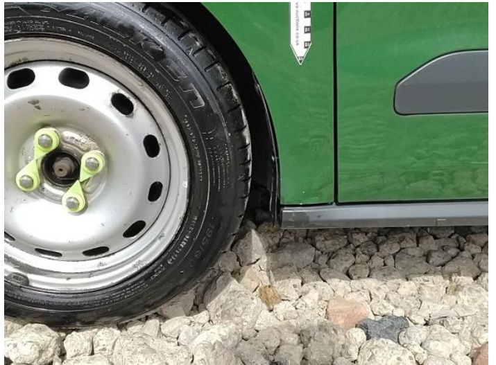
6: Wing nsf Dented With Paint Damage