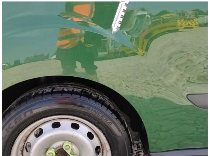
12: Qtr Panel osr Scratched Over 25mm Thru Paint