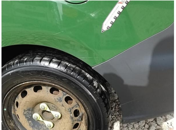
10: Qtr Panel nsr Dented Over 2 UpTo 10mm