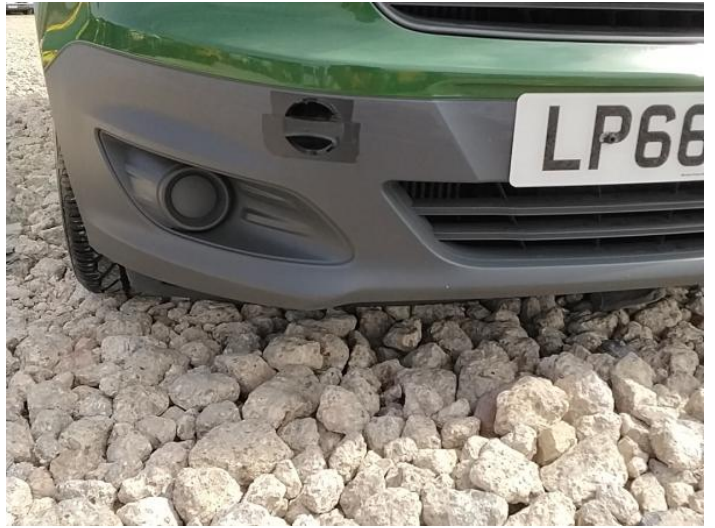
4: Front TowEye Cvr Missing Replace