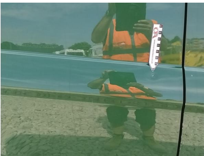
13: Qtr Panel osr Dented With Paint Damage