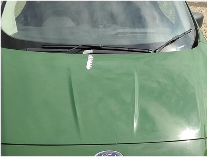
3: Bonnet Chipped Multiple Chips