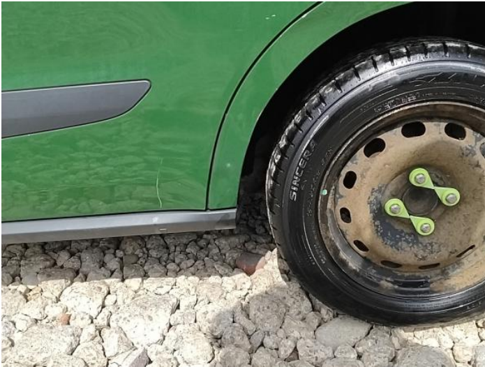
9: Door nsr Scratched Over 25mm Thru Paint