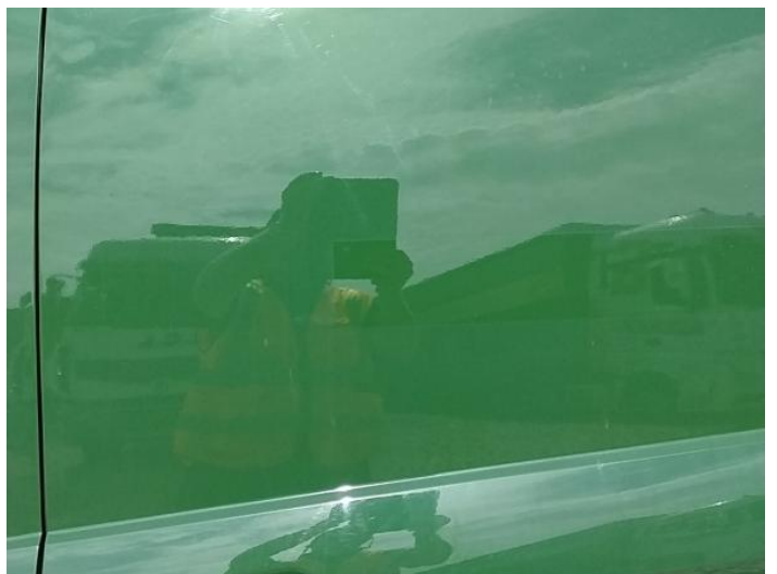
8: Door nsr Dented 2 Or Less UpTo 10mm