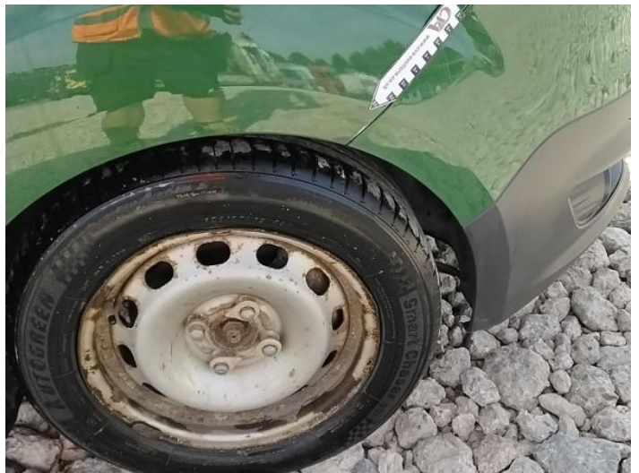
2: Wing osf Scratched UpTo 25mm Thru Paint