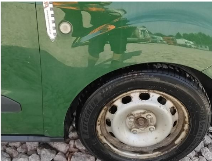
1: Wing osf Dented Over 2 UpTo 10mm