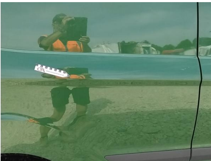
13: Qtr Panel osr Scratched Over 25mm Thru Paint