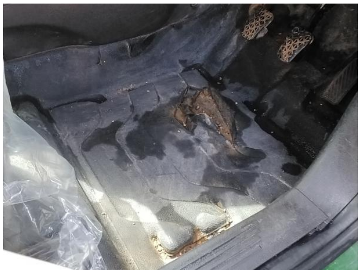
14: Carpets Front Holed Over 3mm