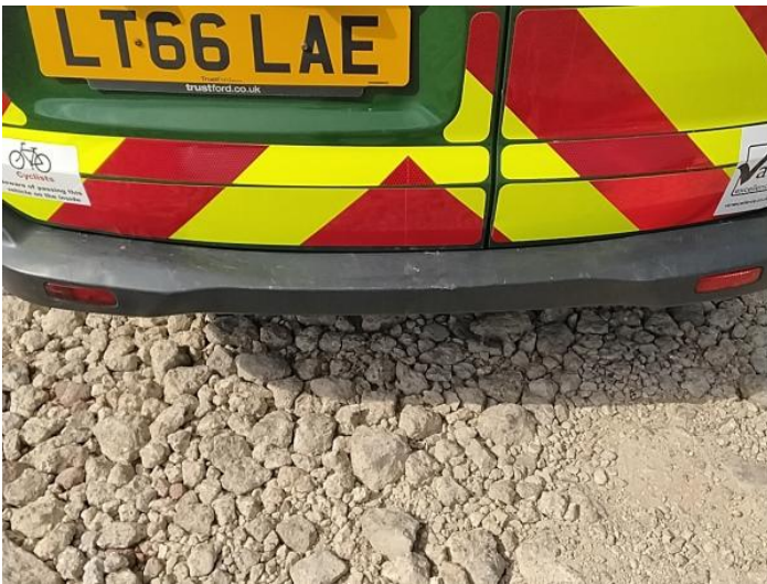
11: Bumper Rear Scratched Over 25mm Not Thru Paint