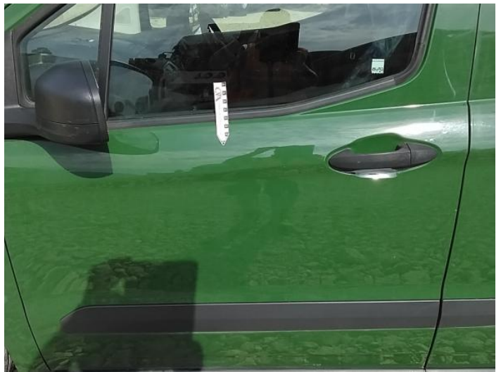
6: Door nsf Chipped 1 To 5