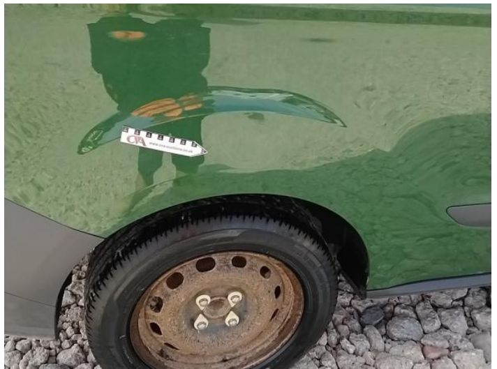
12: Qtr Panel osr Dented Over 30mm