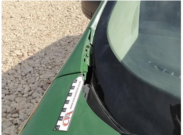
4: Other N/A N/A