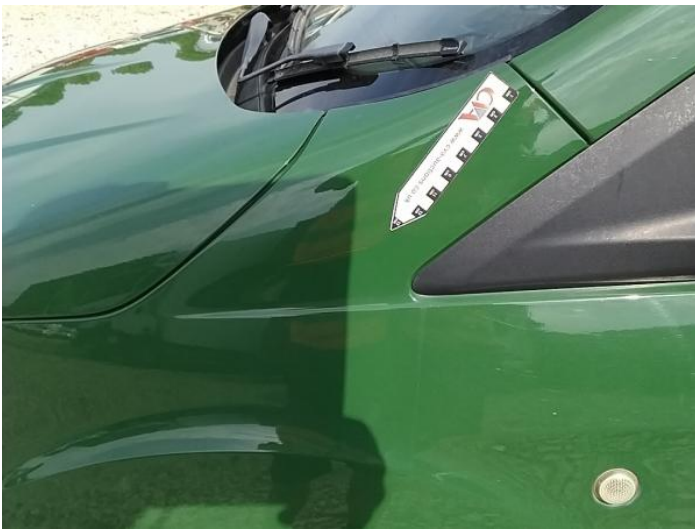
5: Wing nsf Scratched Over 25mm Thru Paint