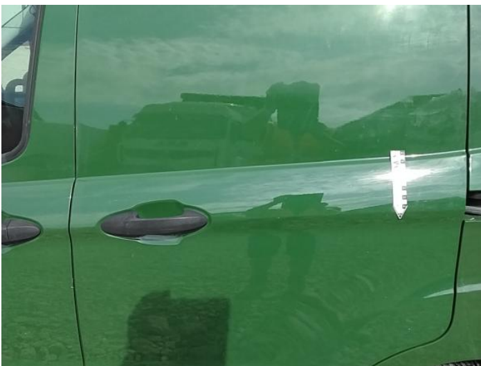
7: Door nsr Chipped Multiple Chips