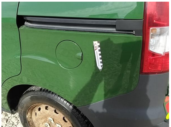
8: Qtr Panel nsr Scratched Over 25mm Thru Paint