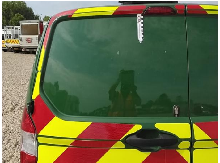
10: Door nsr Chipped 1 To 5