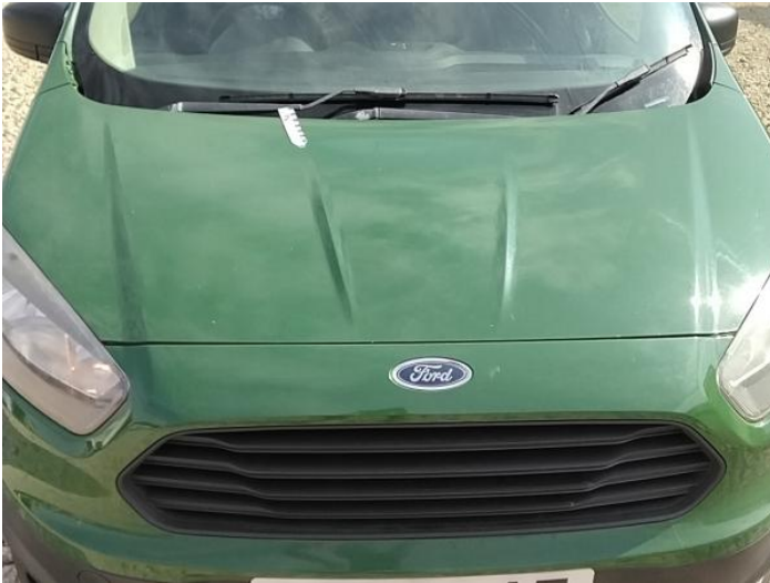
3: Bonnet Chipped Multiple Chips