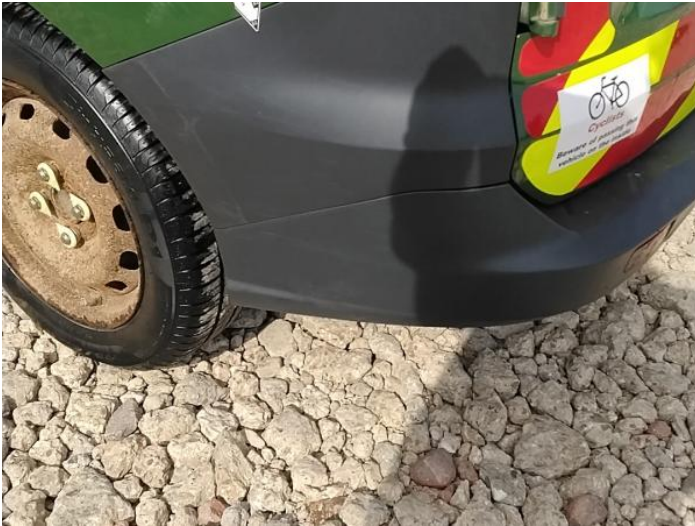
9: Qtr Panel Trim ns Scuffed Over 25mm