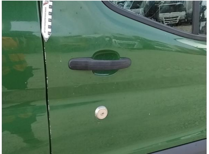
10: Door osf Chipped Edge Chip