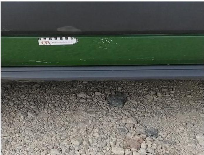
11: Qtr Panel osr Scratched Over 25mm Thru Paint