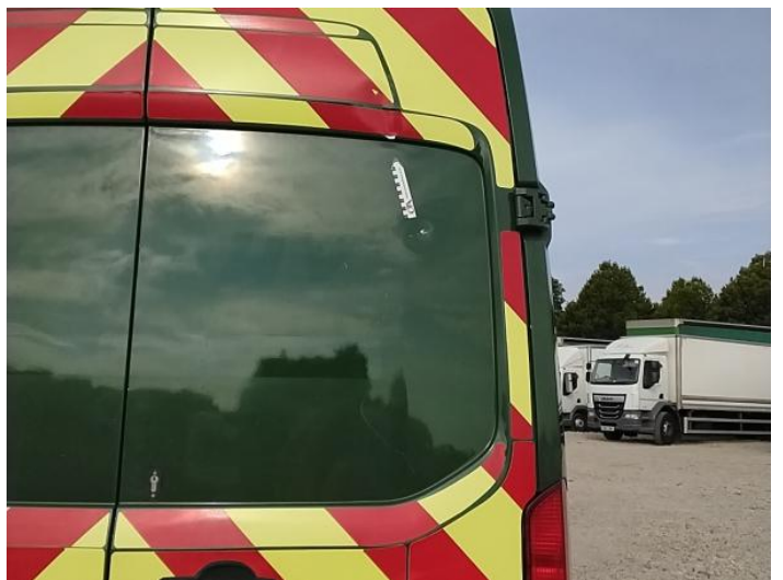
8: Door osr Dented With Paint Damage