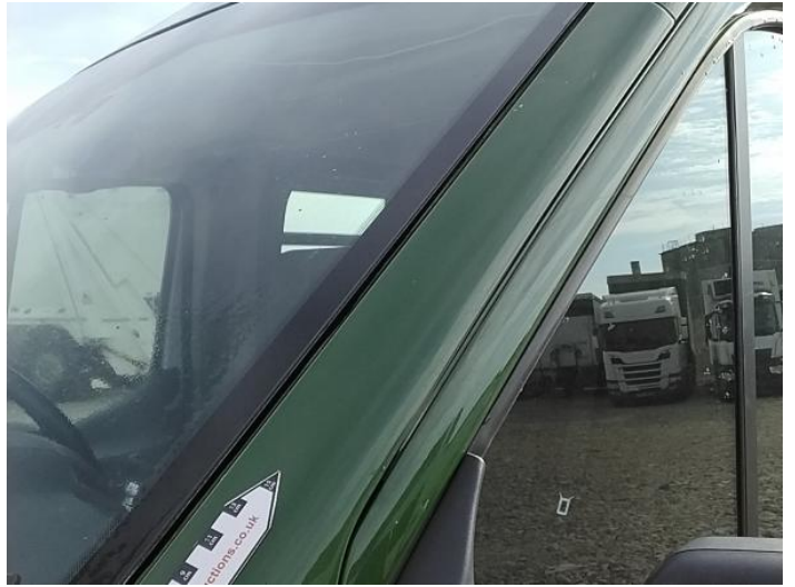
4: A Post ns Chipped Multiple Chips