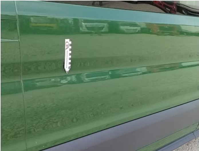
9: Qtr Panel osr Dented 2 Or Less UpTo 10mm