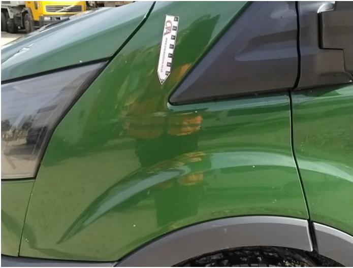
3: Wing nsf Chipped Multiple Chips