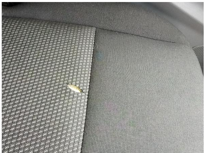
14: Seat Base Cover nsf Holed Over 3mm