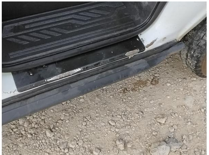
12: Sill os Rusted Over 5mm