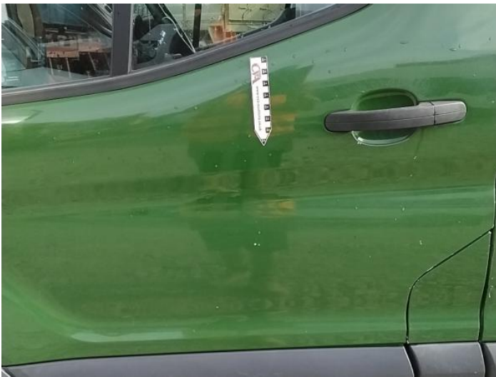
5: Door nsf Chipped Multiple Chips