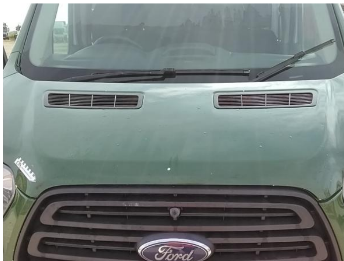
2: Bonnet Rusted Over 5mm