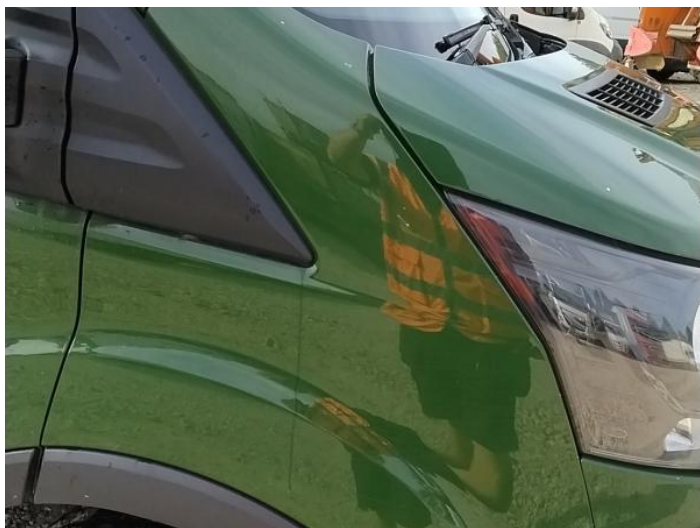
1: Wing of Chipped Multiple Chips