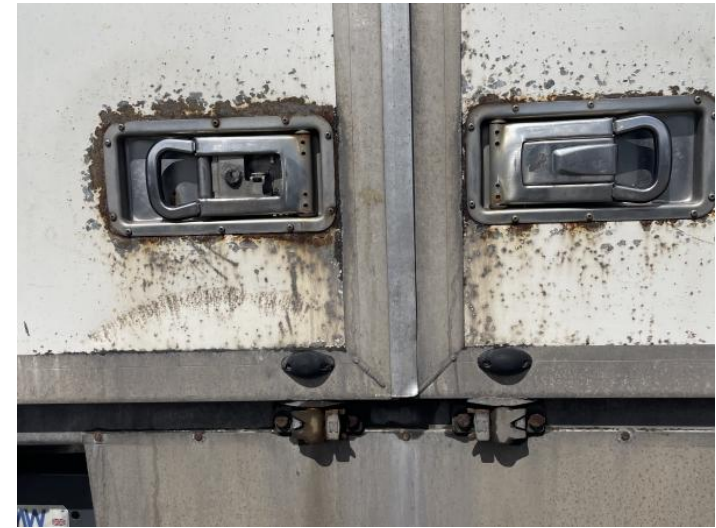
7: Tailgate Rusted Over 5mm