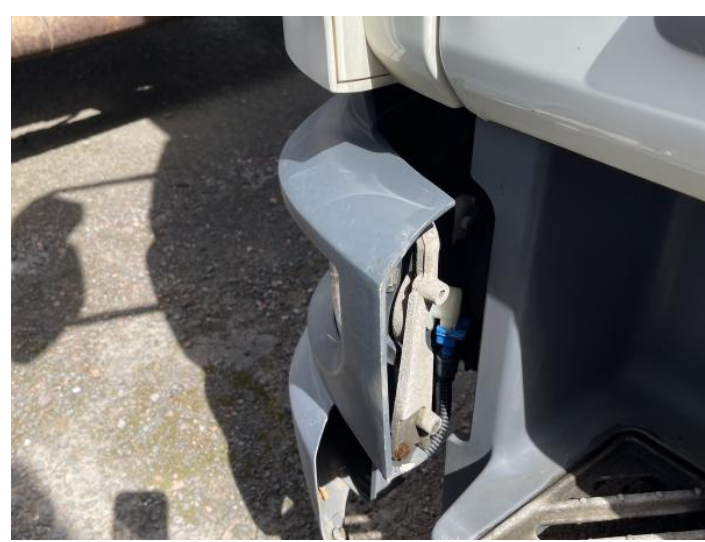
10: Door Moulding nsf Missing Replace