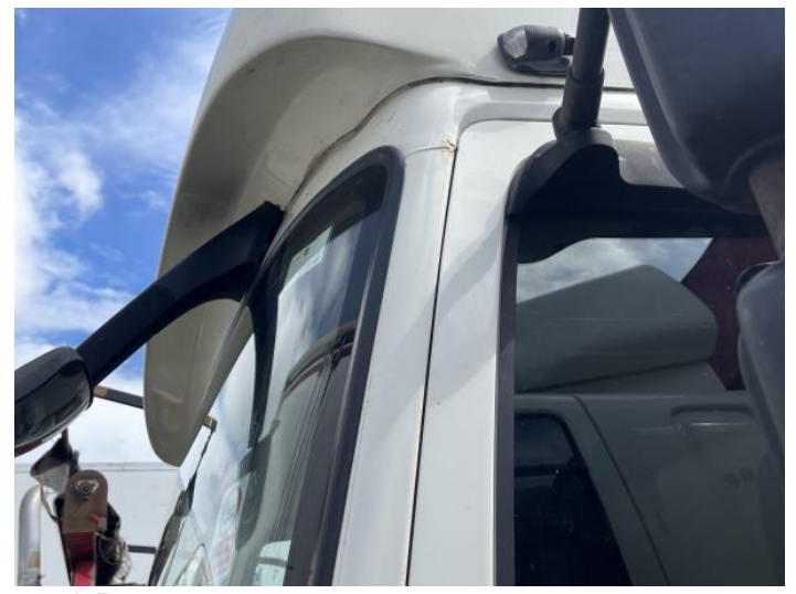
11: A Post ns Rusted Over 5mm