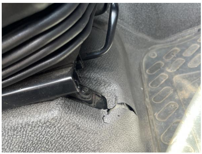
2: Carpets Front Torn Over 10mm