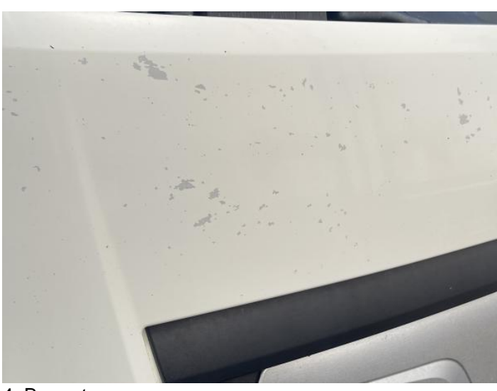
4: Bonnet Scratched Over 25mm Thru Paint