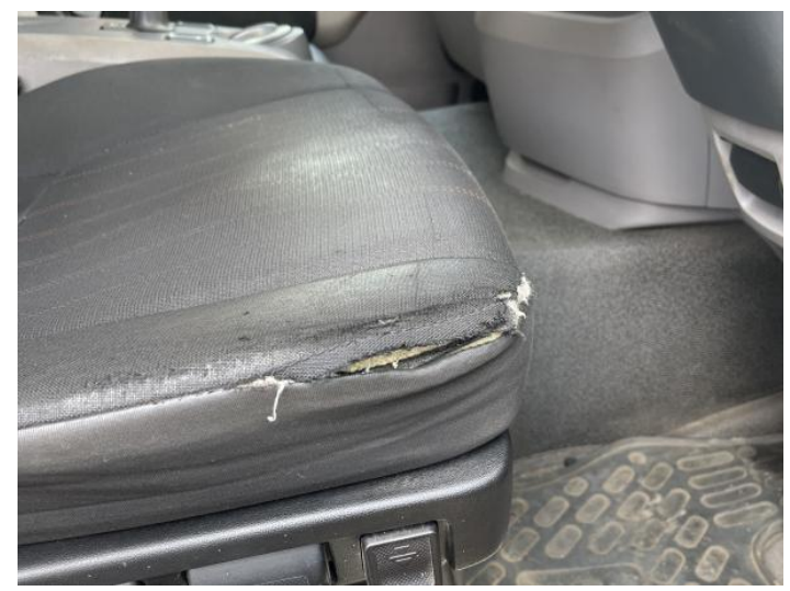
1: Seat Base Cover osf Torn Over 3mm