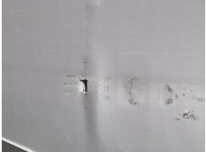
8: Qtr Panel nsr Hole UpTo 10mm