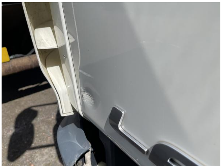
9: Door osf Dented Over 30mm