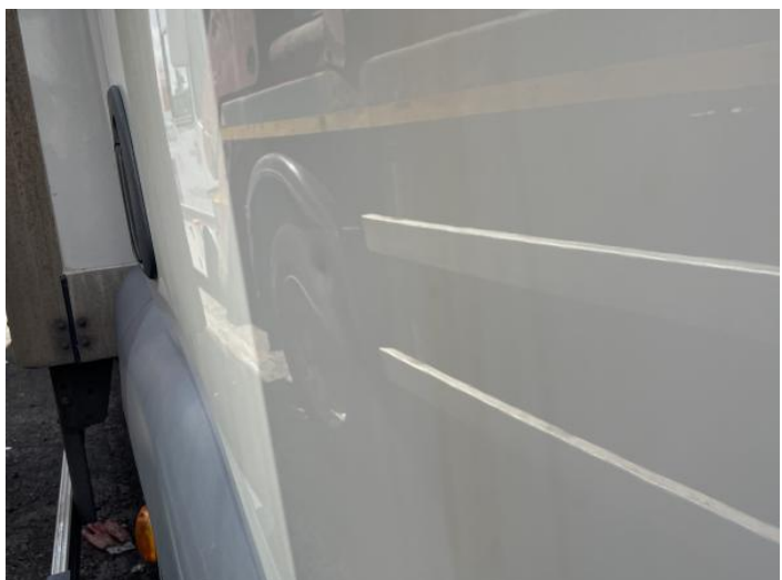
6: Door osf Dented With Paint Damage