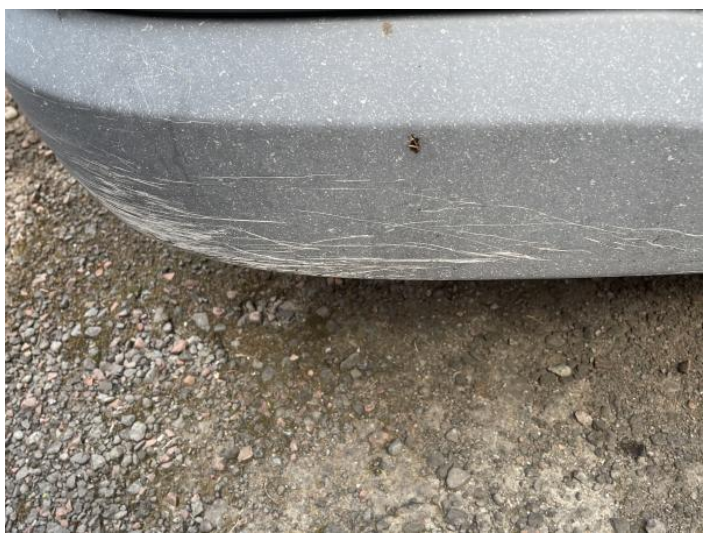
5: Bumper Front Moulding Scuffed (Unpainted) Over 100mm