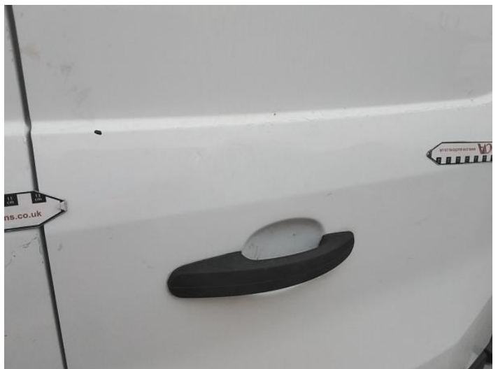
14: Door osr Dented Over 30mm