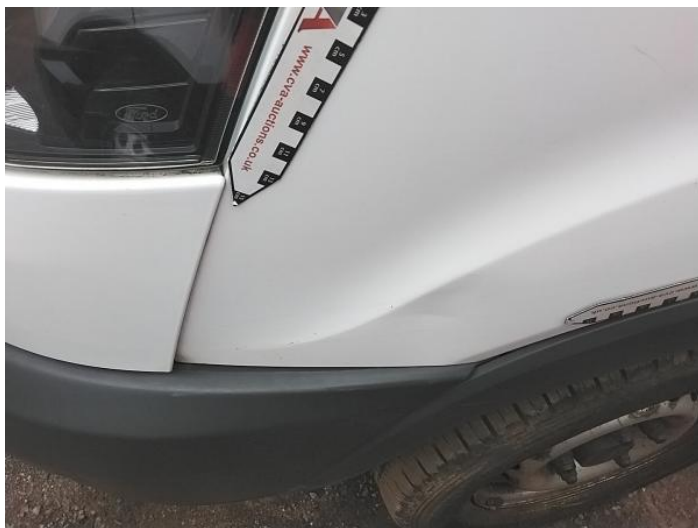
1: Wing nsf Dented Over 30mm