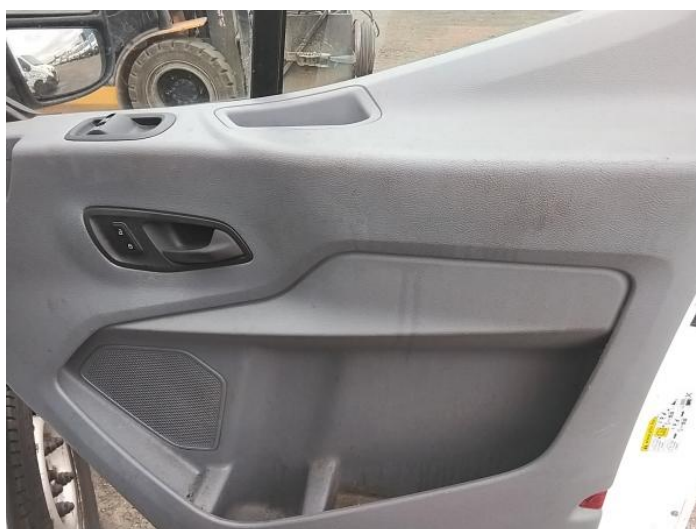
18: Door Pad osf Soiled Heavy