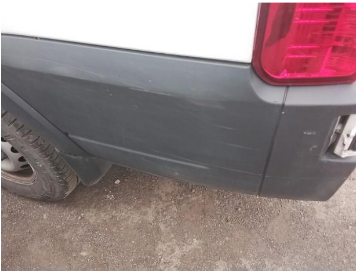
11: Qtr Panel Moulding ns Scuffed (Unpainted) Over 100mm