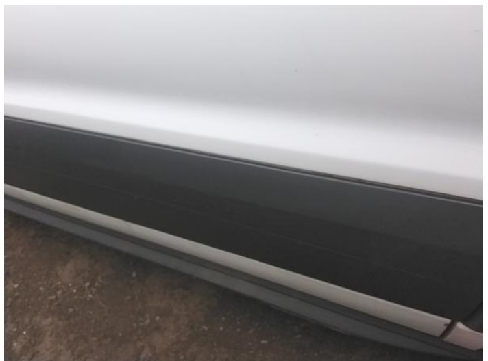
8: Qtr Panel Moulding ns Scuffed (Unpainted) Over 100mm