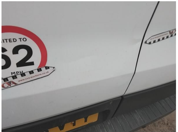
12: Door nsr Dented Over 30mm