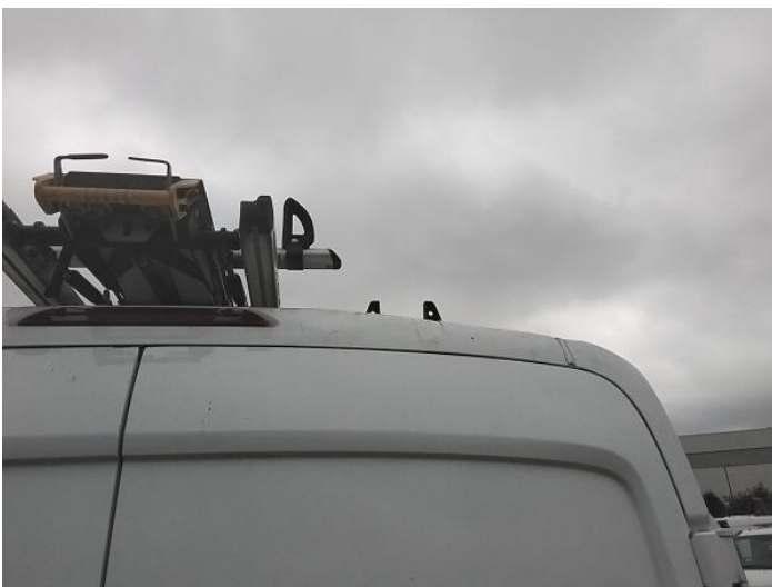
13: Roof Dented With Paint Damage