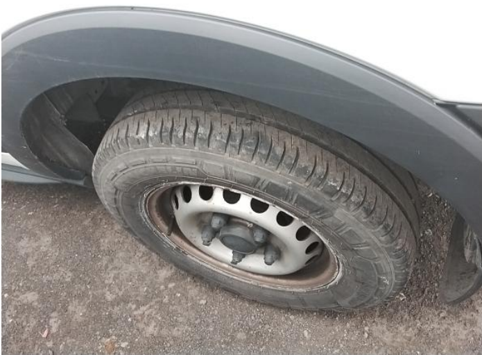
9: Qtr Panel Moulding ns Scuffed (Unpainted) Over 100mm