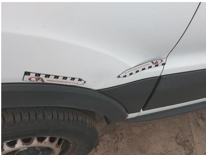
15: Qtr Panel osr Dented With Paint Damage