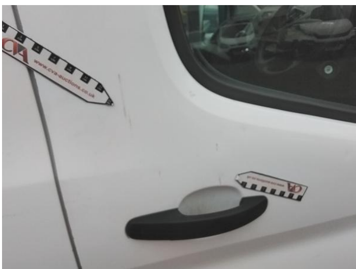
17: Door osf Scratched Over 25mm Thru Paint