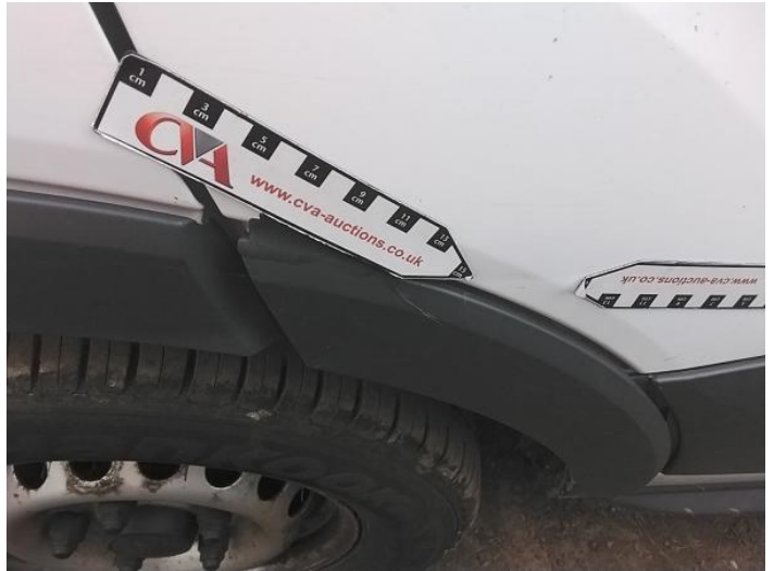
4: Door nsf Dented Over 30mm