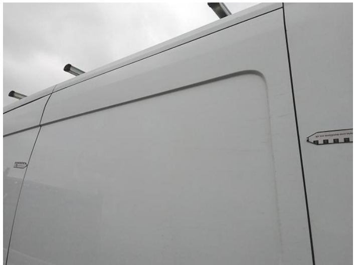
10: Qtr Panel nsr Scratched Over 25mm Thru Paint