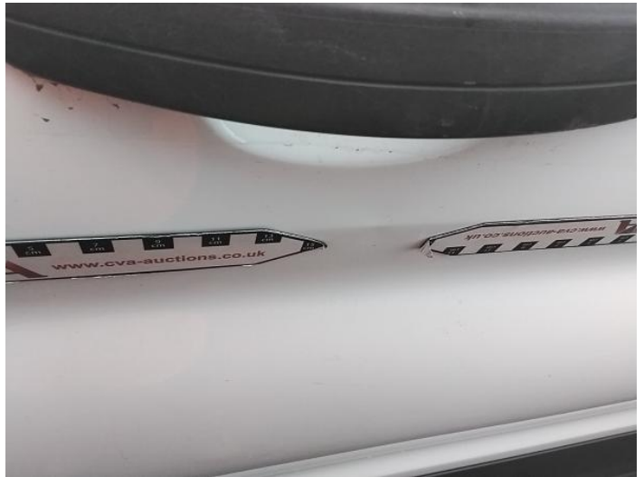
6: Qtr Panel nsr Dented Over 30mm