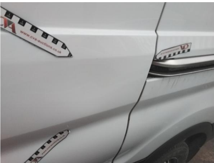
7: Qtr Panel nsr Dented Over 30mm