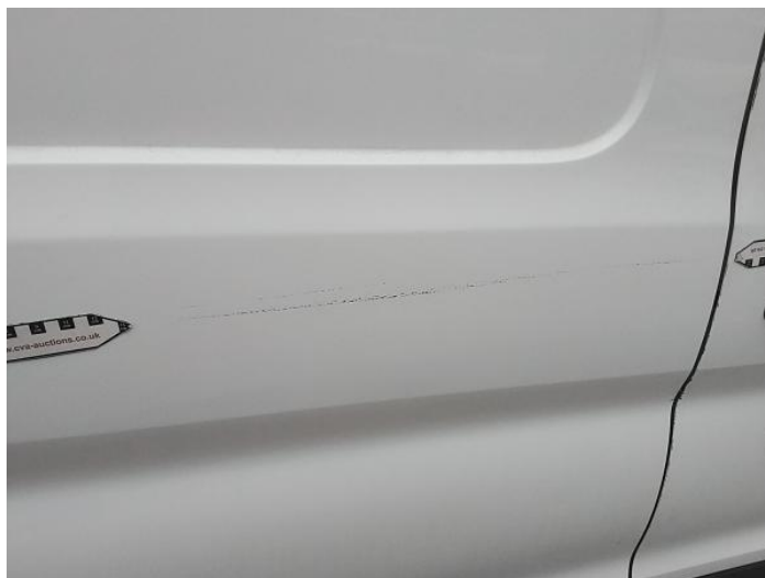
16: Qtr Panel osr Scratched Over 25mm Not Thru Paint