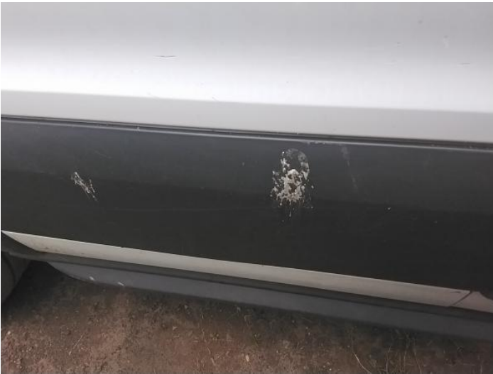
5: Door Moulding nsf Scuffed (Unpainted) Over 100mm