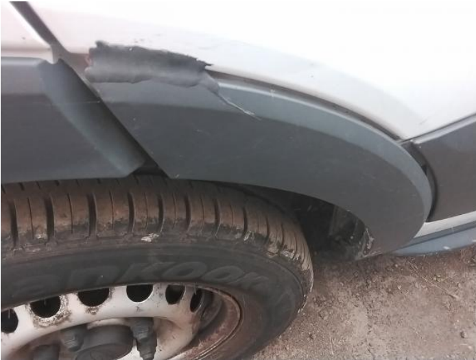
3: Door Moulding nsf Scuffed (Unpainted) Over 100mm