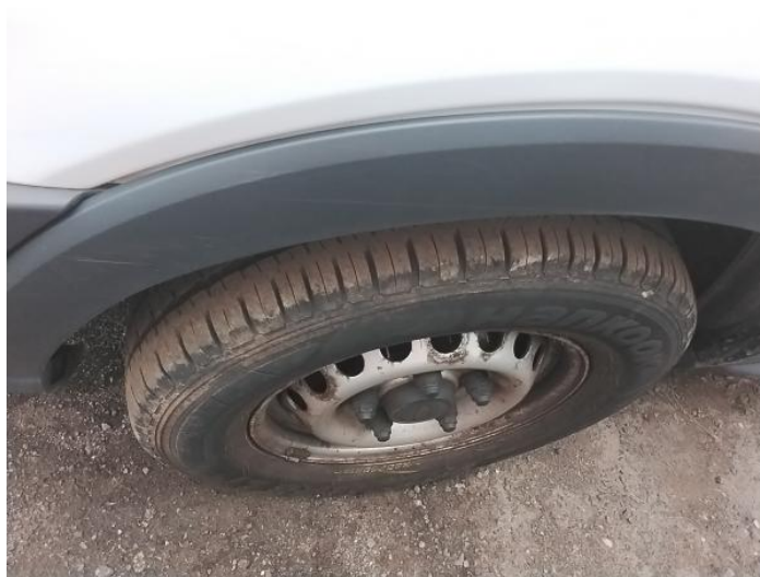
2: Wing Front Arch Extension ns Scuffed (Unpainted) Over 100mm