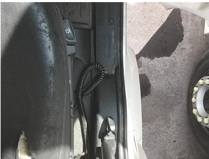
7: Seat Base Cover osf Holed Over 3mm