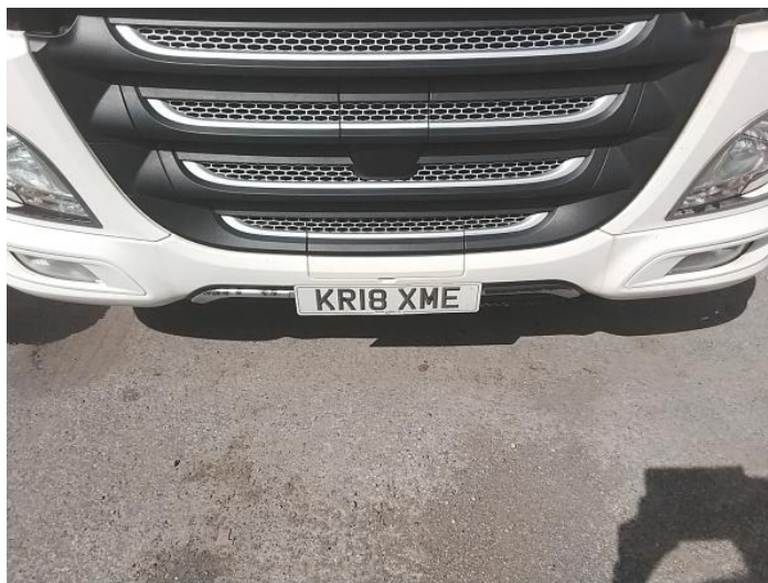
2: Bumper Front Chipped Multiple Chips