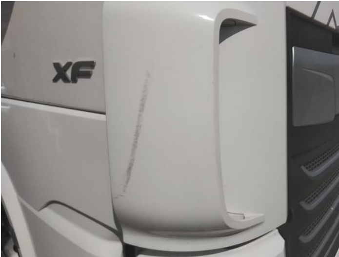
3: Panel Front Scratched Over 25mm Thru Paint