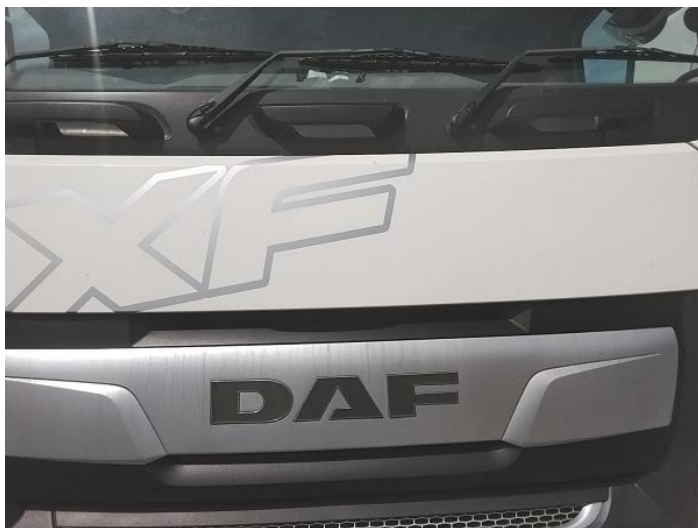
1: Bonnet Chipped Multiple Chips