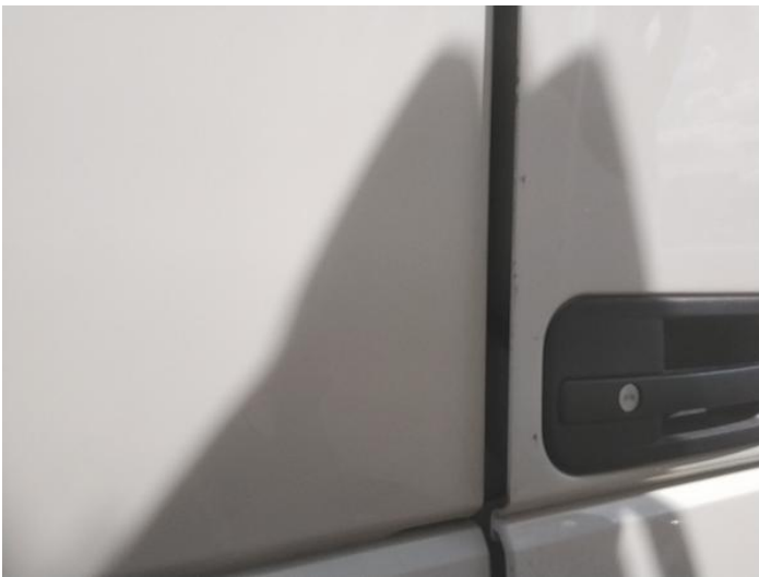
5: Door osf Chipped Multiple Chips