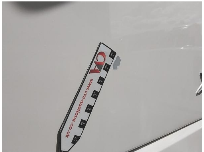
6: Door osf Scratched Over 25mm Thru Paint