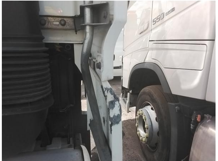
4: Qtr Panel Trim os Broken Replace