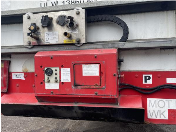
4: Bonnet Rusted Over 5mm