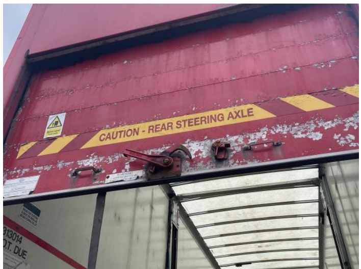
2: Tailgate Rusted Over 5mm