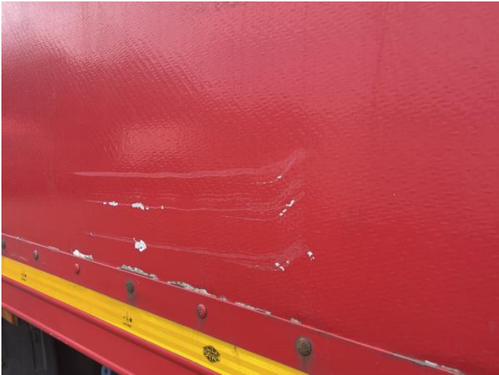
3: Qtr Panel nsr Dented With Paint Damage