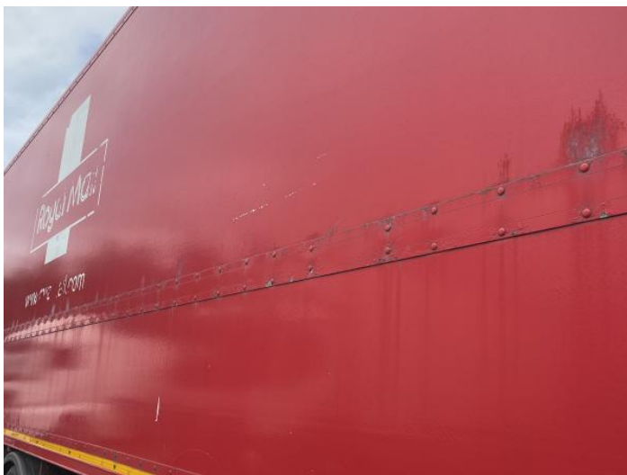
1: Qtr Panel osr Dented With Paint Damage