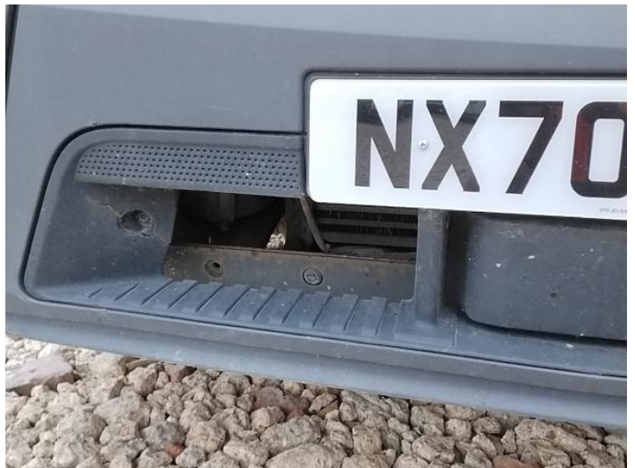
2: Grille Front Broken Replace