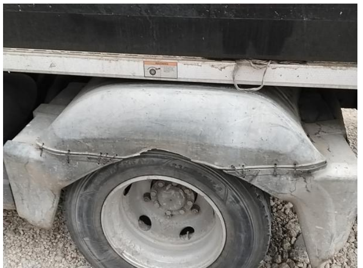
8: Other N/A N/A