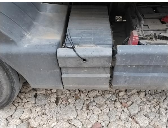
7: Other N/A N/A