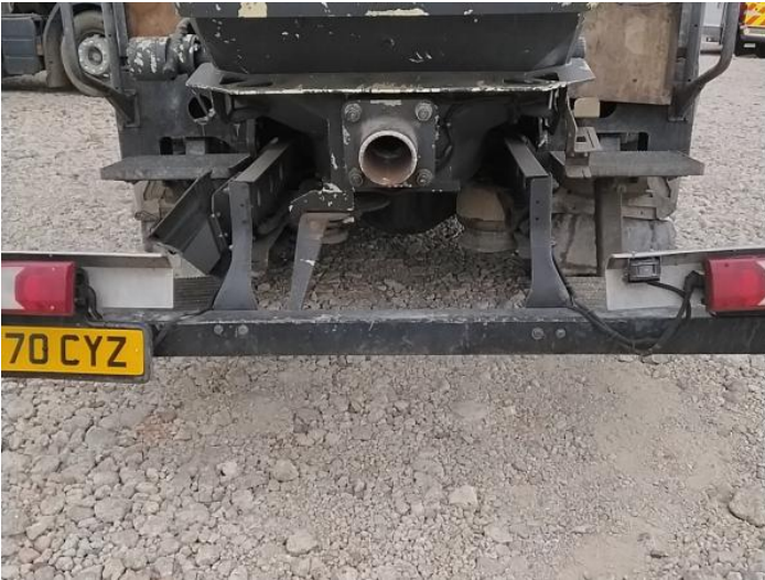
9: Bumper Rear Rusted Over 5mm