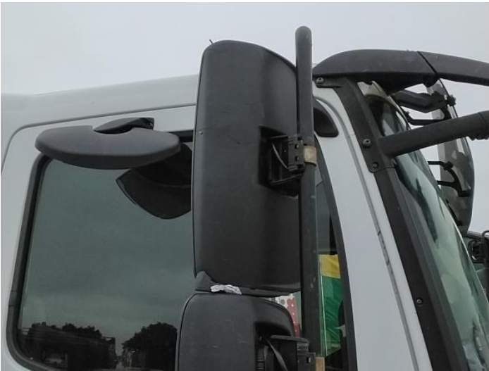
11: Door Mirror Assy osf Broken Replace