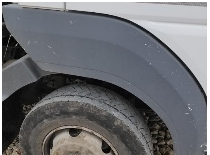
14: Other N/A N/A