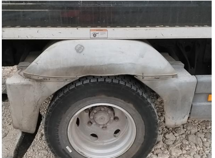
10: Other N/A N/A