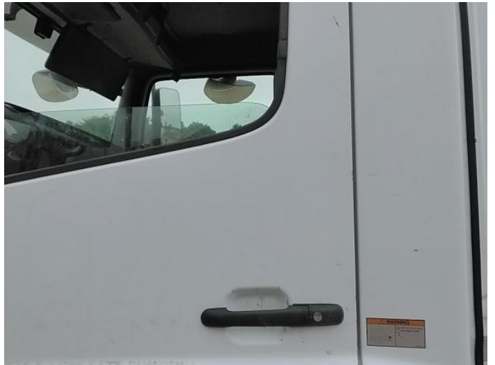
6: Door nsf Scratched Over 25mm Thru Paint