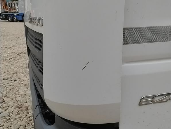
3: Moulding nsf Wing Scratched (Painted) UpTo 25mm Thru Paint