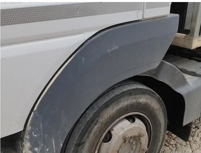
13: Other N/A N/A