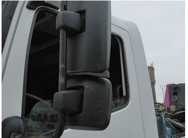
4: Door Mirror Assy nsf Scuffed (Unpainted) UpTo 100mm