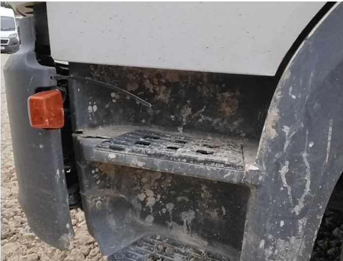
5: Other N/A N/A