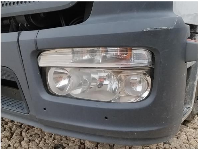
1: Fog Lamp Surrounds Broken Replace