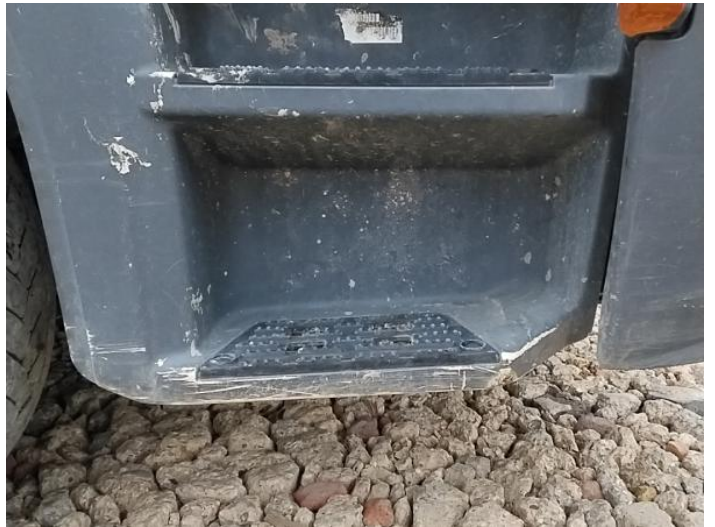
12: Other N/A N/A