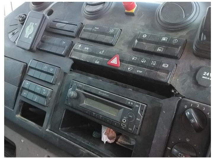
13: Fascia Panel Broken Replace