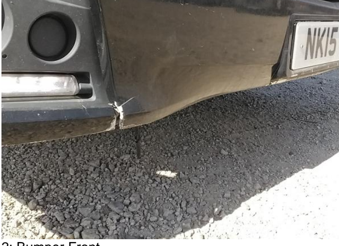
1: Fog Lamp Surround os Scratched (Painted) Over 25mm Thru Paint