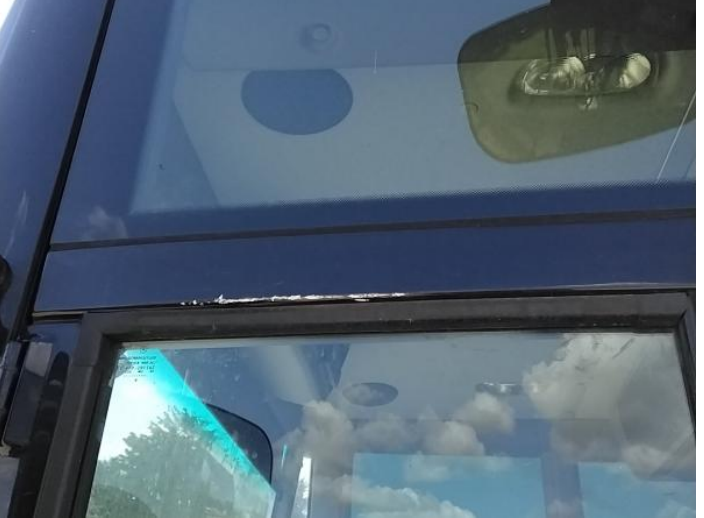
6: Door nsf Scratched UpTo 25mm Thru Paint