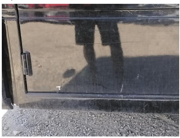
5: Door nsf Scratched UpTo 25mm Thru Paint