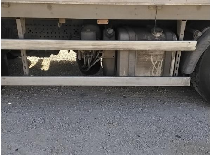
8: Other N/A N/A