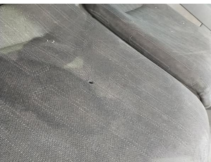
14: Seat Base Cover nsf Burn Over 3mm