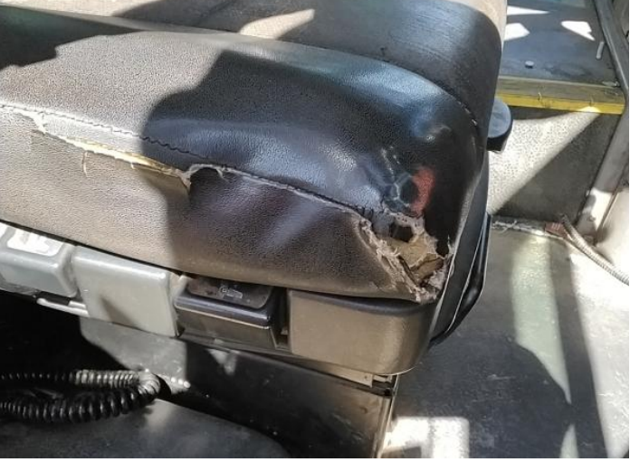
12: Seat Base Cover osf Torn Over 3mm