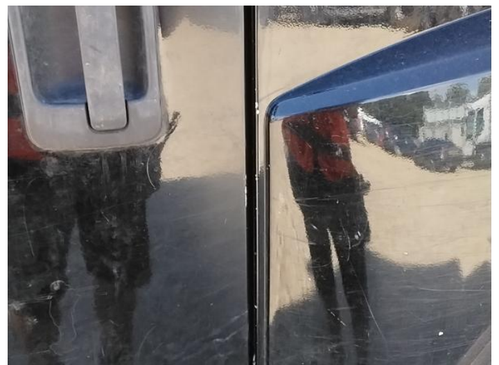
7: Door nsf Chipped Edge Chip