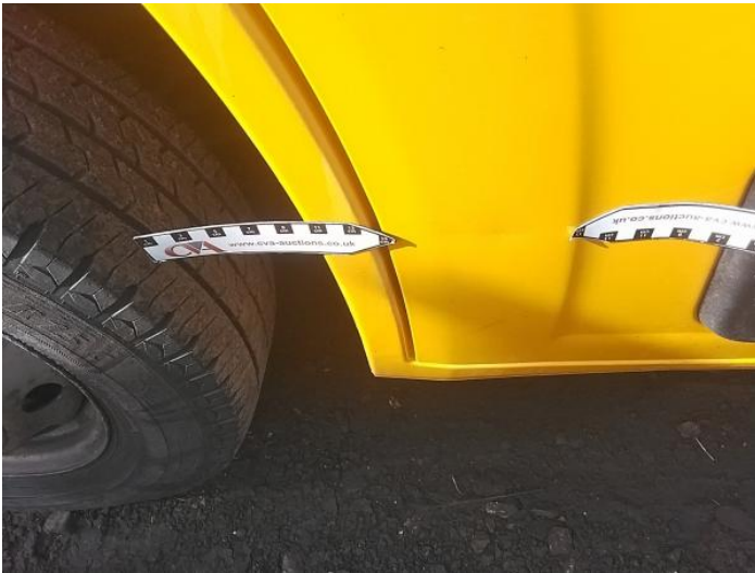
5: Door nsf Dented Over 30mm