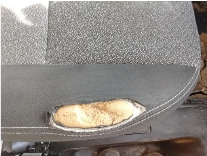
11: Seat Base Cover osf Torn Over 3mm