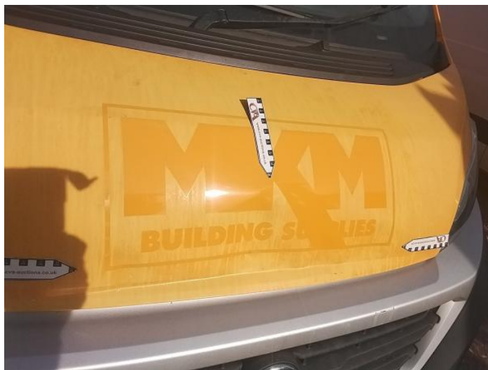
2: Bonnet Dented With Paint Damage