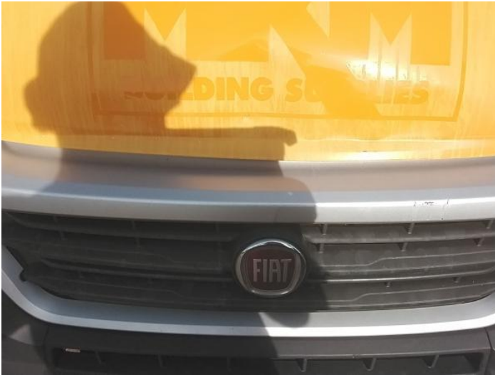
3: Panel Front Scratched Over 25mm Thru Paint