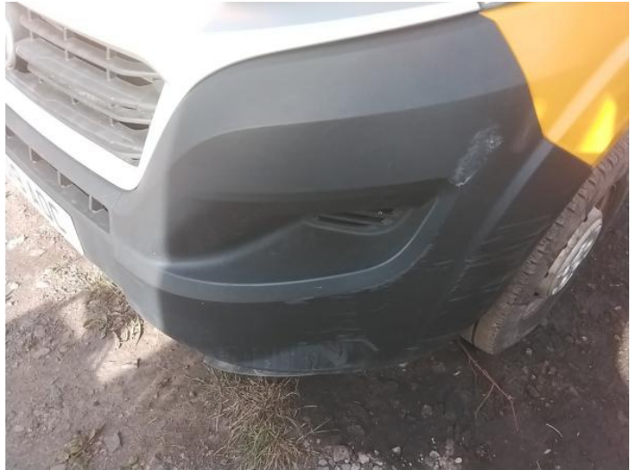
4: Bumper Front Scratched Over 100mm Thru Paint