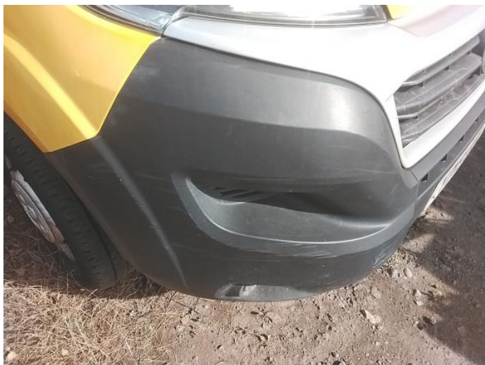
1: Bumper Front Scratched Over 100mm Thru Paint