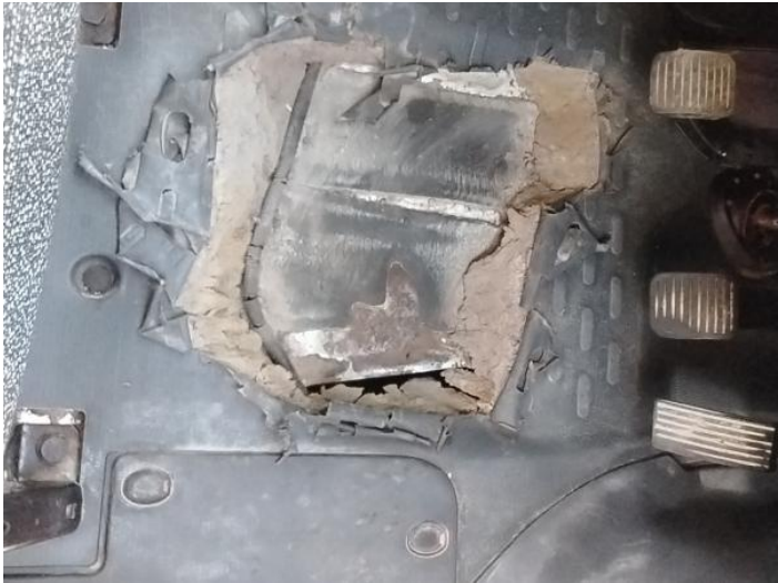
10: Carpets Front Holed Over 3mm