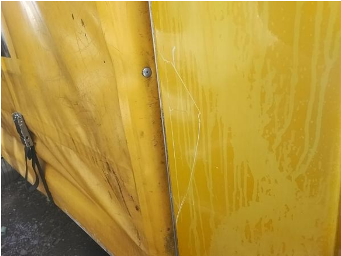
9: Qtr Panel Trim os Scuffed Over 25mm