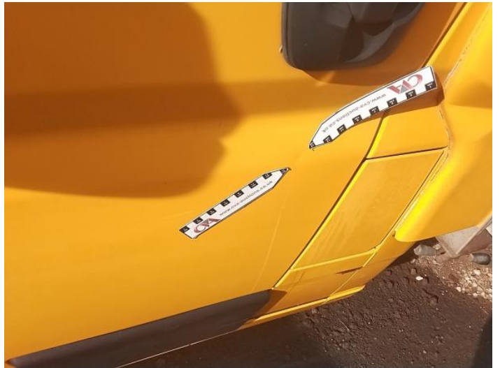
6: Door nsf Dented Over 30mm