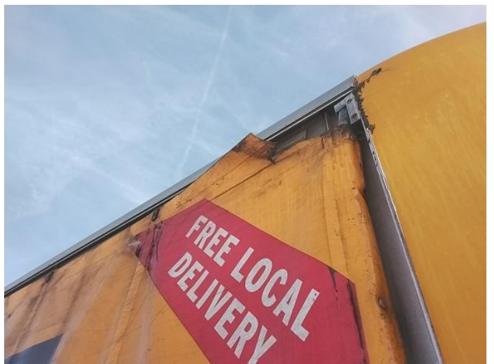
8: Qtr Panel osr Hole Over 10mm