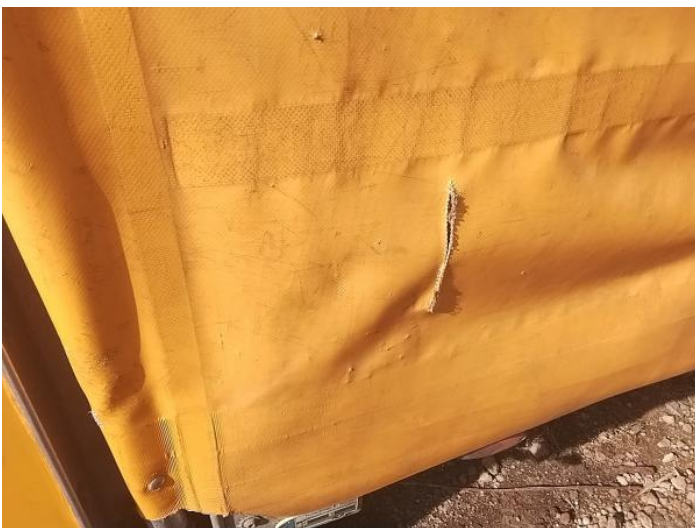
7: Qtr Panel nsr Hole Over 10mm