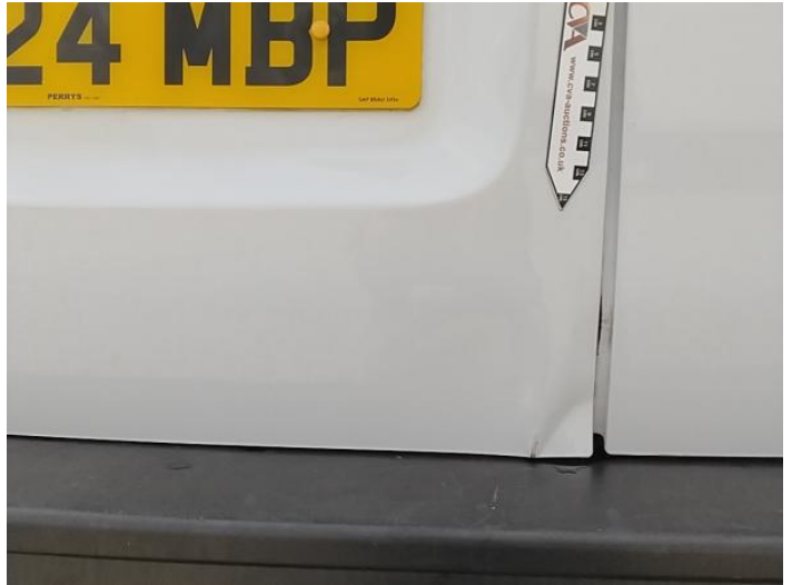
3: Door nsf Chipped 1 To 5