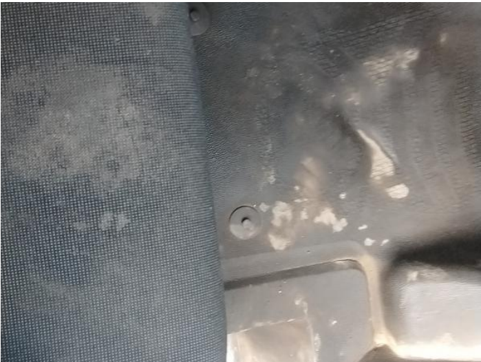
1: Seat Base Cover osf Soiled Heavy