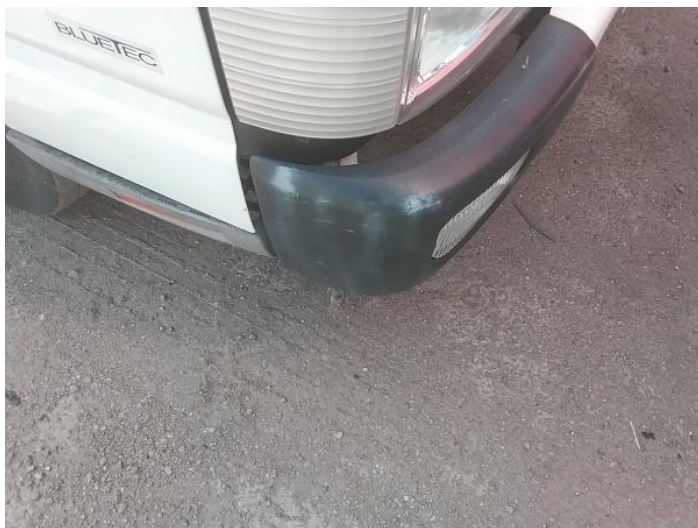
1: Bumper Front Scratched Over 100mm Thru Paint