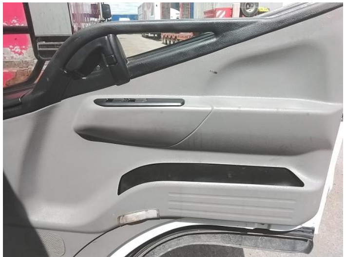
6: Door Pad osf Soiled Heavy