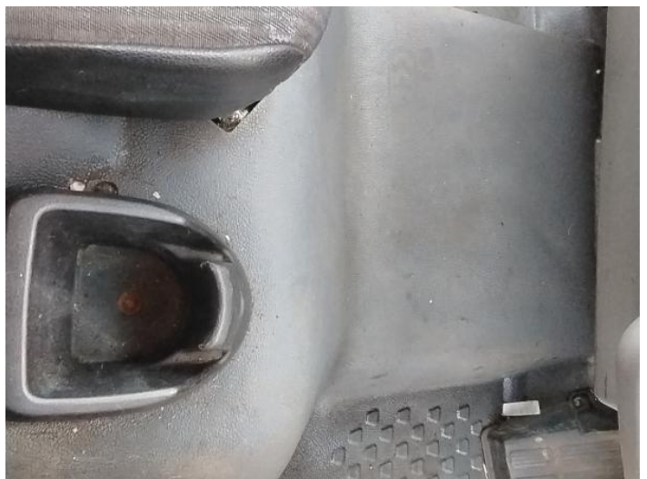
8: Carpets Front Soiled Heavy