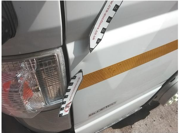
4: Door nsf Dented Over 30mm