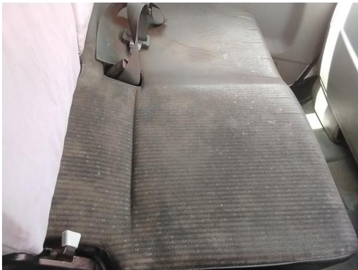
9: Seat Base Cover nsf Soiled Heavy