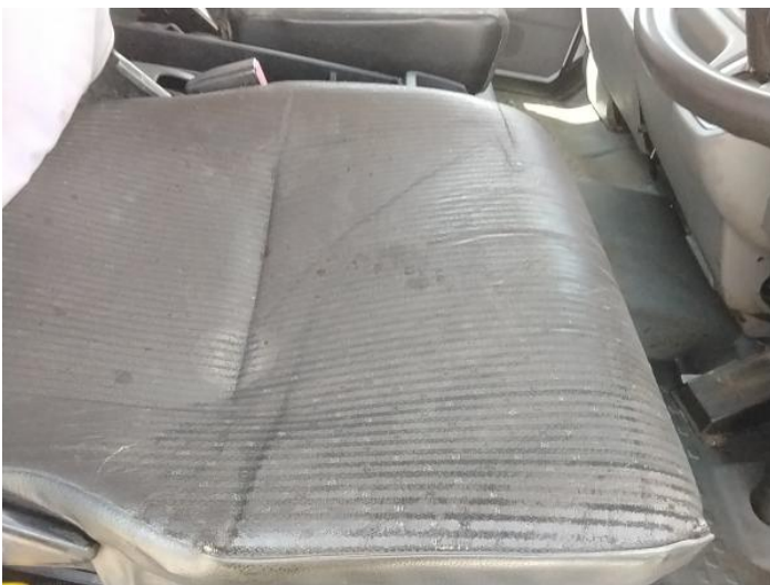
7: Seat Base Cover osf Torn Over 3mm