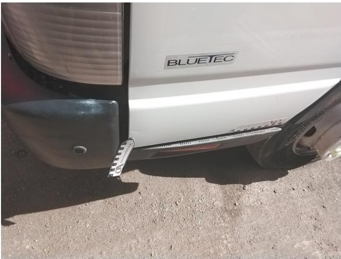
5: Door nsf Dented With Paint Damage