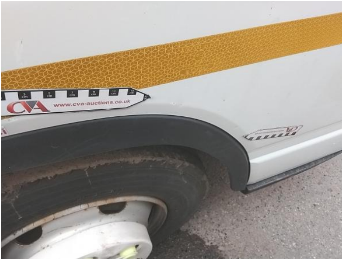
3: Door osf Dented Over 30mm