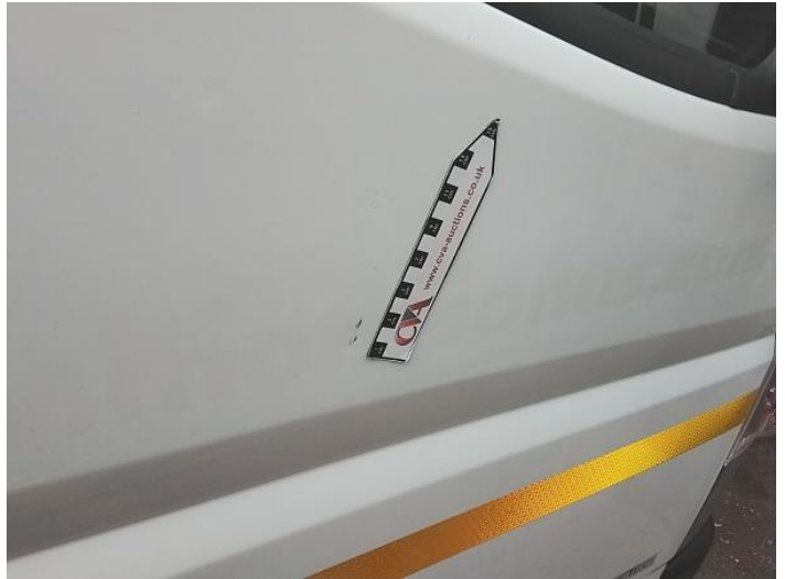
4: Door osf Dented With Paint Damage