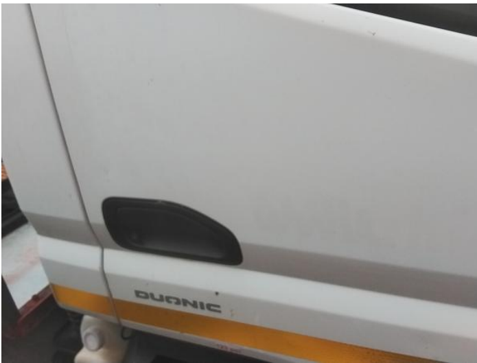
5: Door osf Chipped Multiple Chips