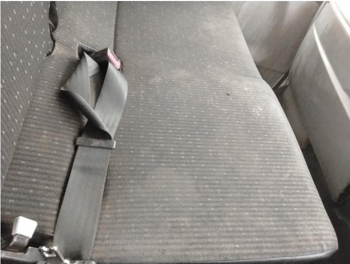
10: Seat Base Cover nsf Soiled Heavy