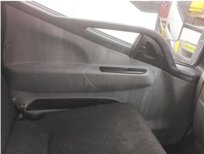
11: Door Pad nsf Soiled Heavy