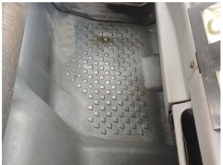
8: Carpets Front Soiled Heavy