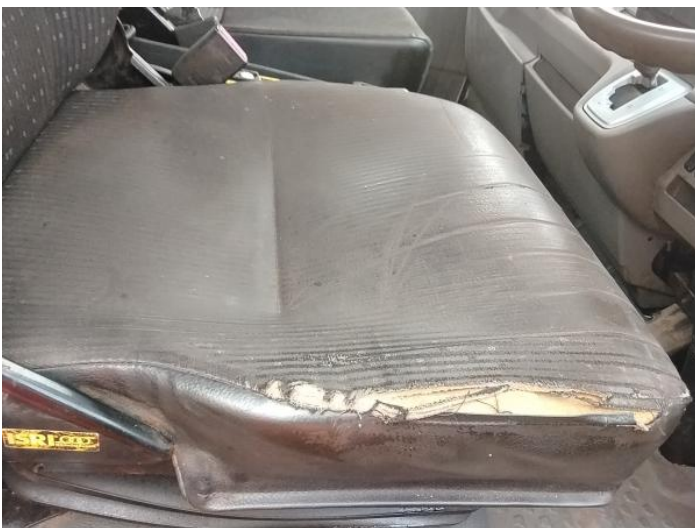
7: Seat Base Cover osf Torn Over 3mm