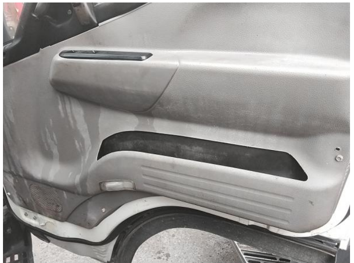
6: Door Pad osf Soiled Heavy