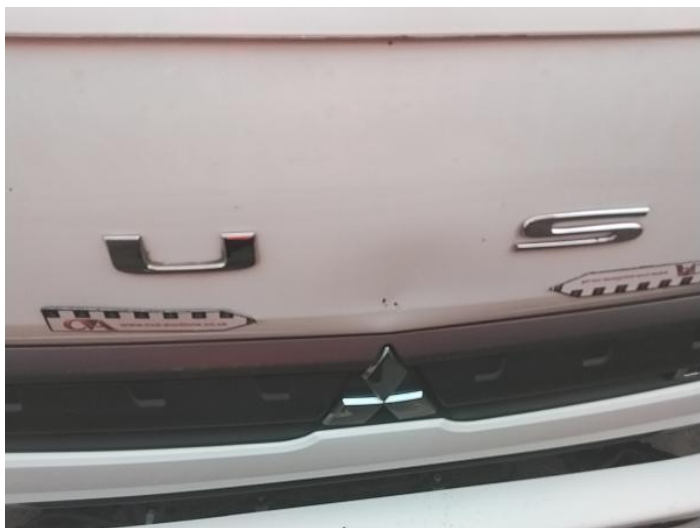
1: Bonnet Dented With Paint Damage