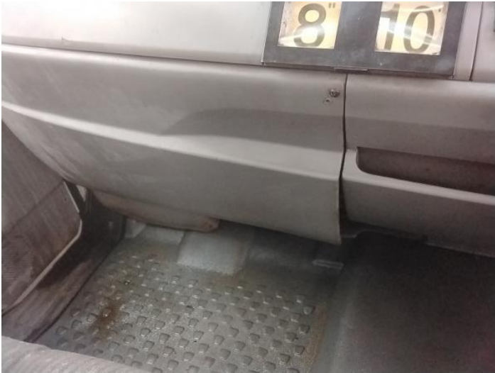
9: Fascia Panel Broken Replace