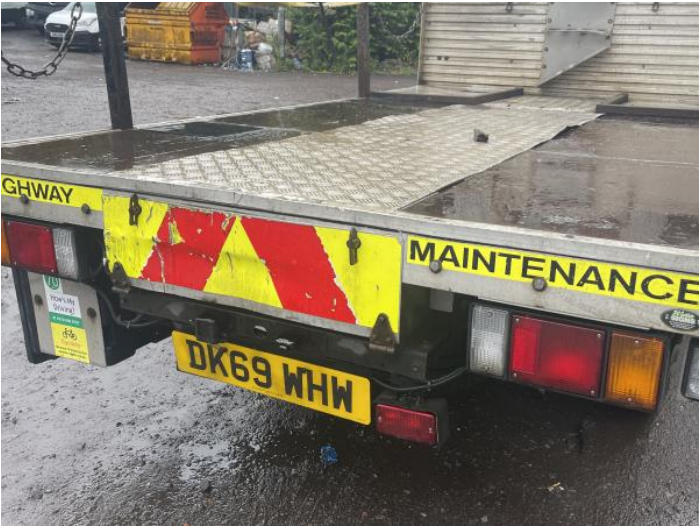
4: Tailgate Dented With Paint Damage