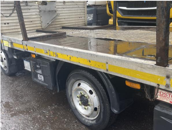
5: Qtr Panel nsr Dented With Paint Damage