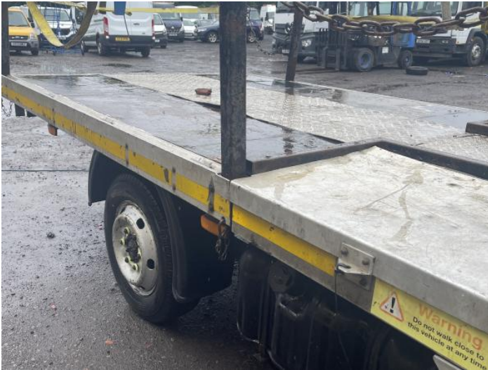
3: Qtr Panel osr Dented With Paint Damage