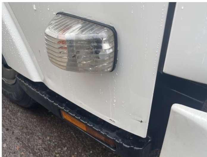
2: Door osf Dented Over 30mm