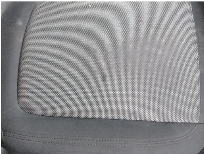
5: Seat Base Cover osf Soiled Heavy