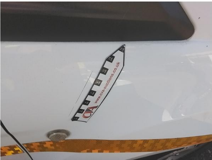
4: Wing osf Scratched Over 25mm Not Thru Paint