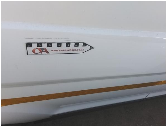
3: Qtr Panel osr Scratched Over 25mm Not Thru Paint