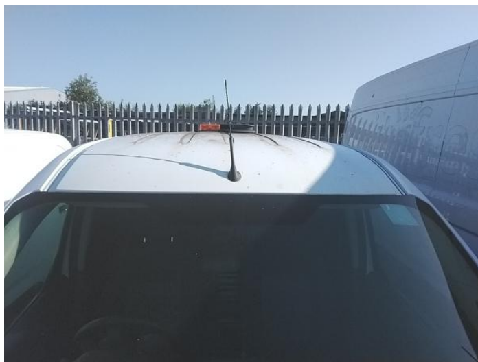
2: Roof Chipped Multiple Chips