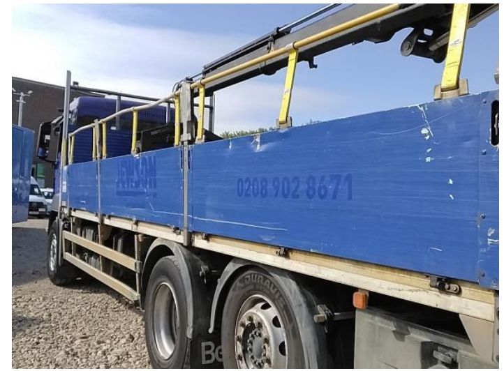
13: Qtr Panel nsr Dented Over 30mm