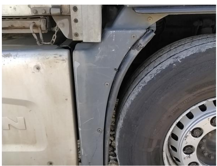
16: Other N/A N/A