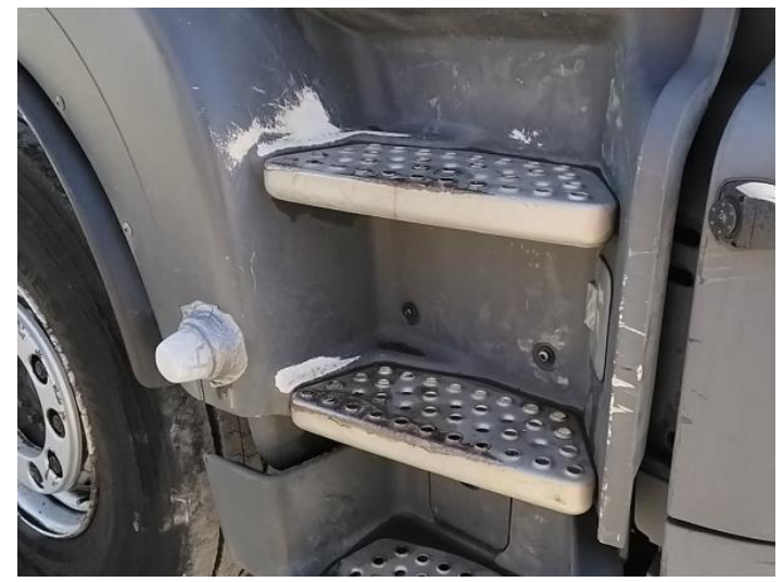
19: Other N/A N/A