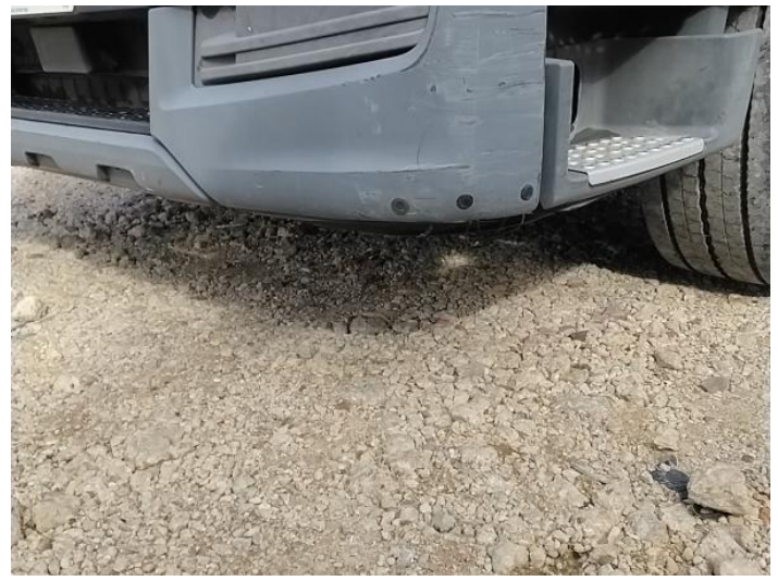
6: Bumper Front Moulding Scuffed (Unpainted) UpTo 100mm