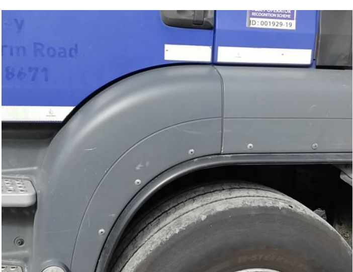
10: Other N/A N/A