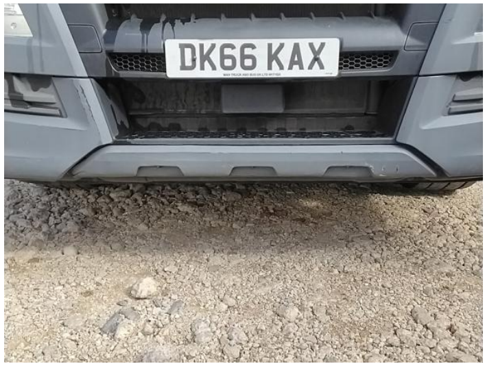
5: Bumper Front Cracked UpTo 25mm