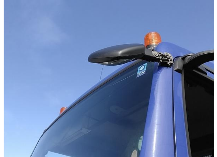
8: Door Mirror Assy nsf Missing Replace