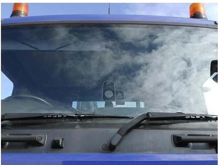
4: Screen Front Chipped UpTo 10mm