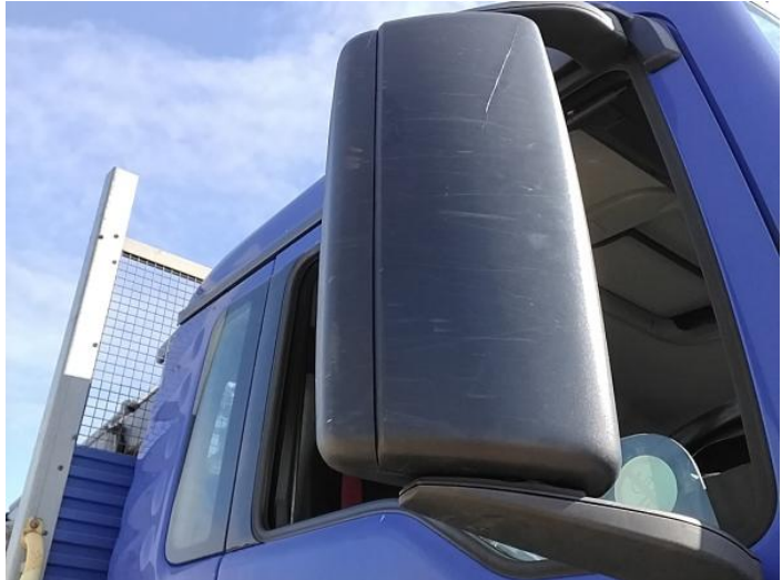
20: Door Mirror Assy osf Scuffed (Unpainted) UpTo 100mm