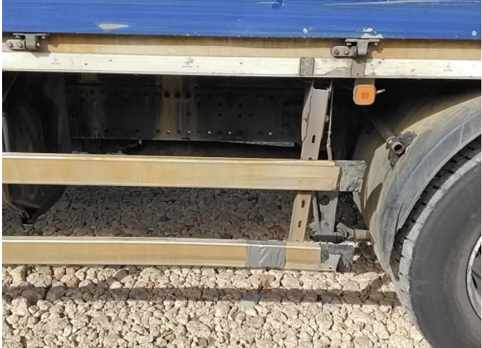
12: Other N/A N/A