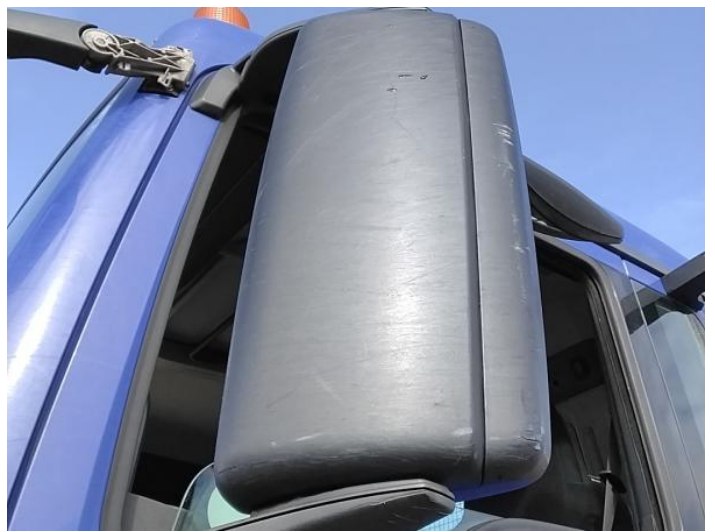
9: Door Mirror Assy nsf Scuffed (Unpainted) UpTo 100mm