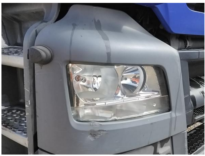
2: Fog Lamp Surround os Scuffed (Unpainted) UpTo 100mm