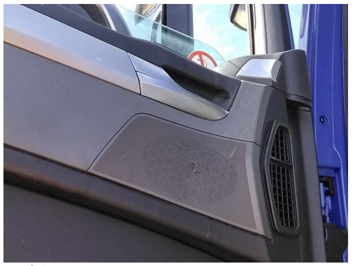
21: Other N/A N/A