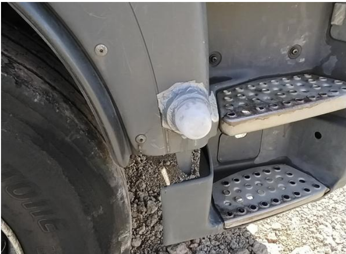
18: Other N/A N/A