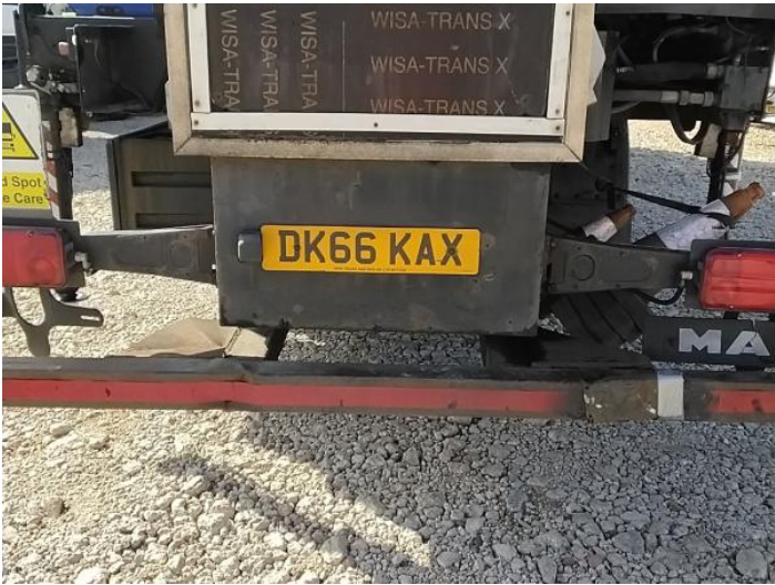
14: Bumper Rear Rusted Over 5mm