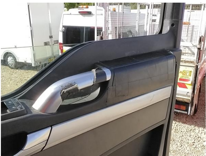
22: Door Pad osf Broken Replace