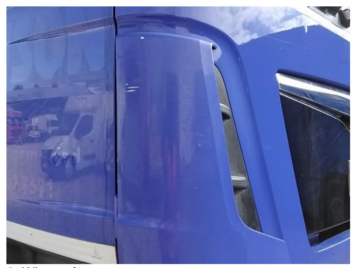
3: Wing osf Scratched UpTo 25mm Thru Paint