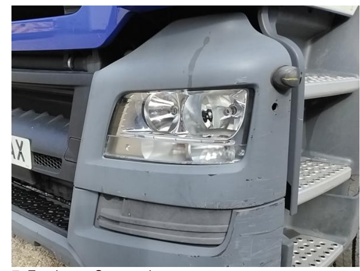
7: Fog Lamp Surround ns Scuffed (Unpainted) UpTo 100mm