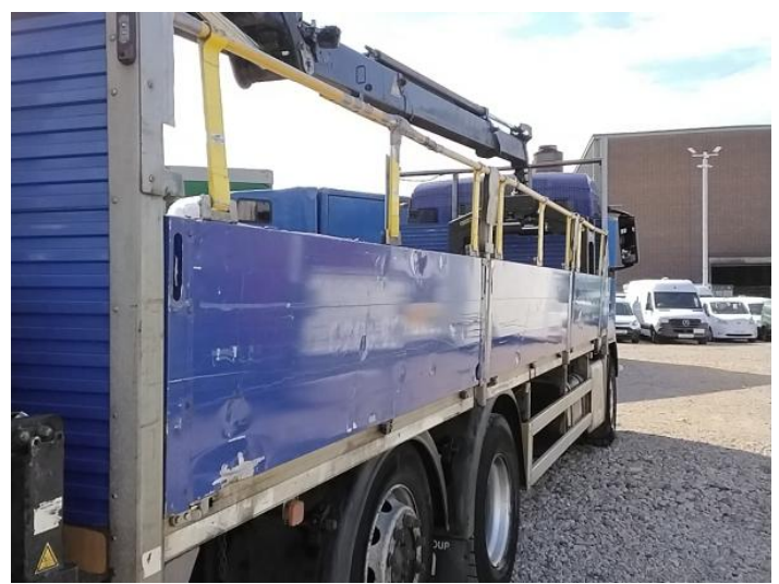
15: Qtr Panel osr Dented Over 30mm