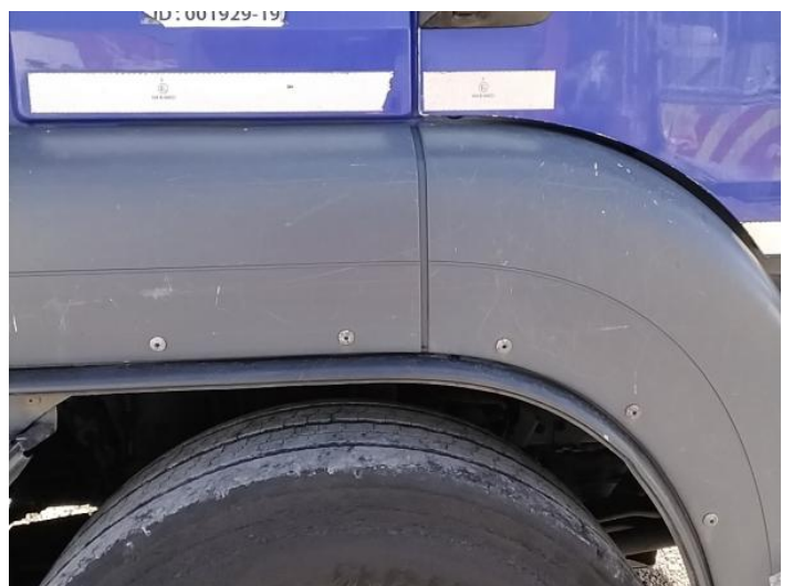
17: Other N/A N/A