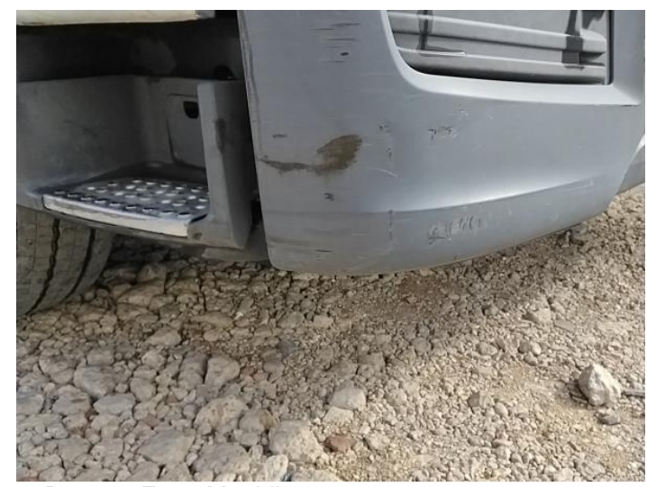
1: Bumper Front Moulding Scuffed (Unpainted) UpTo 100mm