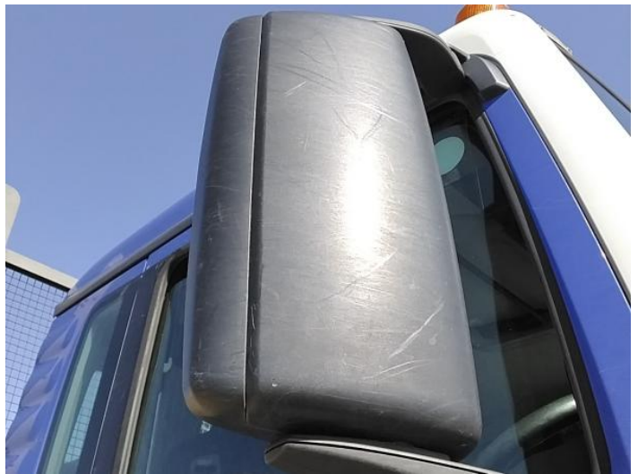
12: Door Mirror Assy osf Scuffed (Unpainted) UpTo 100mm