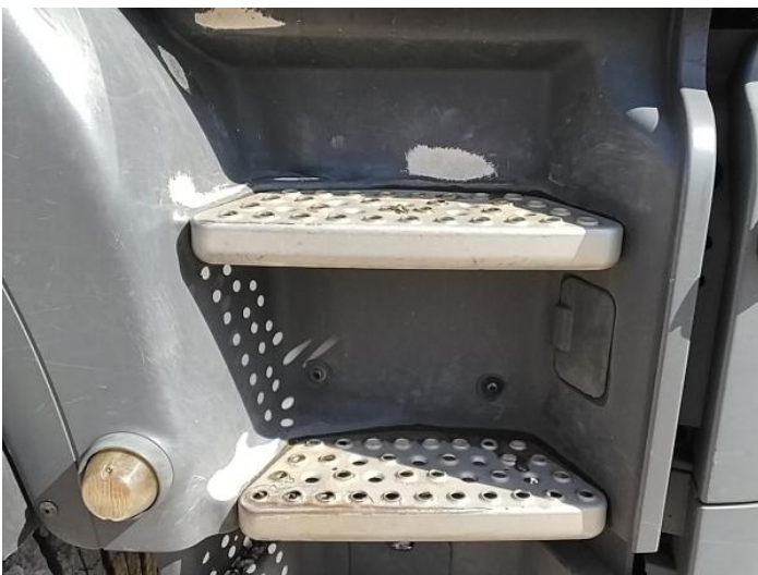
13: Other N/A N/A