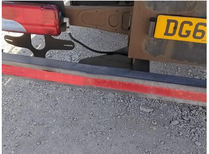
10: Bumper Rear Dented Between 10mm + 30mm