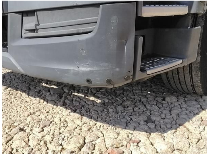
4: Bumper Front Moulding Scuffed (Unpainted) UpTo 100mm