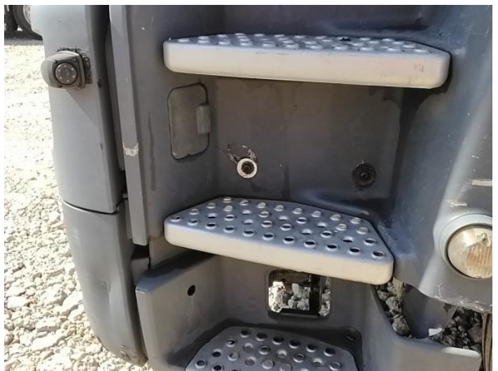
8: Other N/A N/A