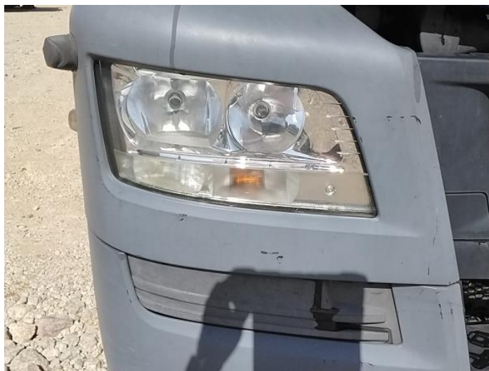
2: Fog Lamp Surround os Scuffed (Unpainted) UpTo 100mm