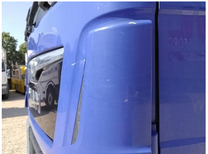
6: Wing nsf Scratched UpTo 25mm Thru Paint