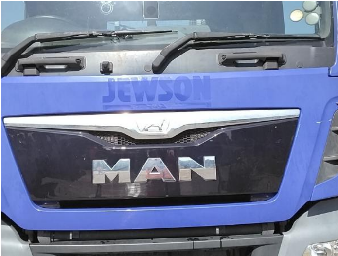
3: Bonnet Scratched Over 25mm Thru Paint