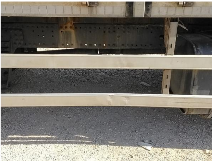
11: Other N/A N/A