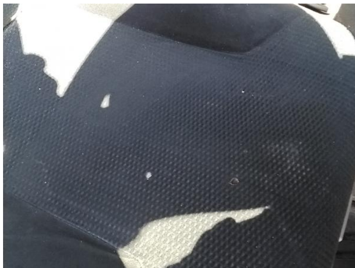
15: Other N/A N/A