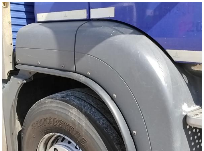
14: Other N/A N/A