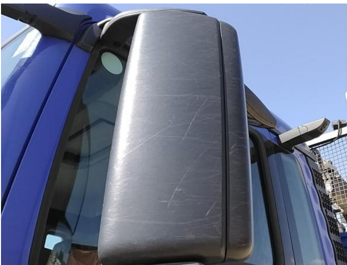
7: Door Mirror Assy nsf Scuffed (Unpainted) UpTo 100mm