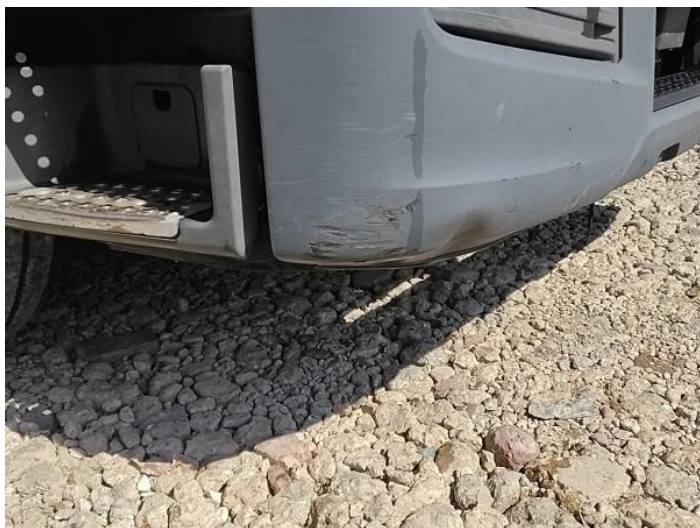
1: Bumper Front Moulding Scuffed (Unpainted) Over 100mm