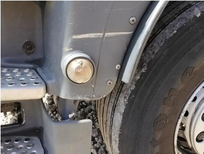
9: Other N/A N/A