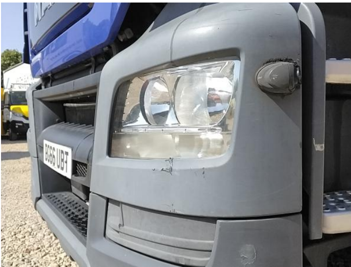
5: Fog Lamp Surrounds Scuffed (Unpainted) UpTo 100mm