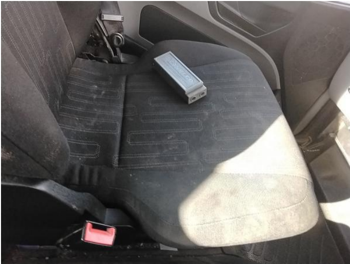
9: Seat Base Cover nsf Soiled Heavy