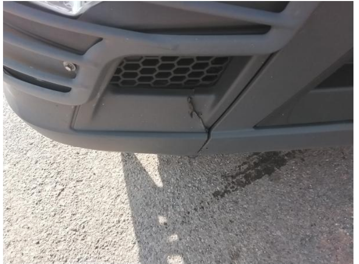
4: Bumper Front Cracked Over 25mm