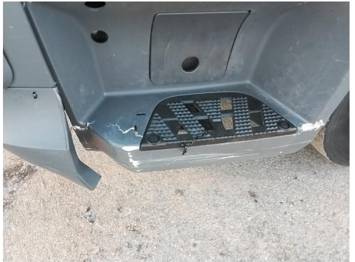
6: Bumper Front Moulding Broken Replace