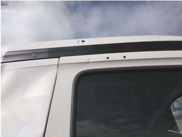
10: Door osf Dented With Paint Damage