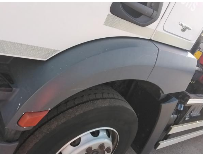
7: Wing nsf Chipped Multiple Chips