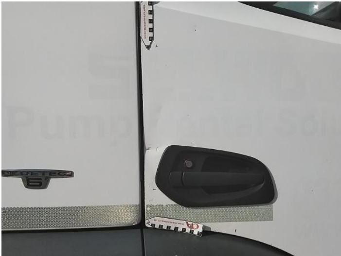
12: Door osf Dented With Paint Damage