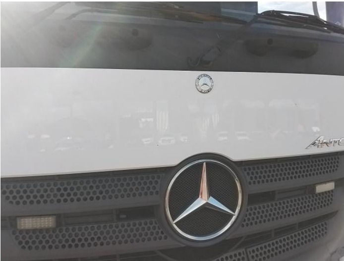
5: Bonnet Chipped Multiple Chips