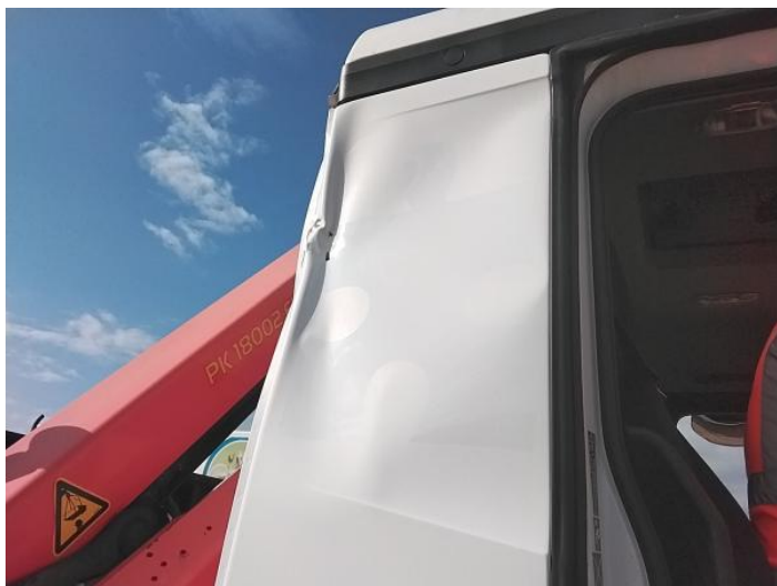
1: Qtr Panel osr Dented Over 30% Of Panel