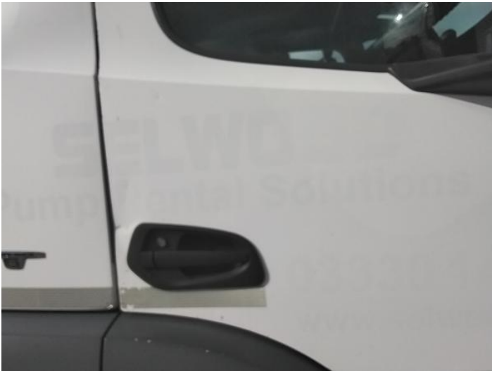
11: Door osf Chipped Multiple Chips