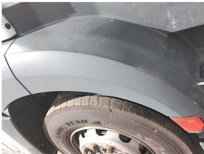
2: Wing osf Chipped Multiple Chips