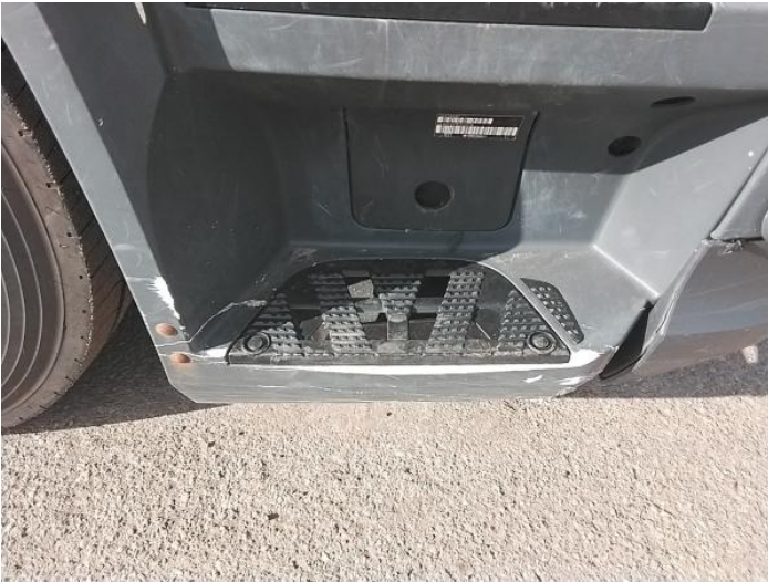
3: Bumper Front Moulding Broken Replace