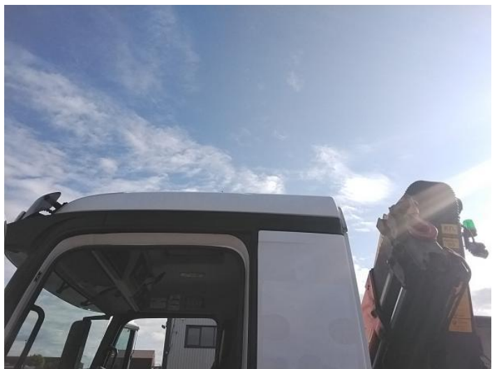
8: Roof Dented Over 30mm