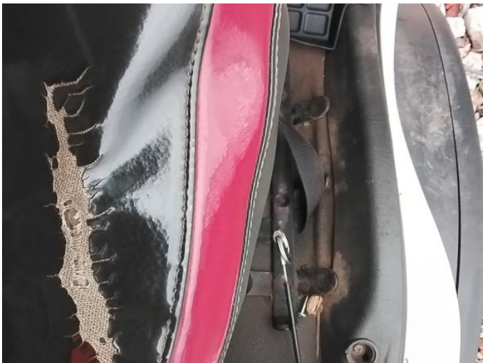
4: Seat Base Cover osf Torn Over 3mm