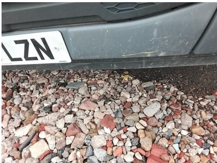
1: Bumper Front Dented With Paint Damage