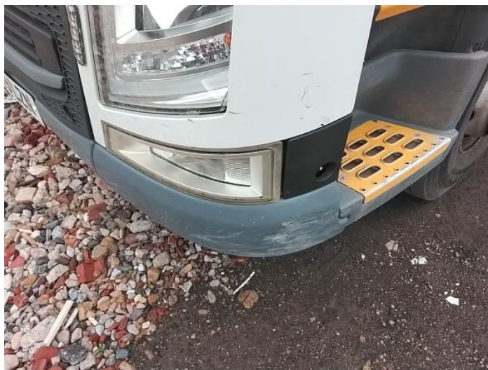
2: Bumper Front Dented With Paint Damage