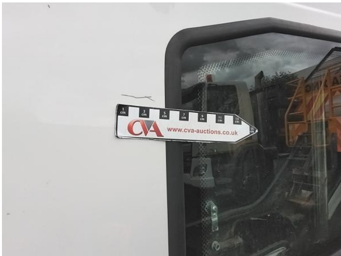
3: Door nsf Scratched Over 25mm Thru Paint