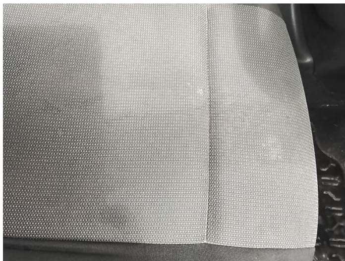
2: Seat Base Cover of Soiled Heavy