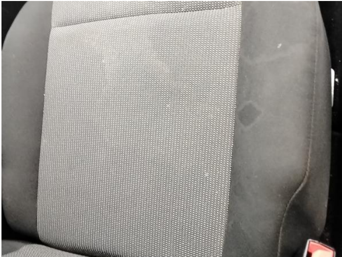
4: Seat Base Cover nsf Soiled Heavy