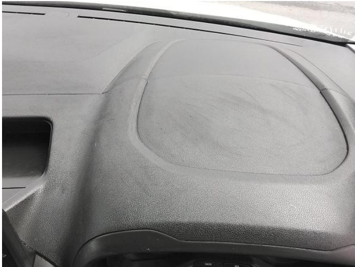
3: Fascia Panel Scuffed Over 25mm