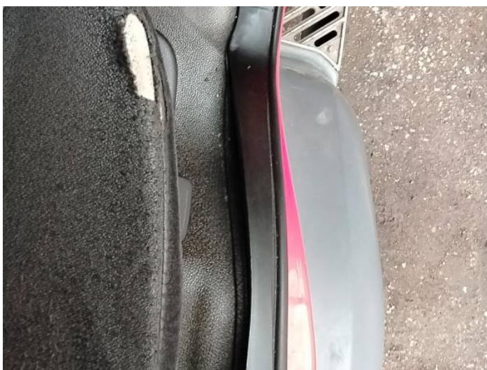
7: Seat Base Cover osf Torn Over 3mm