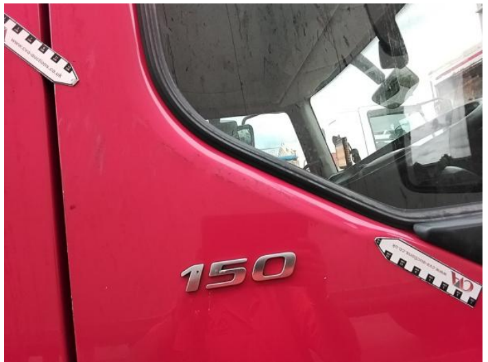
2: Door osf Dented With Paint Damage