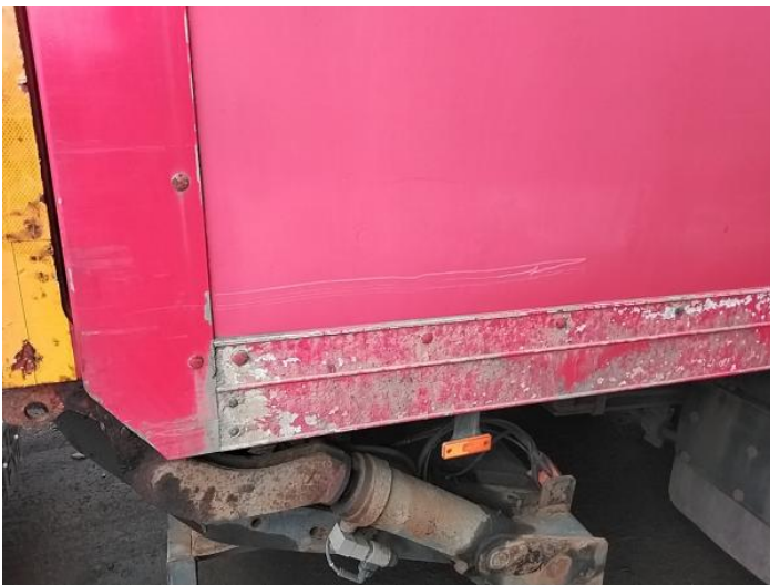
1: Qtr Panel osr Scratched Over 25mm Thru Paint