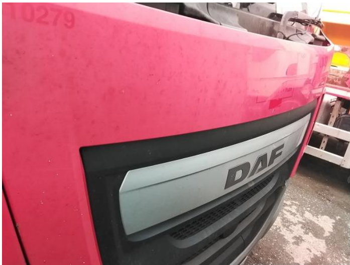
3: Bonnet Chipped Multiple Chips