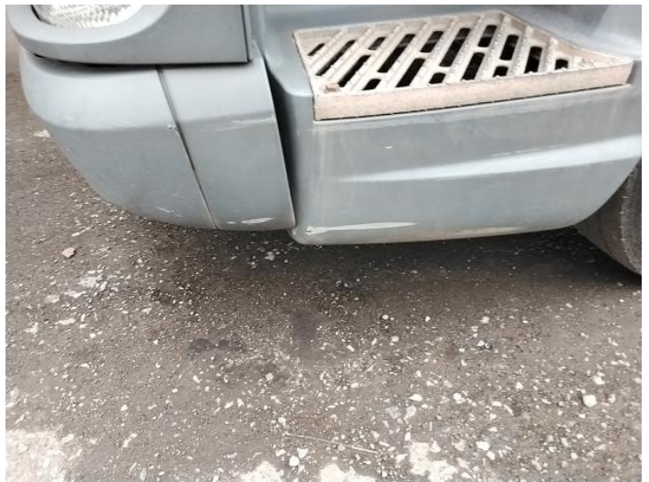
4: Bumper Front Moulding Scuffed (Unpainted) Over 100mm