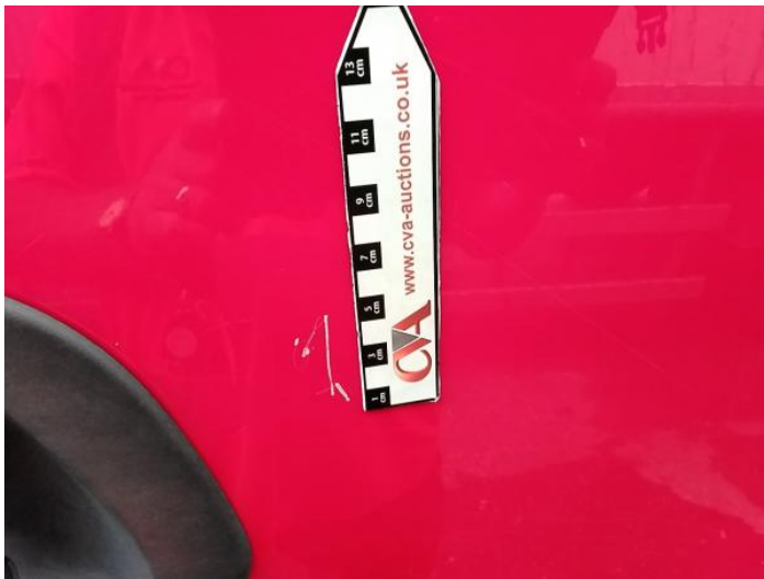
5: Door osf Scratched Over 25mm Thru Paint