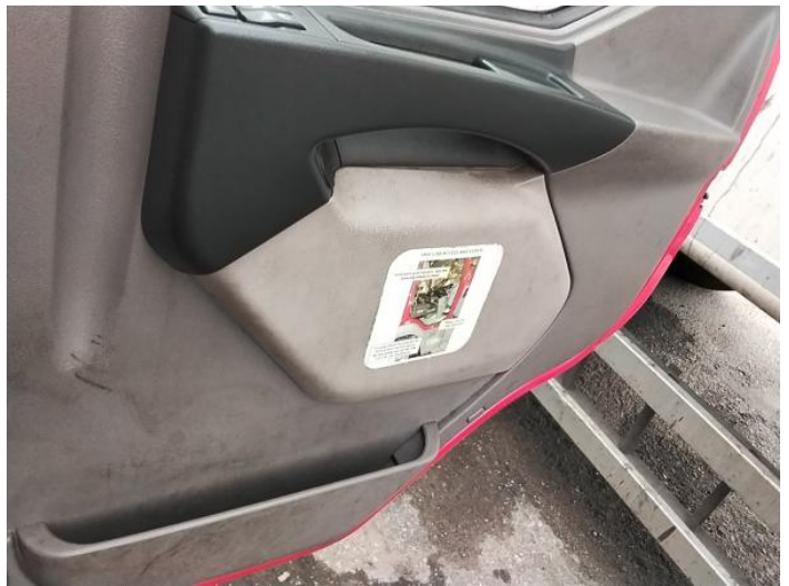
6: Door Pad osf Soiled Heavy