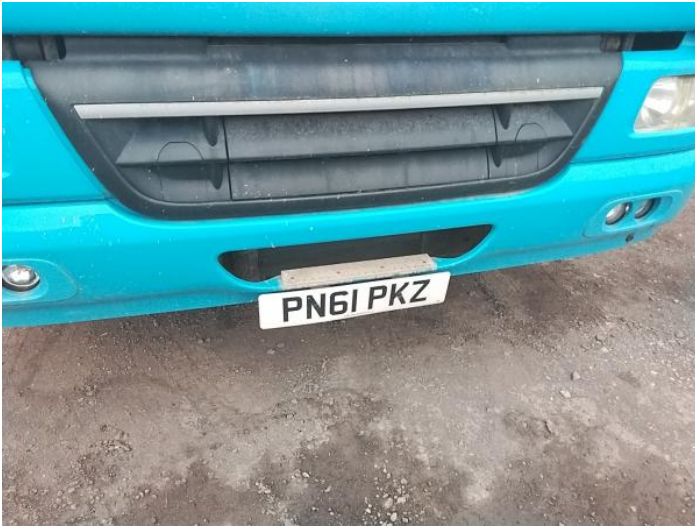
3: Bumper Front Chipped Multiple Chips