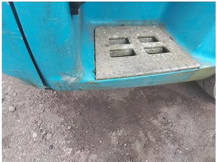
6: Bumper Front Moulding Broken Replace