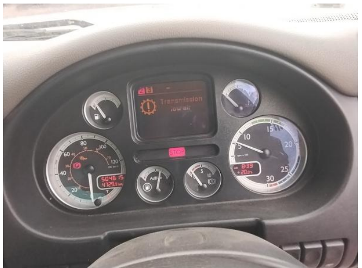
14: Dash Warning Lights Displayed No Action