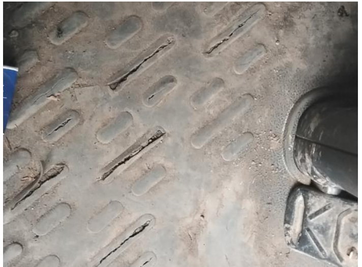
12: Carpets Front Torn Over 10mm