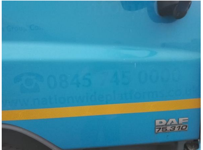
10: Door osf Chipped Multiple Chips