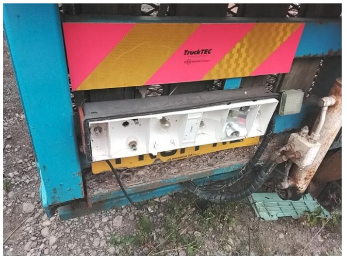
8: Lamp nsr Broken Replace