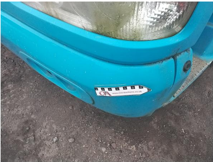
5: Bumper Front Scratched Over 100mm Thru Paint