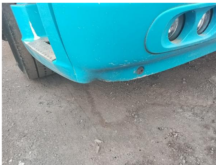
2: Bumper Front Dented With Paint Damage