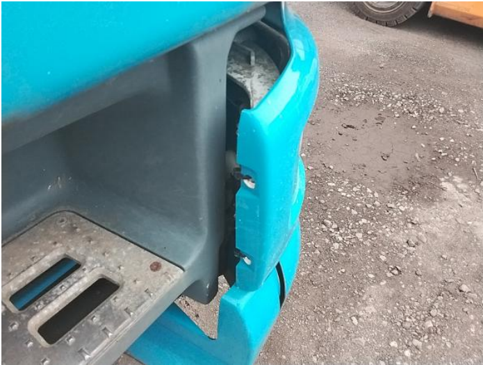
9: Panel Front Cracked Replace