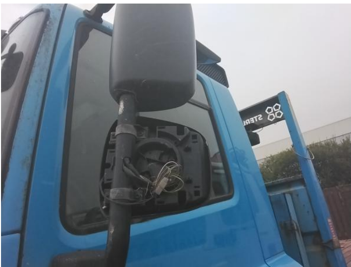
7: Door Mirror Assy nsf Broken Replace