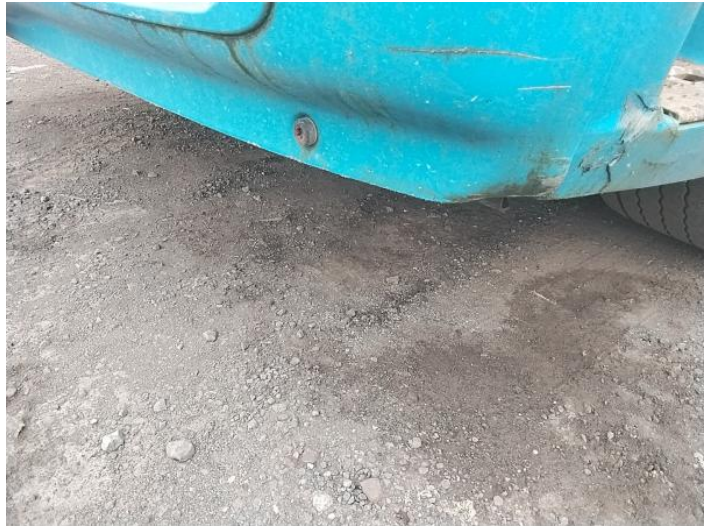
4: Bumper Front Dented With Paint Damage