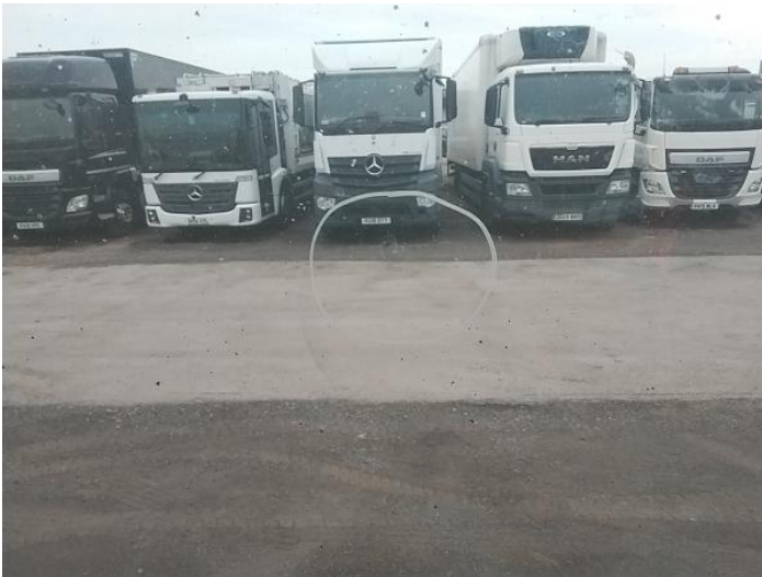
11: Screen Front Chipped Over 10mm