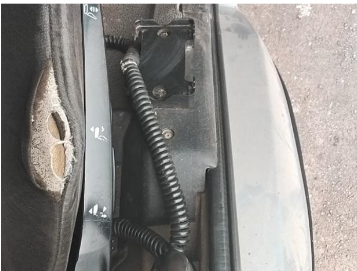
13: Seat Base Cover osf Torn Over 3mm