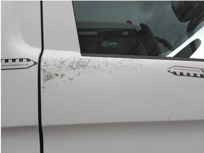
4: Door osf Dented With Paint Damage