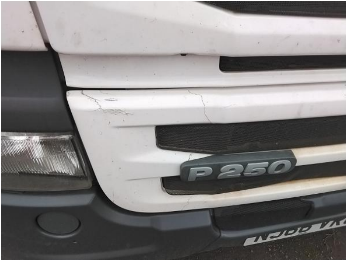
3: Bumper Front Grill Broken Replace