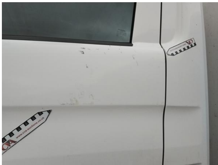
2: Door nsf Scratched Over 25mm Thru Paint