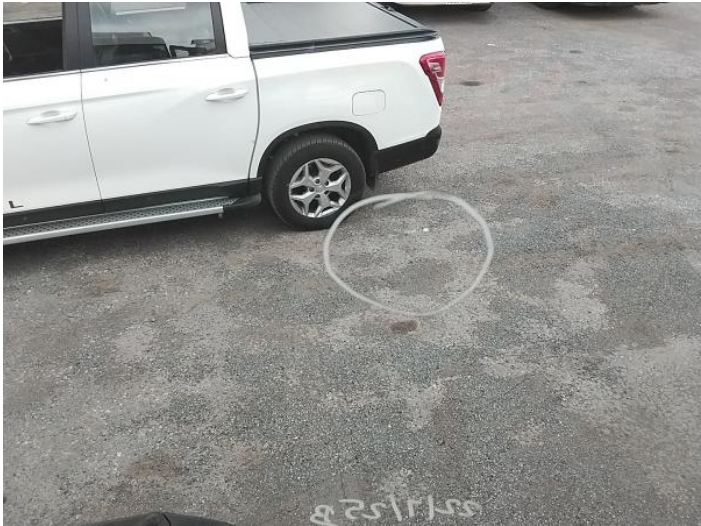
4: Screen Front Cracked Replace