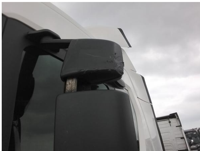
2: Door Mirror Assy nsf Broken Replace