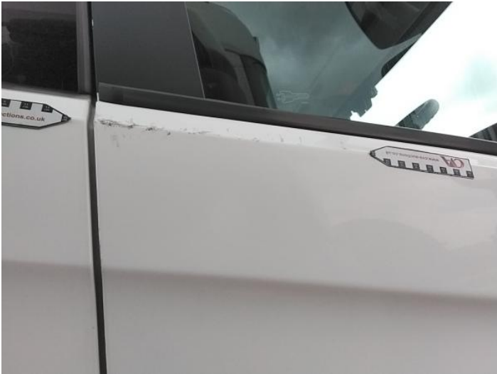
3: Door osf Scratched Over 25mm Thru Paint