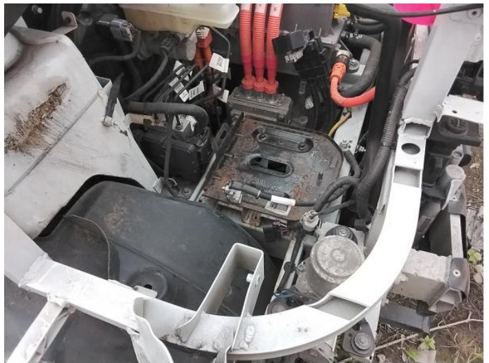
6: Unclassified Major Parts Missing Report Only