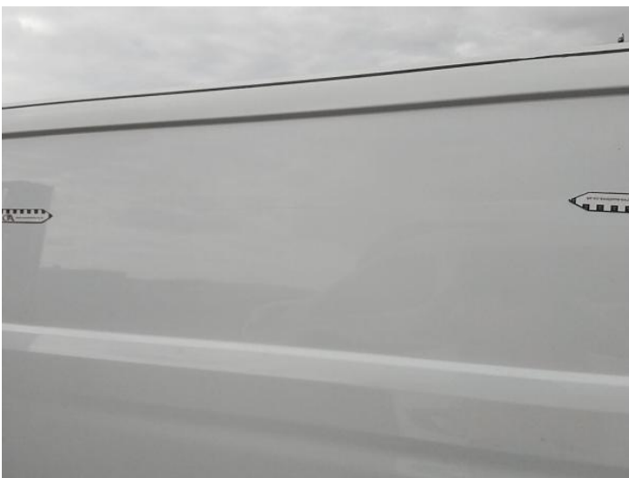
13: Qtr Panel osr Scratched Over 25mm Thru Paint