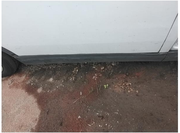
10: Qtr Panel Moulding os Broken Replace