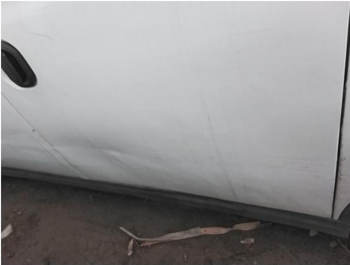
27: Qtr Panel nsr Poor Previous Repair Rippled Over 30%