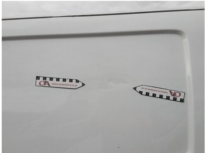
12: Qtr Panel osr Dented With Paint Damage