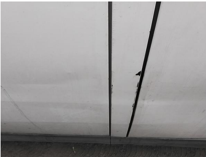
29: B Post ns Scratched Over 25mm Thru Paint