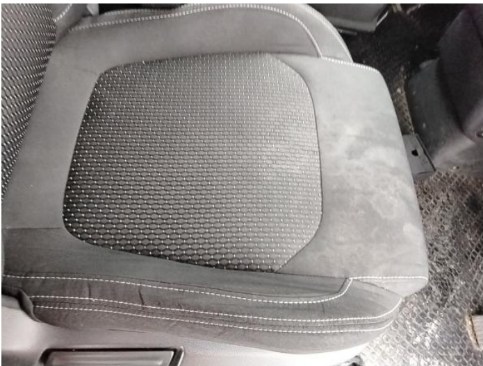
1: Seat Base Cover osf Soiled Heavy