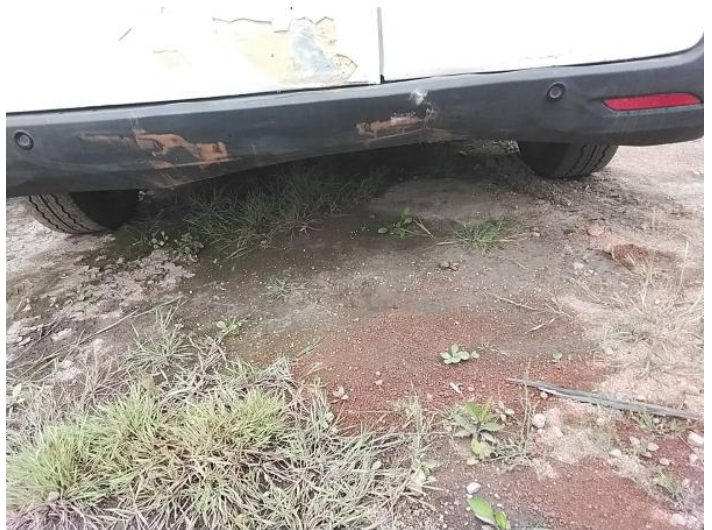
20: Bumper Rear Dented Over 30% Of Panel