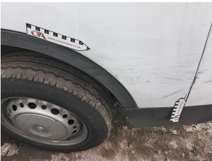
25: Qtr Panel nsr Poor Previous Repair Rippled UpTo 30%