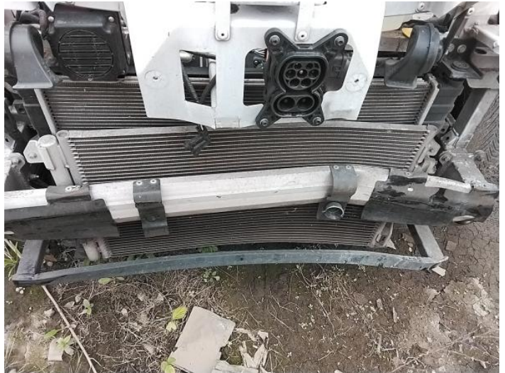
4: Unclassified Substantial Accident Damage Report Only