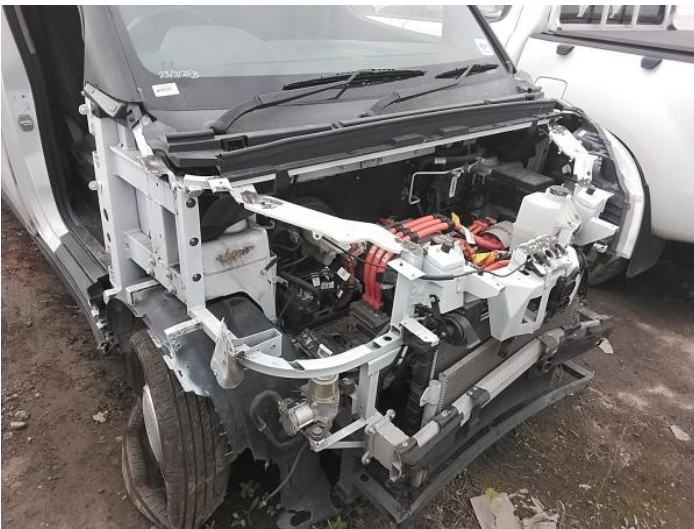
5: Unclassified Major Parts Missing Report Only