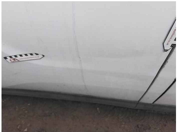
30: Door nsf Dented Over 30mm