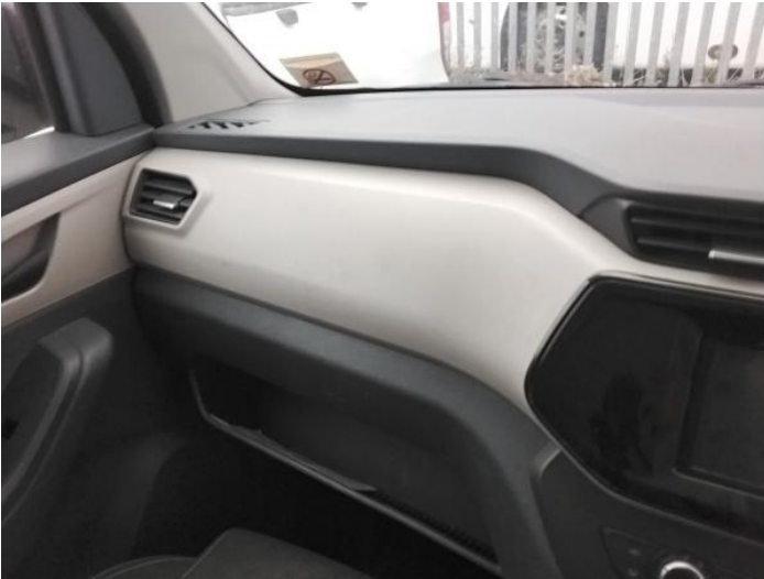
3: Fascia Panel Soiled Heavy