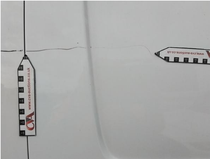
15: Qtr Panel osr Scratched Over 25mm Thru Paint