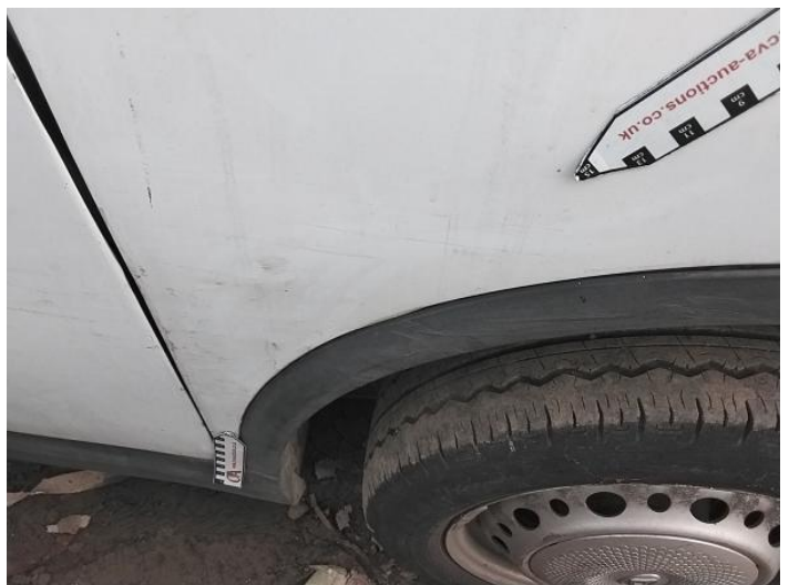
26: Qtr Panel nsr Poor Previous Repair Rippled UpTo 30%