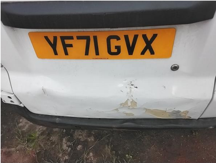
21: Door nsr Dented Over 30% Of Panel