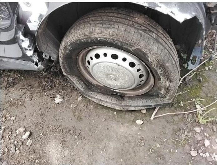
7: Wheel osf Damaged Replace