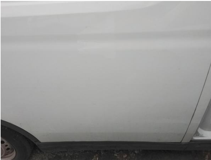
11: Qtr Panel osr Chipped Multiple Chips