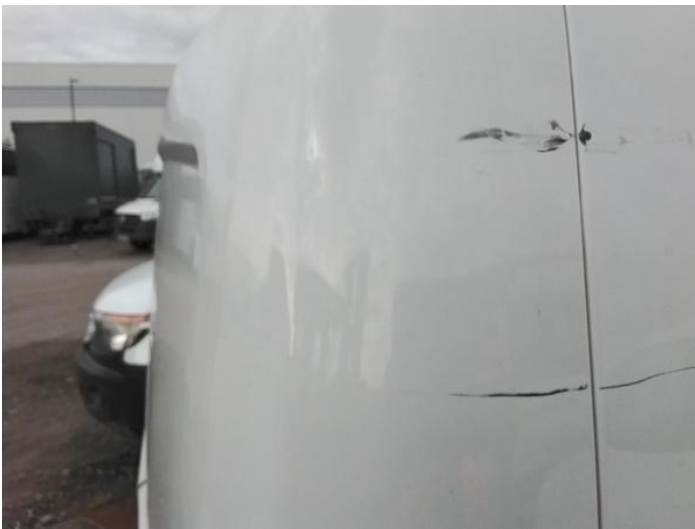
17: C Post os Scratched Over 25mm Thru Paint