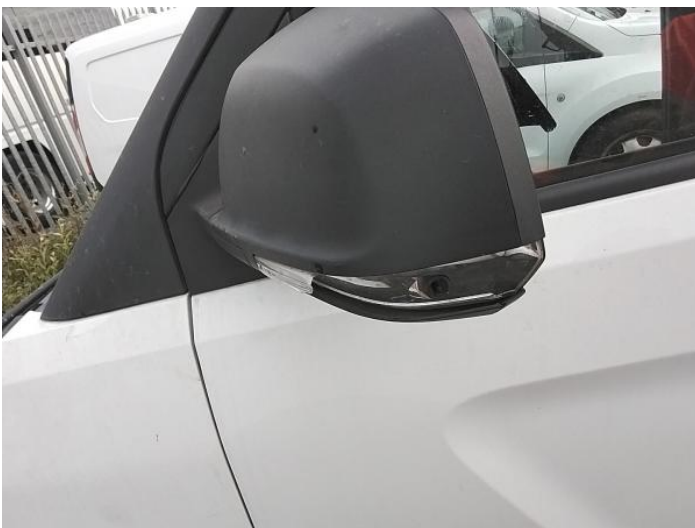
31: Door Mirror Assy nsf Broken Replace