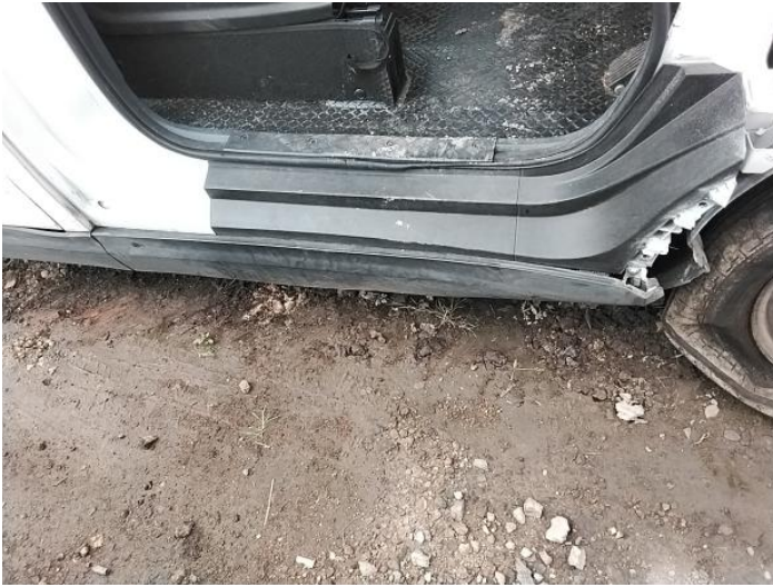
9: Door Moulding osf Broken Replace