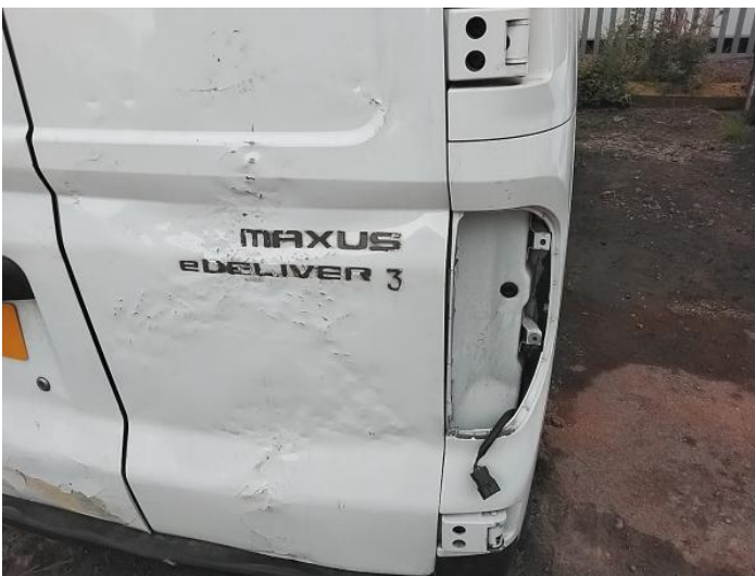
19: Door osr Dented Over 30% Of Panel