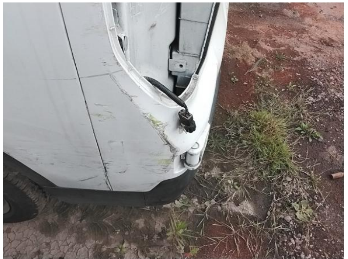
24: C Post ns Scratched Over 25mm Thru Paint