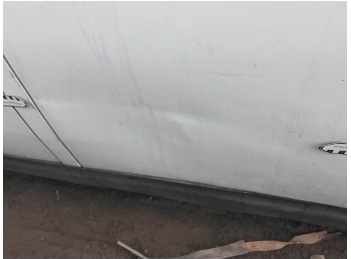
28: Qtr Panel nsr Dented Over 30mm