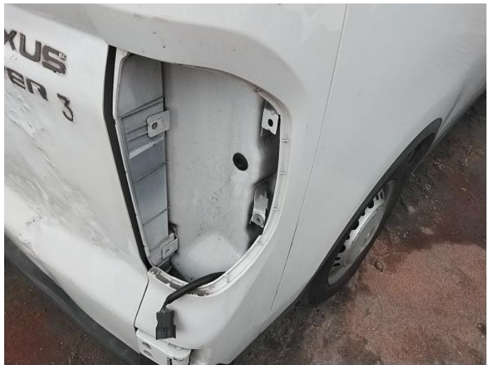
18: Lamp osr Missing Replace