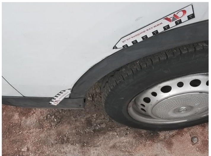
14: Qtr Panel osr Dented With Paint Damage