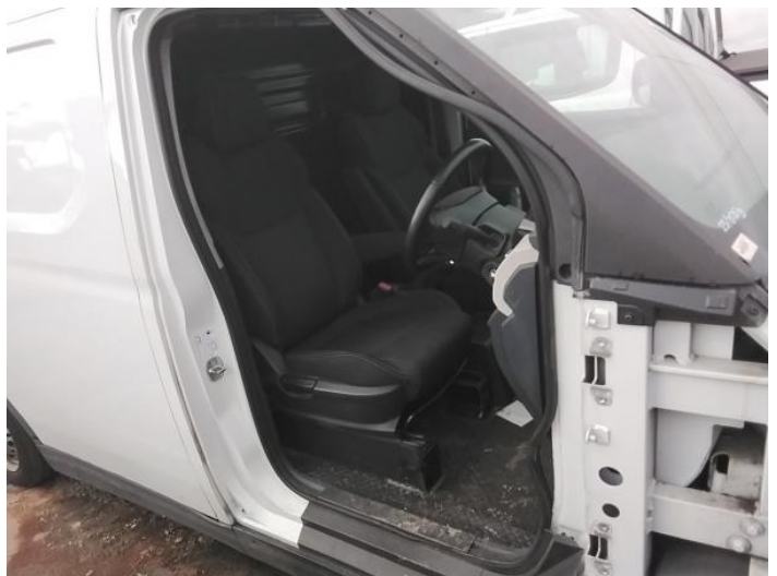
8: Door osf Missing Replace