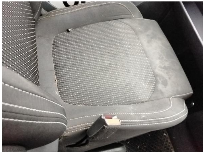
2: Seat Base Cover nsf Soiled Heavy