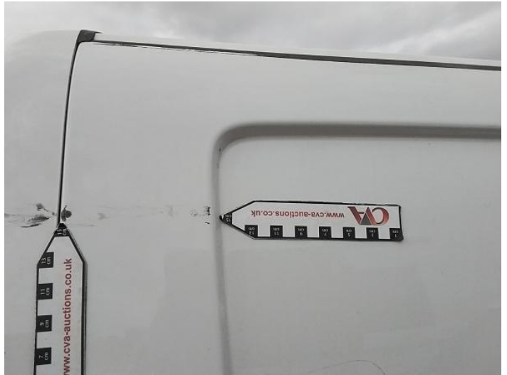
16: Qtr Panel osr Scratched Over 25mm Thru Paint