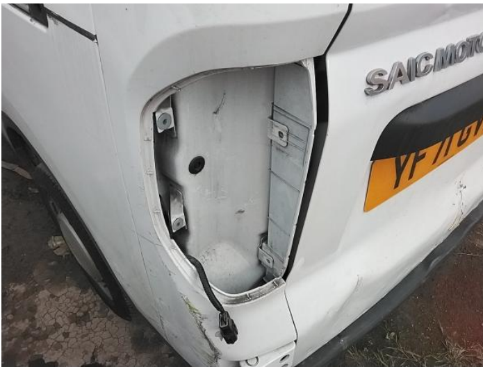
23: Lamp nsr Missing Replace