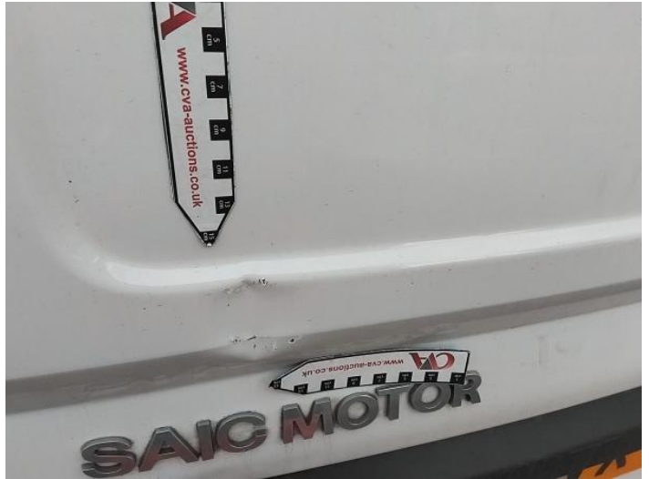
22: Door nsr Dented With Paint Damage