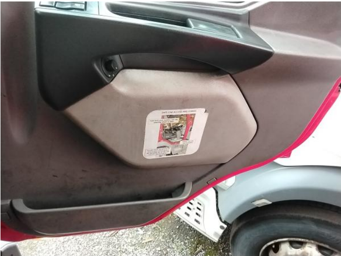
1: Door Pad osf Soiled Heavy