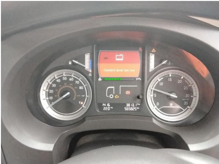
2: Dash Warning Lights Displayed No Action