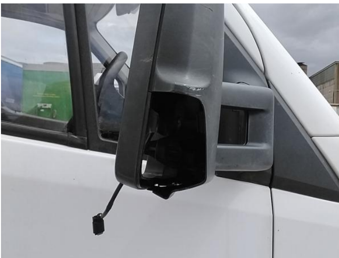
13: Door Mirror Assy osf Missing Replace