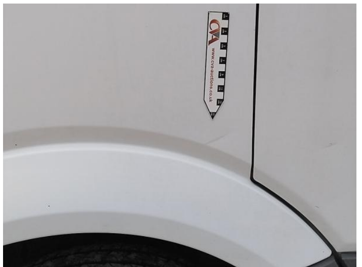
8: Wing nsf Scratched UpTo 25mm Thru Paint