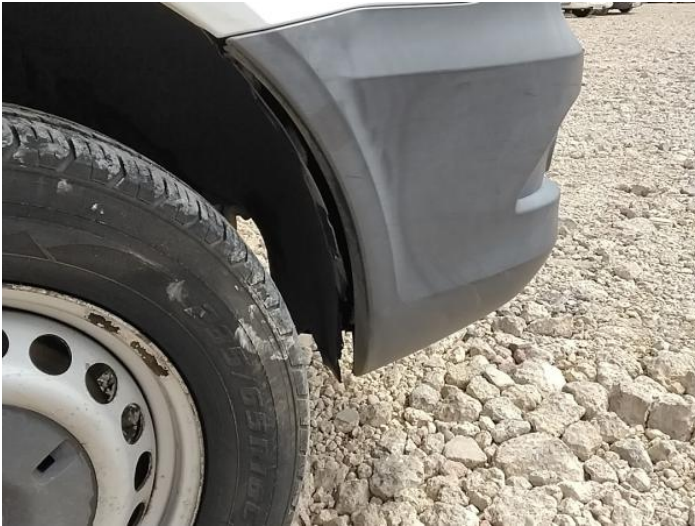
3: Other N/A N/A