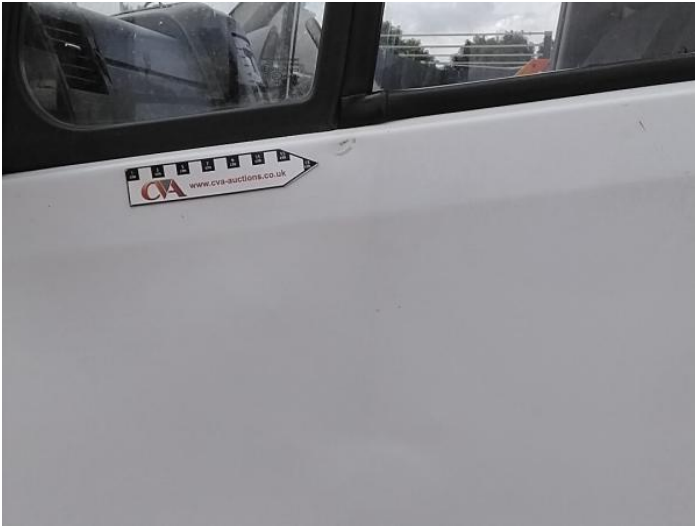
9: Door nsf Dented Between 10mm + 30mm