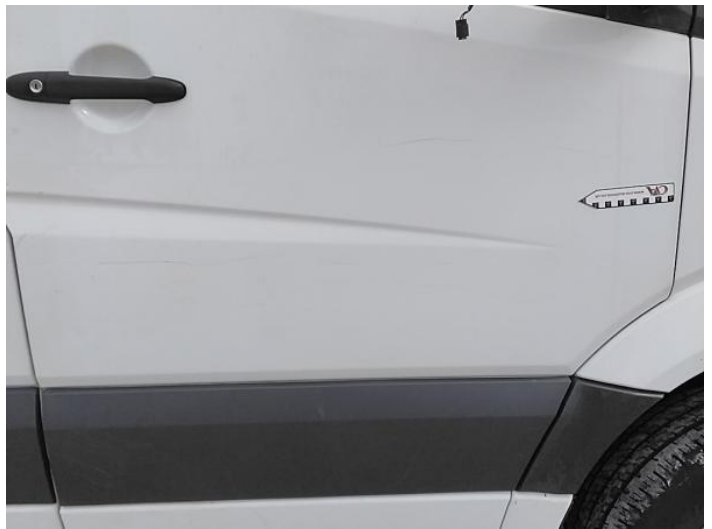
12: Door osf Scratched Over 25mm Thru Paint