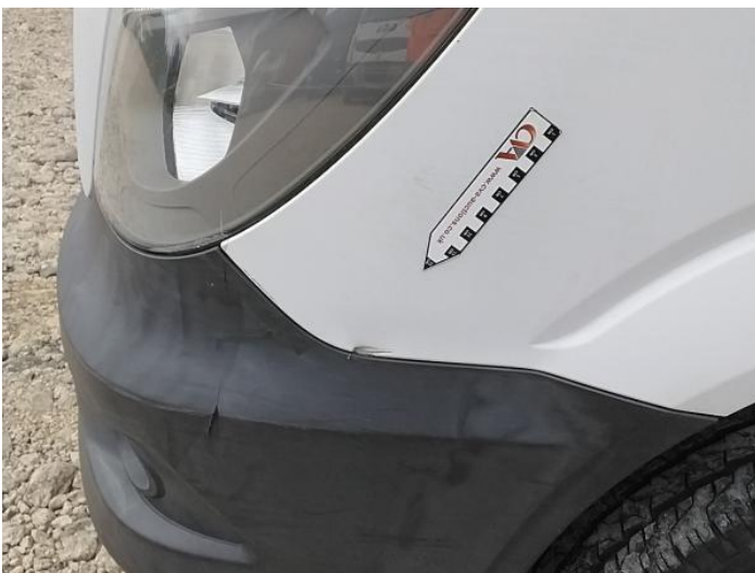
7: Wing nsf Scratched UpTo 25mm Thru Paint