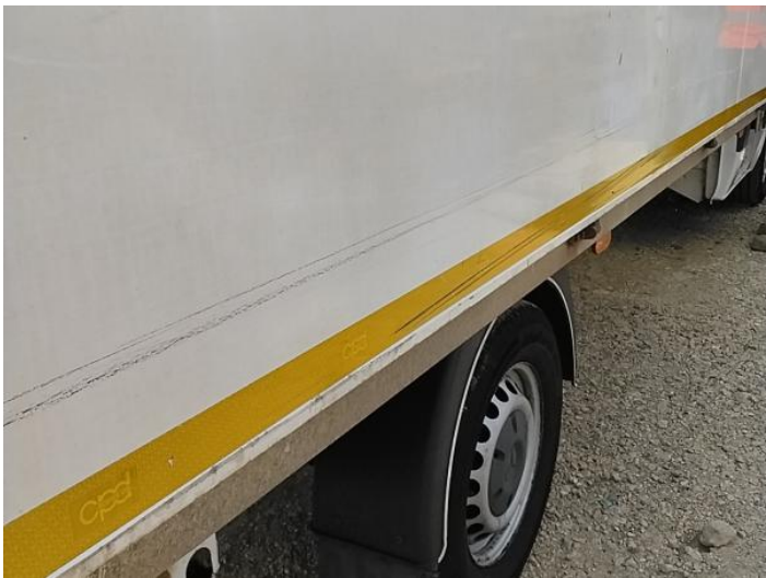
18: Other N/A N/A