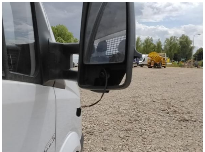
14: Door Mirror Glass os Missing Replace