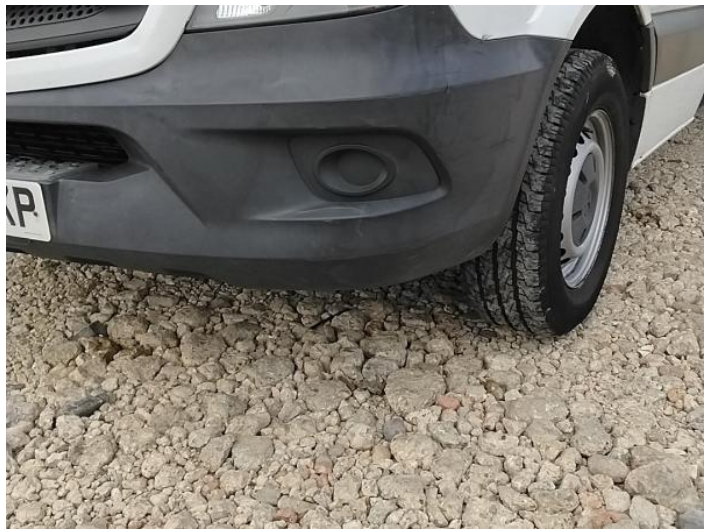
6: Bumper Front Moulding Scuffed (Unpainted) UpTo 100mm