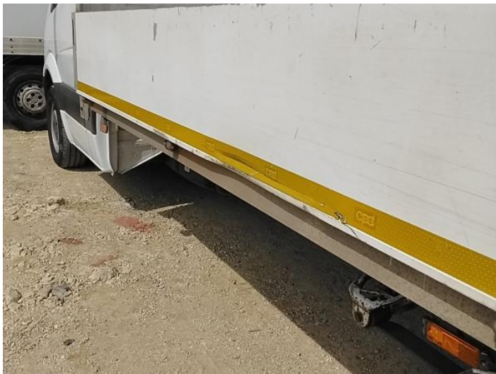
17: Other N/A N/A