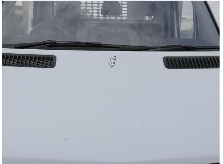
4: Bonnet Chipped Multiple Chips