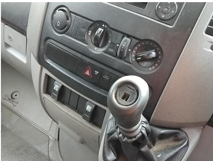
16: Other N/A N/A