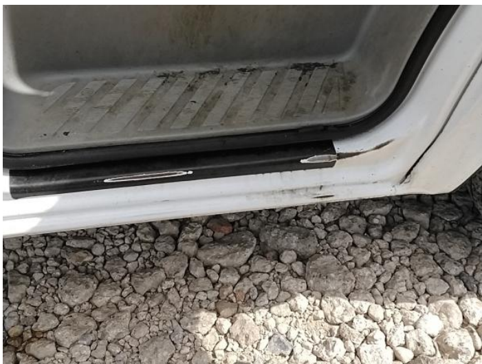
15: Sill os Rusted Over 5mm