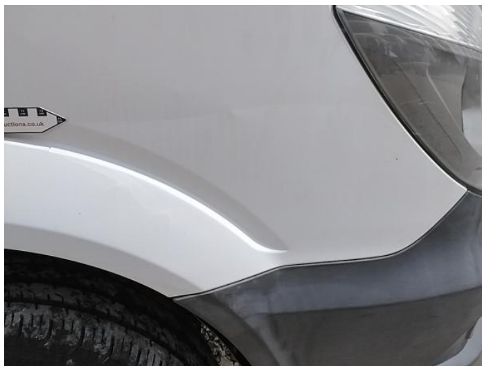
2: Wing osf Scratched Over 25mm Thru Paint