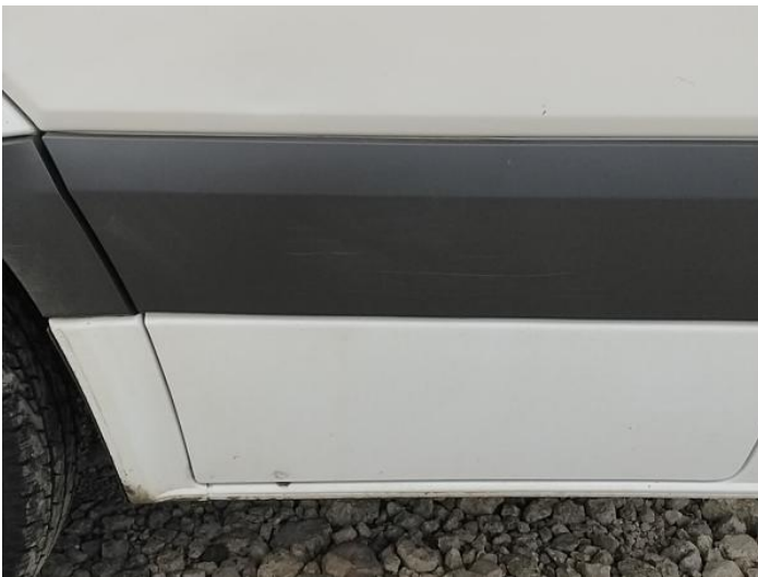
11: Door Moulding nsf Scuffed (Unpainted) UpTo 100mm