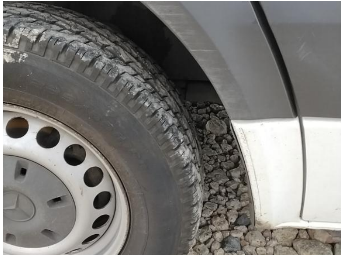
10: Moulding nsf Wing Scuffed (Unpainted) UpTo 100mm