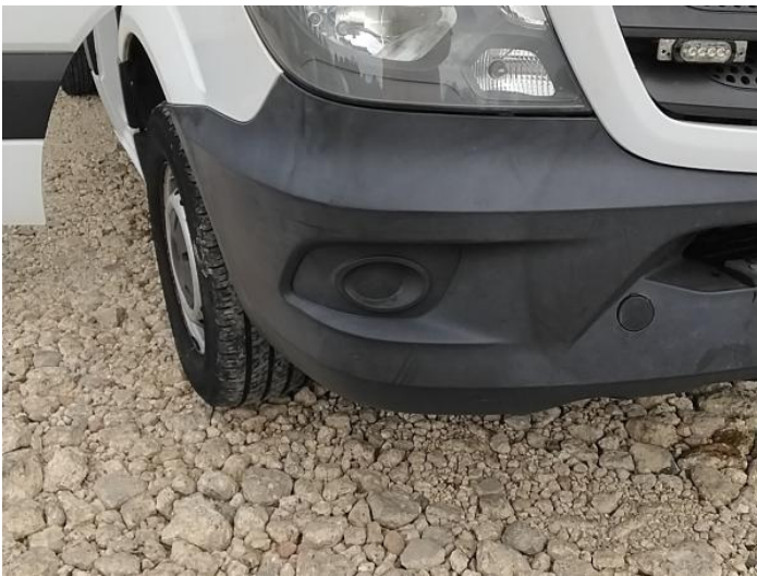
5: Bumper Front Moulding Scuffed (Unpainted) UpTo 100mm