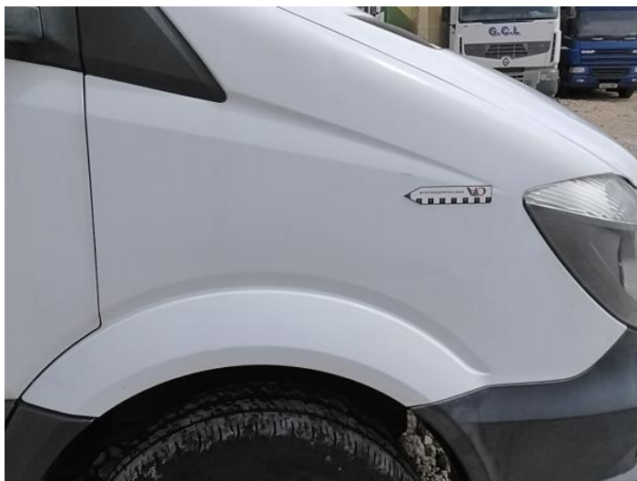
1: Wing osf Scratched Over 25mm Thru Paint