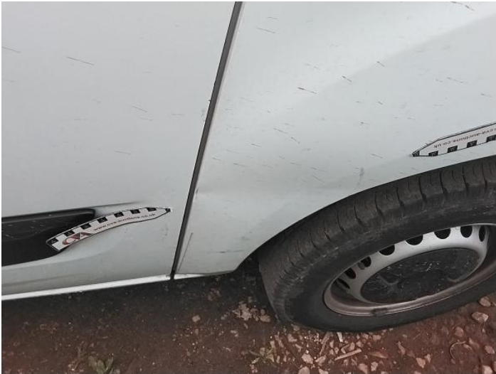
9: Qtr Panel nsr Dented Over 30mm