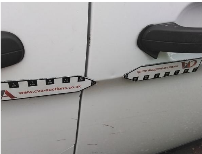
7: Qtr Panel nsr Dented Over 30mm