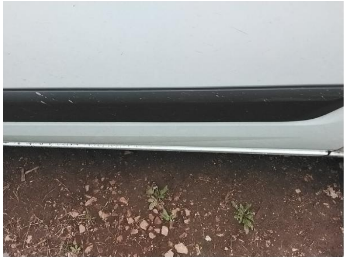
10: Qtr Panel Moulding ns Scuffed (Unpainted) Over 100mm