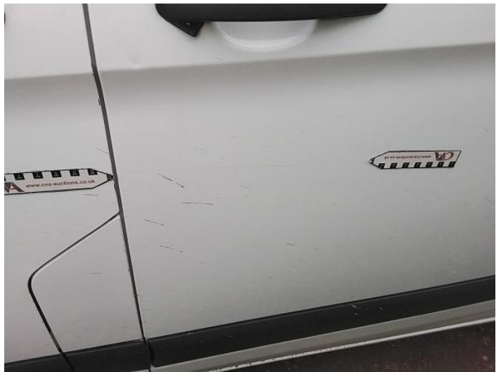
6: Qtr Panel nsr Scratched Over 25mm Not Thru Paint