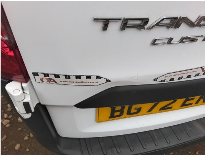
11: Door nsr Dented With Paint Damage