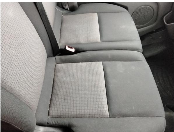
13: Seat Base Cover nsf Soiled Heavy