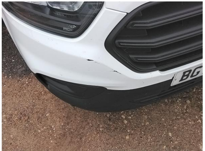
2: Panel Front Scratched Over 25mm Thru Paint