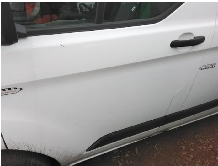
5: Door nsf Scratched Over 25mm Not Thru Paint