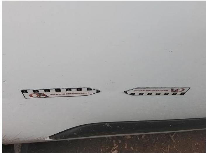
4: Door nsf Dented Over 30mm