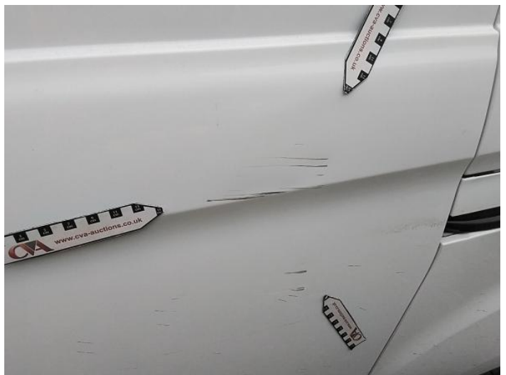
8: Qtr Panel nsr Dented With Paint Damage