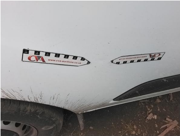
3: Door nsf Dented Over 30mm