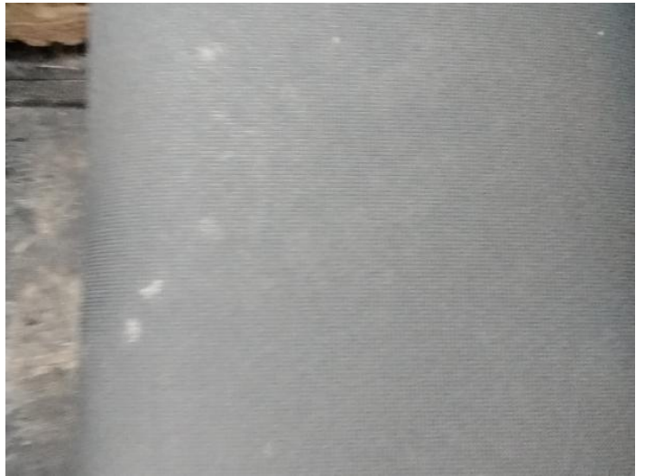
12: Seat Base Cover osf Soiled Heavy