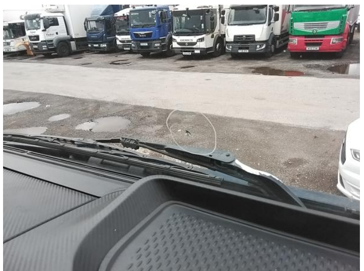
8: Screen Front Chipped Over 10mm