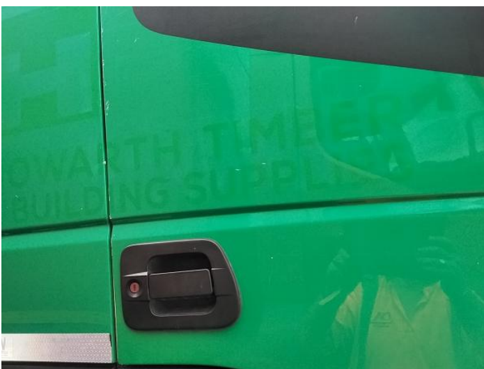
7: Door osf Chipped Multiple Chips