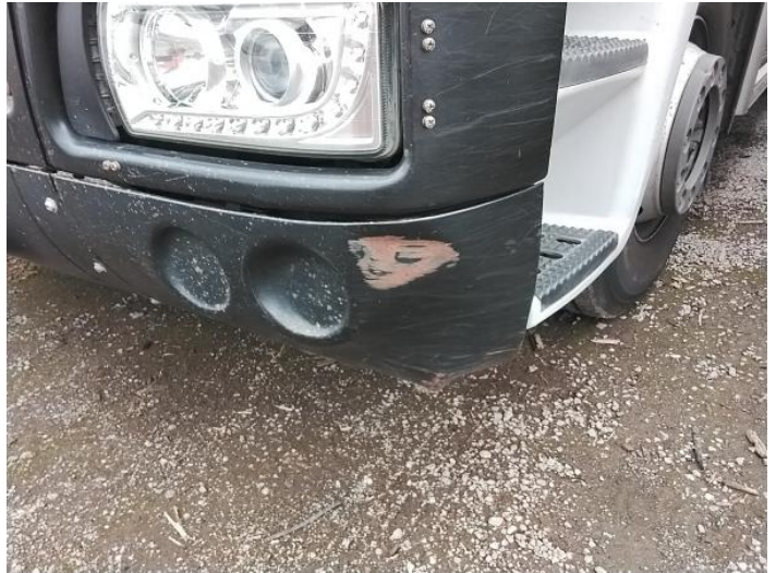
4: Bumper Front Dented With Paint Damage