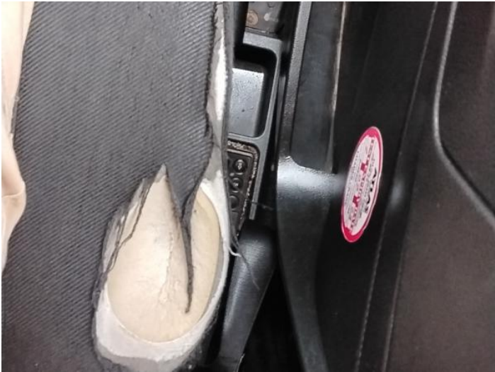
9: Seat Base Cover osf Torn Over 3mm