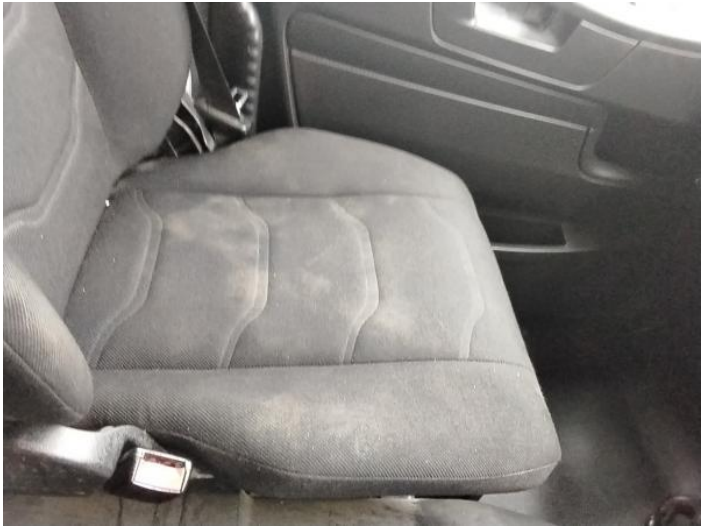
10: Seat Base Cover nsf Soiled Heavy