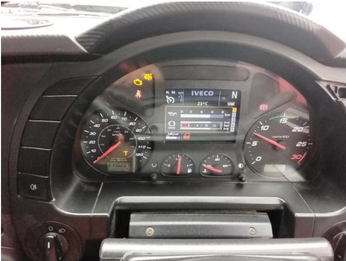
11: Dash Warning Lights Displayed No Action