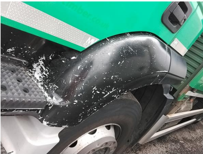
5: Wing nsf Scratched Over 25mm Thru Paint