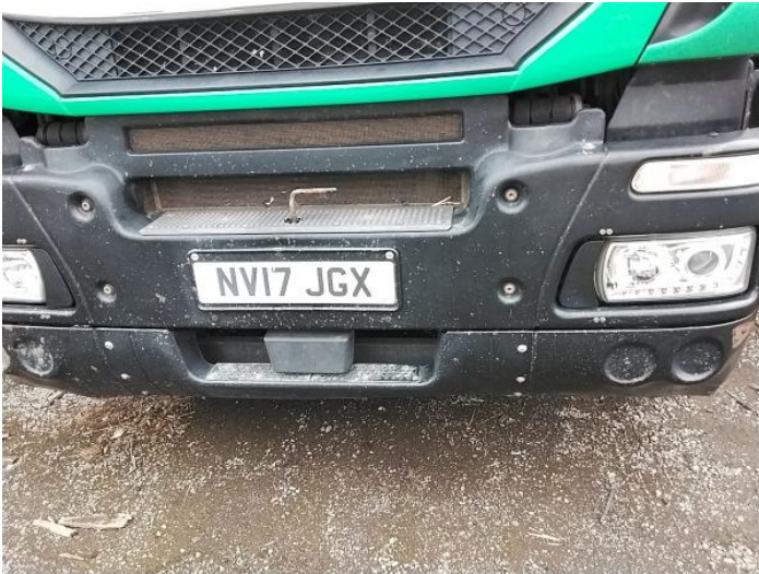
3: Bumper Front Chipped Multiple Chips