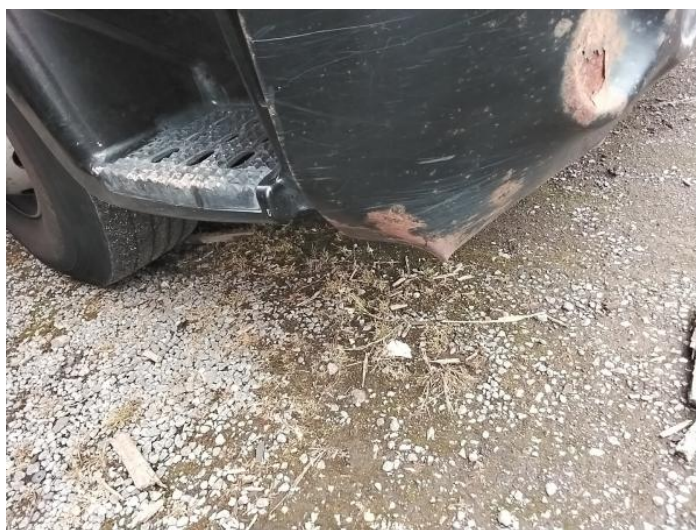
2: Bumper Front Dented With Paint Damage