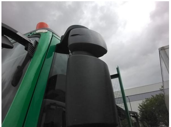
6: Door Mirror Assy nsf Broken Replace