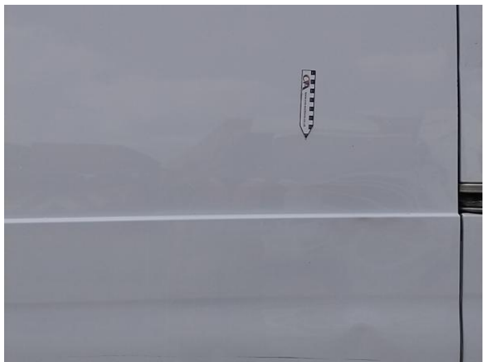
8: Door nsr Dented Between 10mm + 30mm