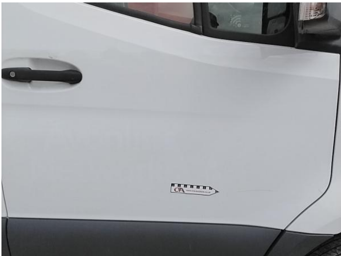
16: Door osf Scratched Over 25mm Not Thru Paint