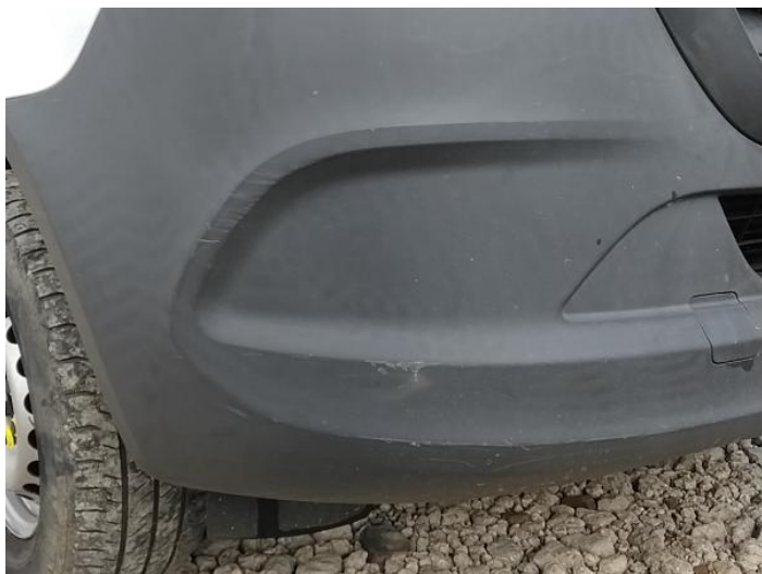
1: Bumper Front Moulding Scuffed (Unpainted) Over 100mm