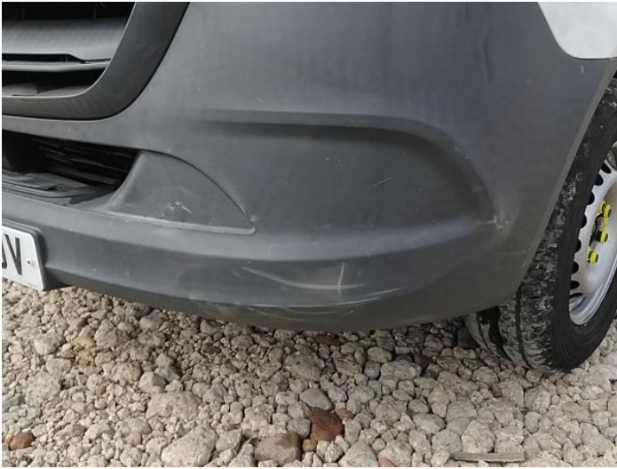
3: Bumper Front Moulding Scuffed (Unpainted) UpTo 100mm