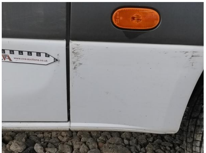
14: Qtr Panel nsr Scratched Over 25mm Not Thru Paint