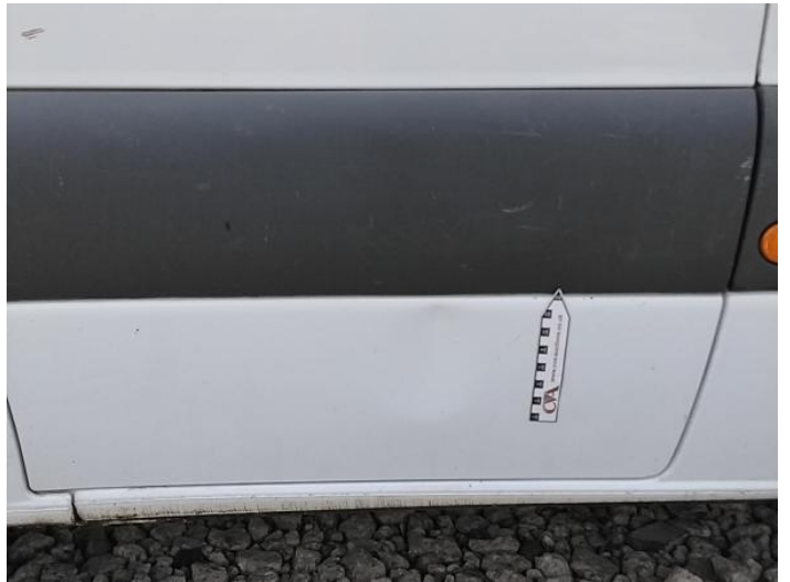
6: Door Moulding nsf Scuffed (Unpainted) Over 100mm