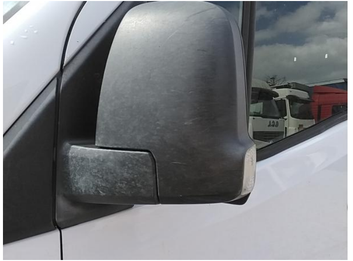
4: Door Mirror Assy nsf Scuffed (Unpainted) UpTo 100mm