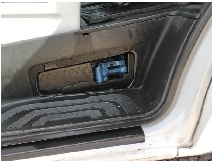
17: Other N/A N/A