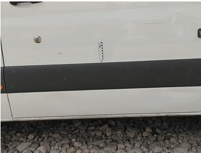
11: Door Moulding nsr Scuffed (Unpainted) Over 100mm