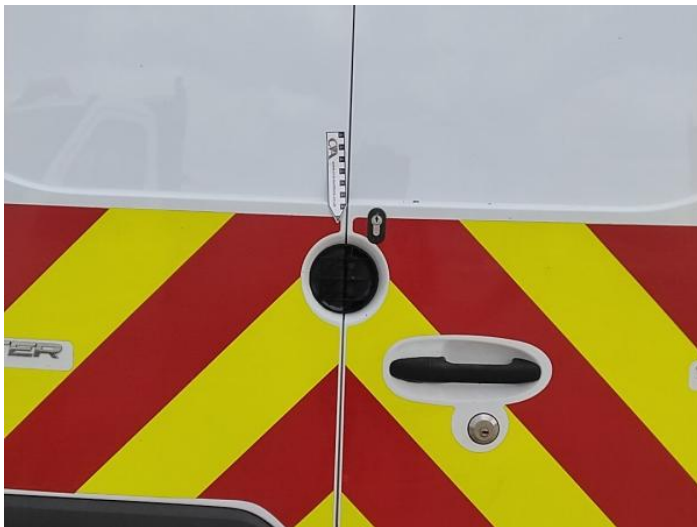
15: Badgedecal Rear Missing Replace