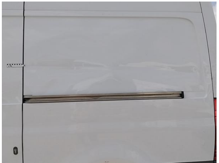
12: Qtr Panel nsr Dented Over 30mm