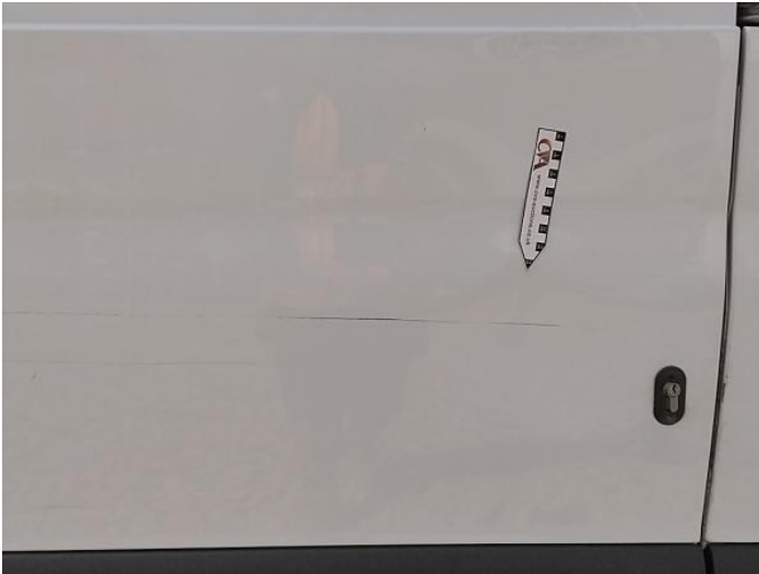
9: Door nsr Dented Between 10mm + 30mm