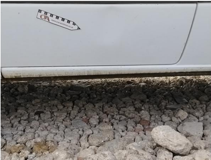
5: Door nsf Dented Between 10mm + 30mm