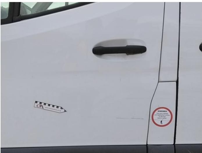
7: Door nsf Scratched Over 25mm Not Thru Paint