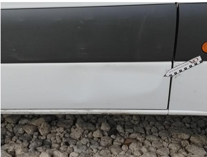
13: Door nsr Dented Over 30mm