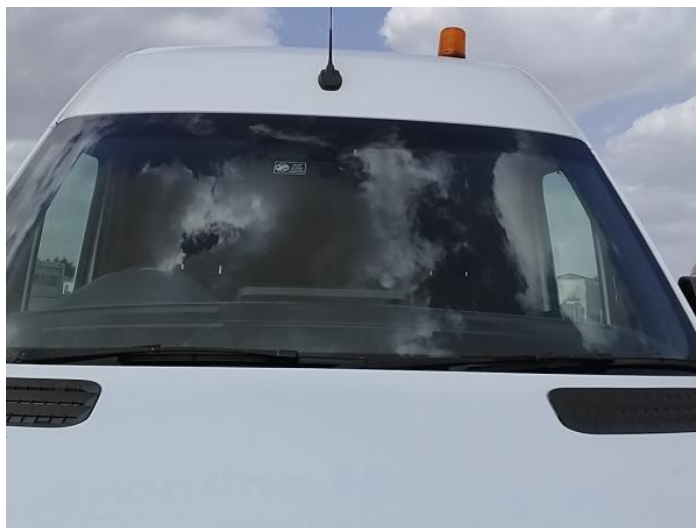
2: Screen Front Chipped Over 10mm