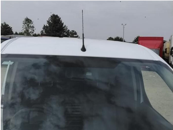
4: Screen Front Cracked Replace