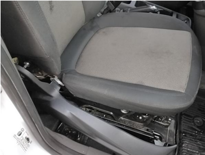
3: Other N/A N/A