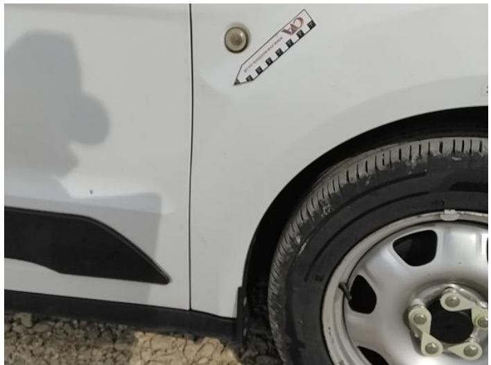
2: Wing osf Dented Between 10mm + 30mm