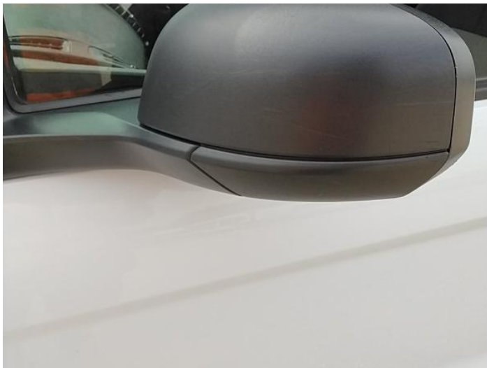
1: Door Mirror Assy nsf Scuffed (Unpainted) UpTo 100mm