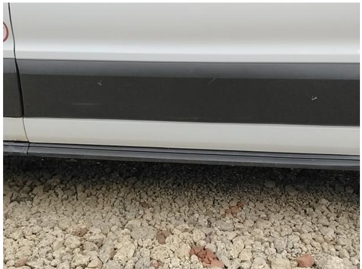
2: Door Moulding nsr Scuffed (Unpainted) UpTo 100mm