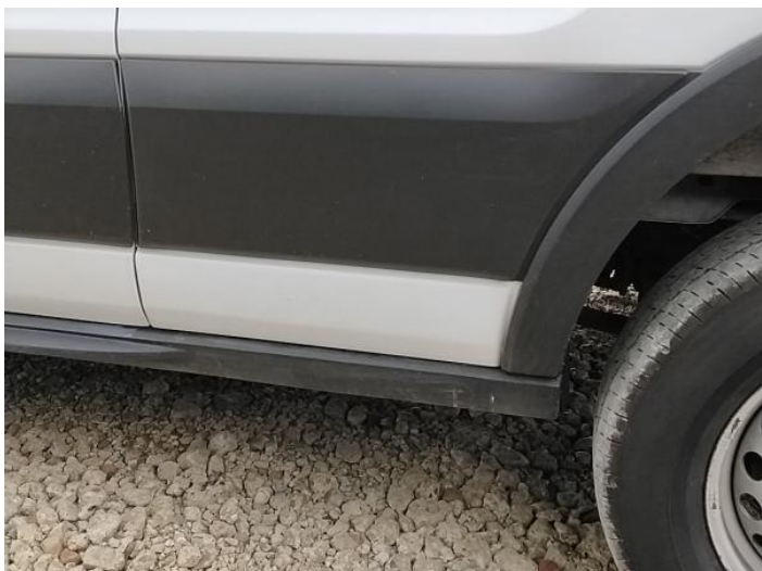
3: Qtr Panel Moulding ns Scuffed (Unpainted) Over 100mm