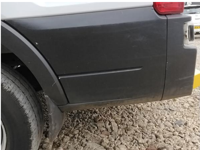
4: Qtr Panel Trim ns Scuffed Over 25mm