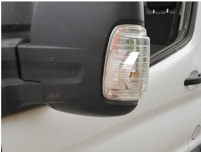
1: Door Mirror Assy nsf Scuffed (Unpainted) UpTo 100mm