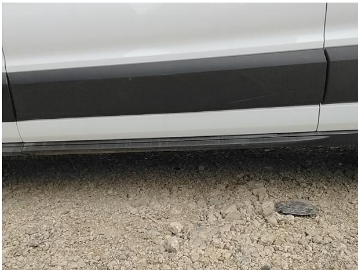
3: Door Moulding nsr Scuffed (Unpainted) Over 100mm