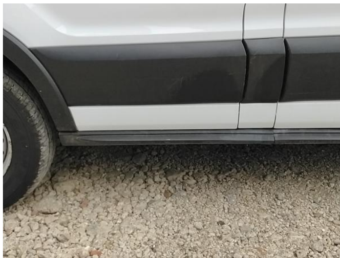
2: Door Moulding nsf Scuffed (Unpainted) UpTo 100mm