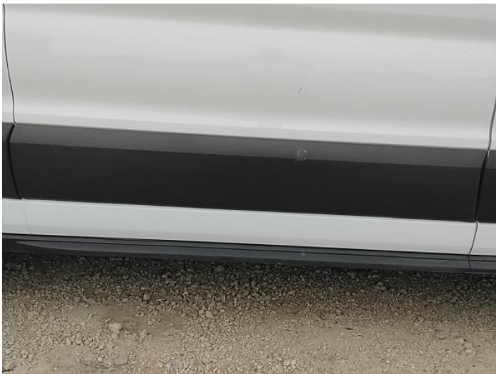
4: Qtr Panel Trim os Scuffed Over 25mm