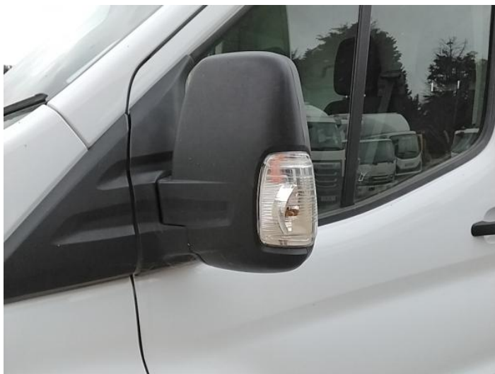
1: Door Mirror Assy nsf Scuffed (Unpainted) UpTo 100mm