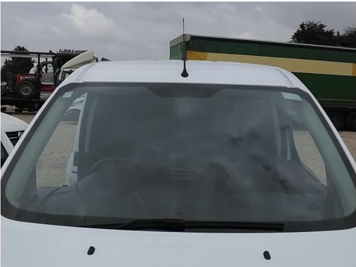
1: Screen Front Chipped UpTo 10mm