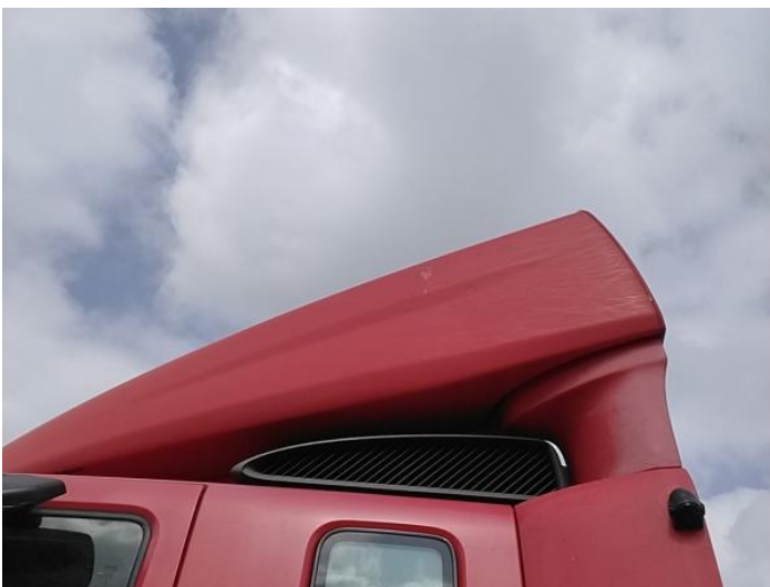
13: Other N/A N/A