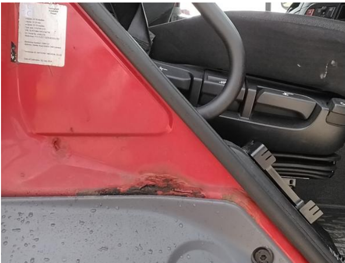
17: Other N/A N/A