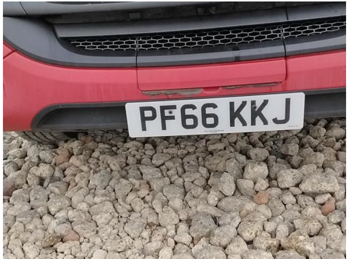
6: Bumper Front Rusted Over 5mm