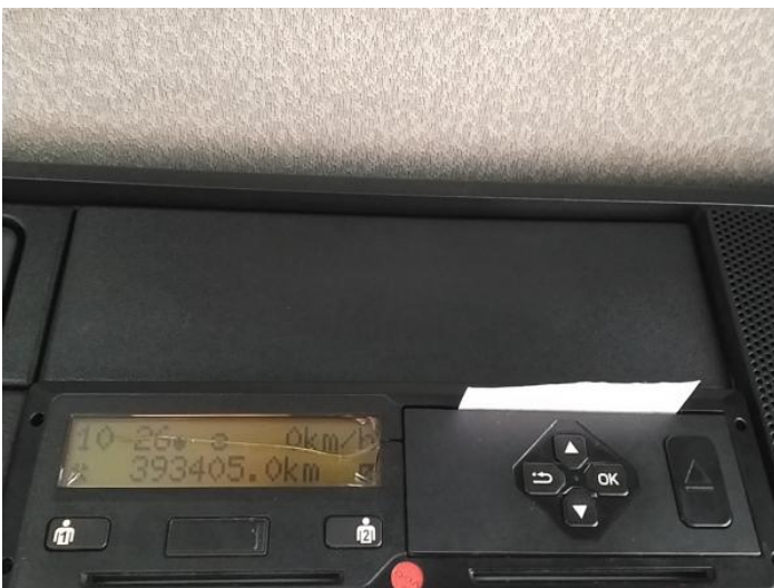
19: Other N/A N/A