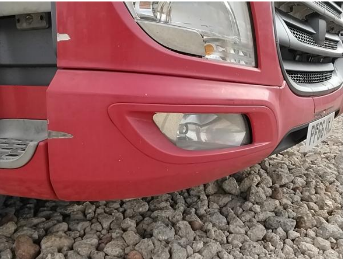
1: Bumper Front Moulding Scratched (Painted) UpTo 25mm Thru Paint