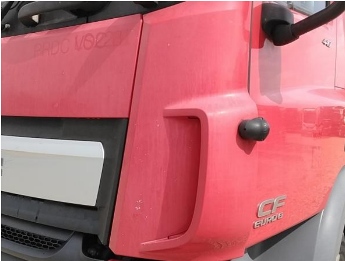
9: Wing nsf Chipped Multiple Chips