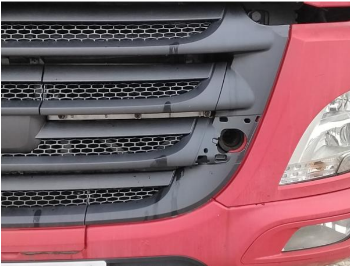
5: Front TowEye Cvr Missing Replace