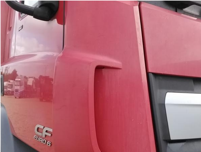
3: Wing osf Chipped Multiple Chips