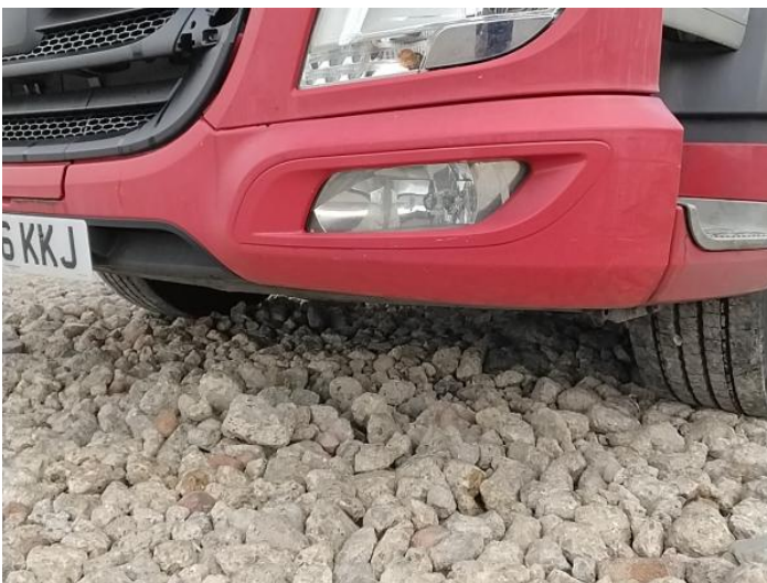
7: Bumper Front Moulding Scratched (Painted) UpTo 25mm Thru Paint