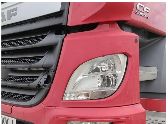
8: Other N/A N/A