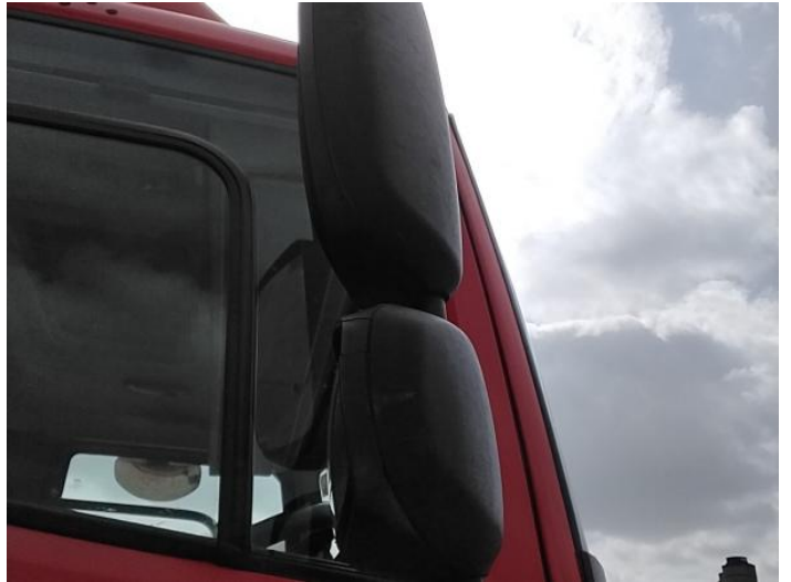
16: Door Mirror Assy osf Broken Replace