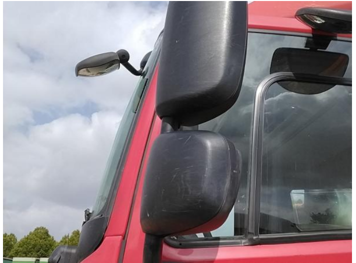
10: Door Mirror Assy nsf Scuffed (Unpainted) UpTo 100mm