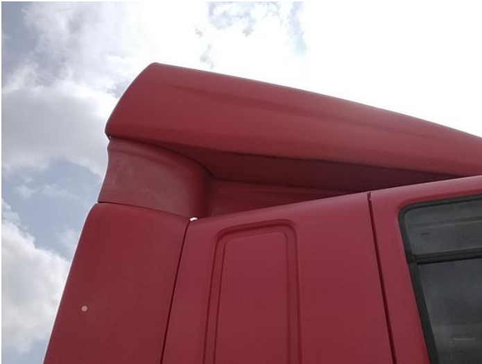
15: Other N/A N/A