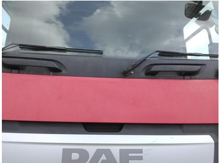
4: Bonnet Chipped Multiple Chips