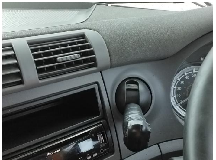
18: Other N/A N/A