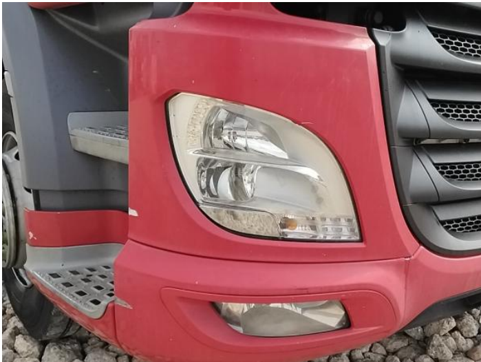
2: Other N/A N/A