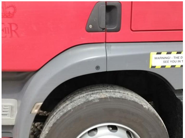
12: Other N/A N/A