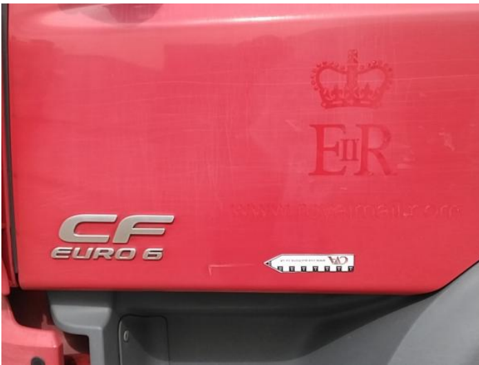
11: Door nsf Scratched UpTo 25mm Thru Paint