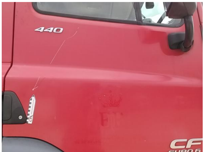
14: Door osf Scratched Over 25mm Thru Paint