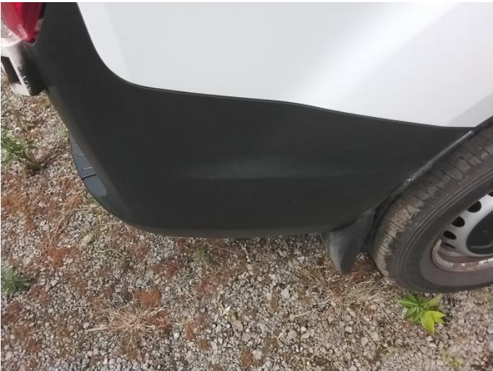
1: Qtr Panel Moulding os Scuffed (Unpainted) Over 100mm