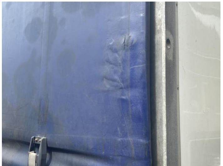
6: Qtr Panel osr Cracked Replace