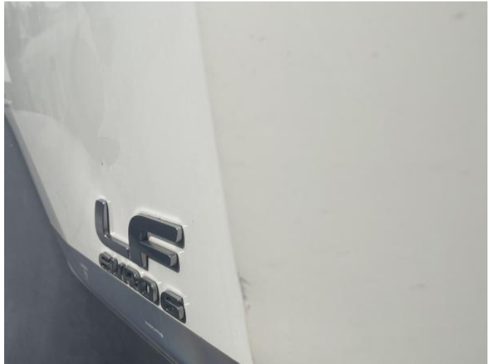
4: Door osf Dented Over 30mm