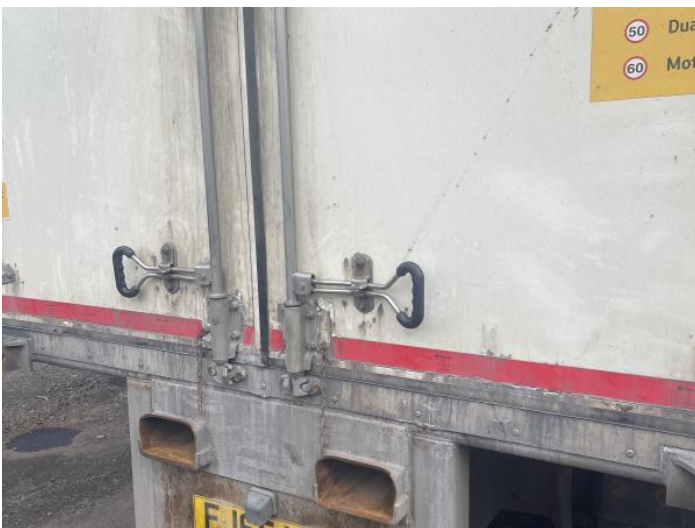
7: Tailgate Rusted Over 5mm