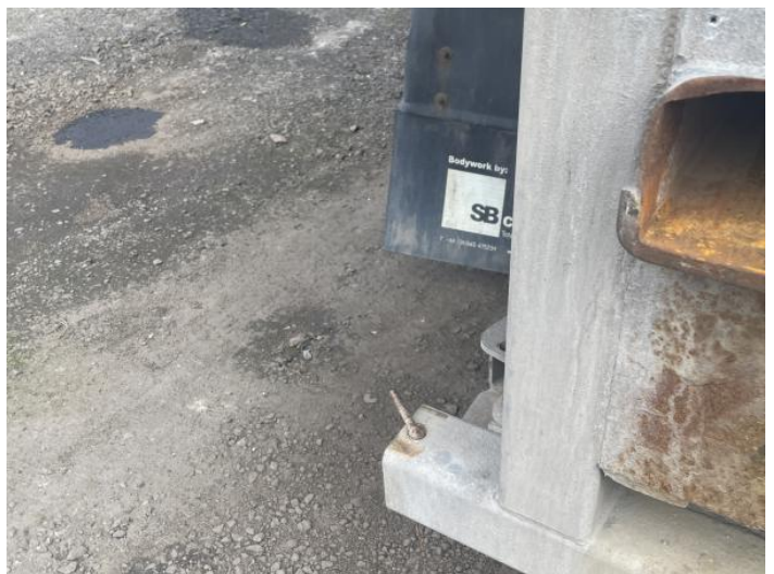
8: Bumper Rear Moulding Missing Replace