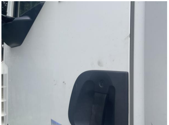
9: Qtr Panel nsr Hole Over 10mm