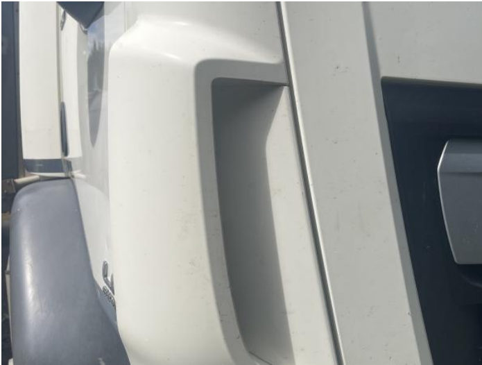
3: Wing osf Scratched Over 25mm Thru Paint