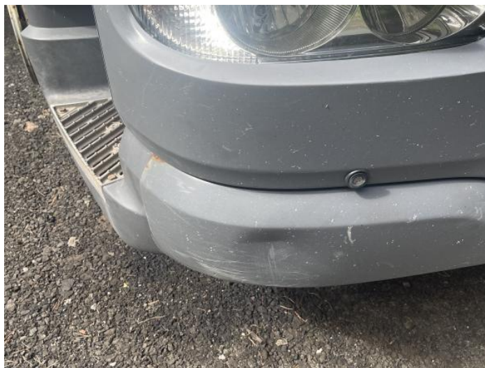
2: Bumper Front Moulding Scuffed (Unpainted) Over 100mm