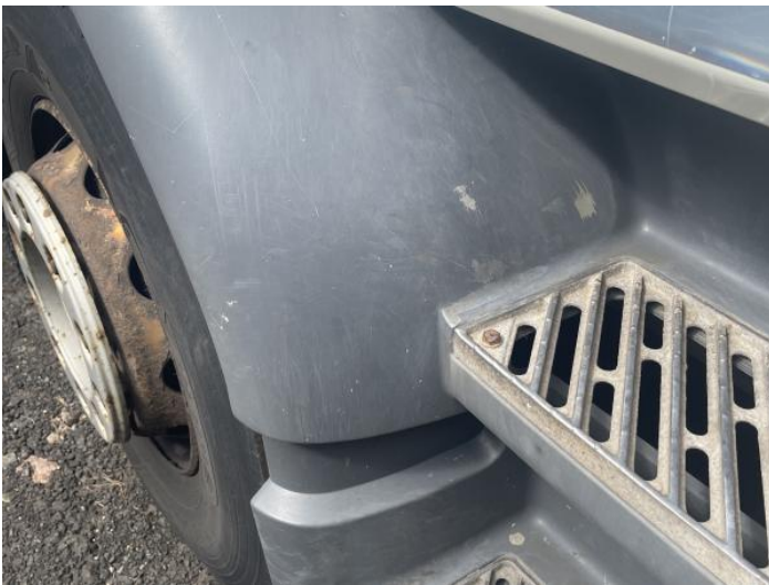
5: Door Moulding osf Scuffed (Unpainted) Over 100mm