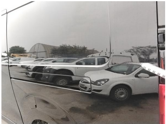
12: Qtr Panel nsr Scratched Over 25mm Not Thru Paint