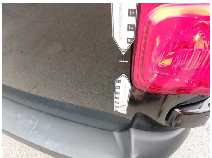
14: Door osr Dented With Paint Damage