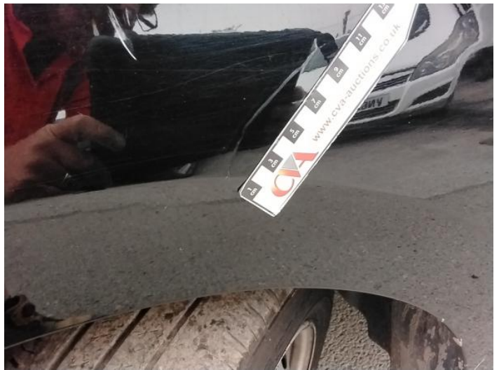
6: Wing nsf Scratched Over 25mm Not Thru Paint