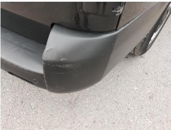
19: Qtr Panel Moulding os Scuffed (Unpainted) Over 100mm