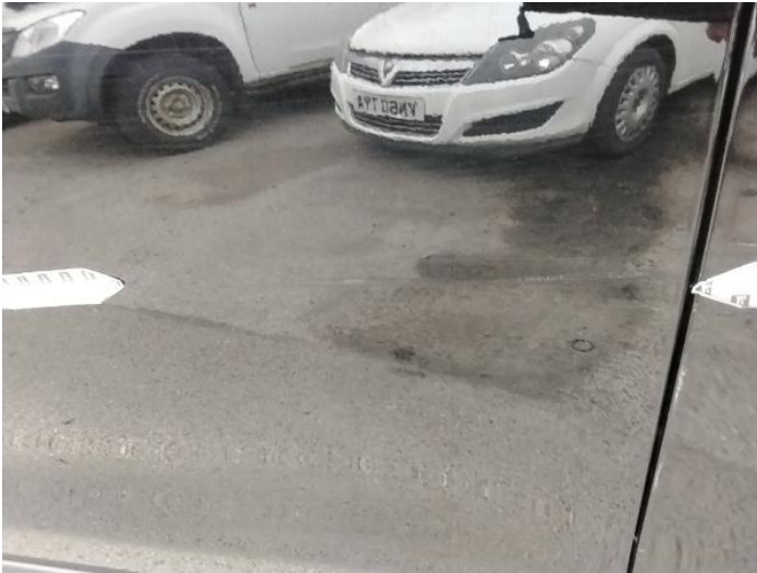
9: Qtr Panel nsr Dented With Paint Damage