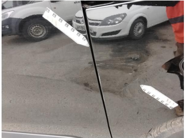
10: Qtr Panel nsr Dented With Paint Damage