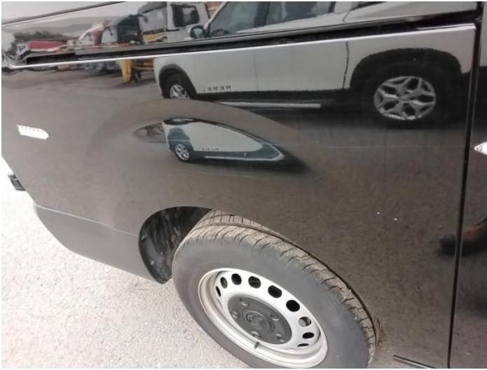
15: Qtr Panel osr Scratched Over 25mm Thru Paint