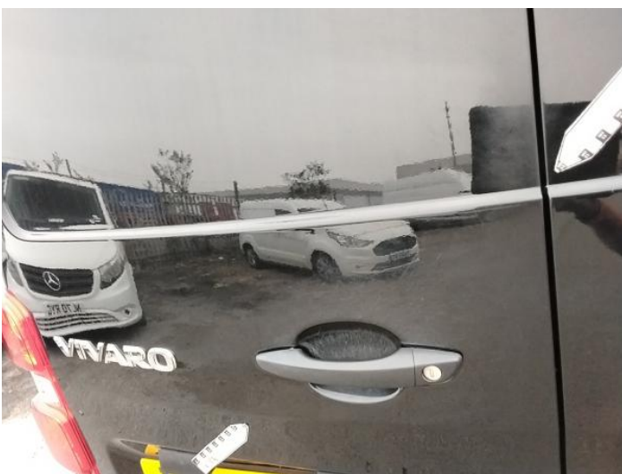
13: Door nsr Scratched Over 25mm Thru Paint