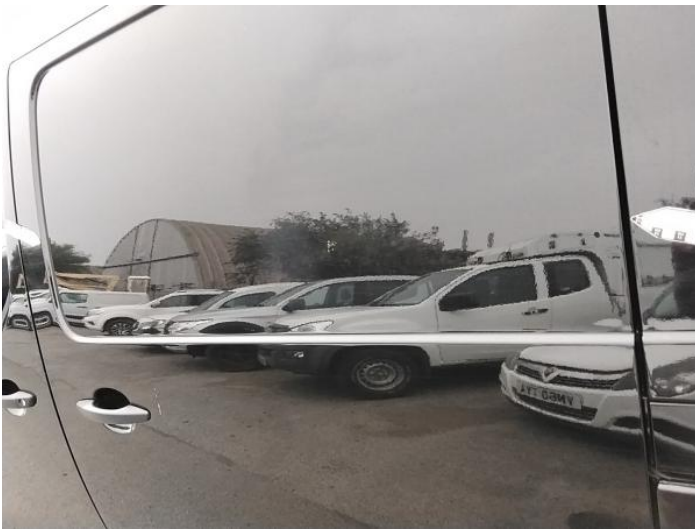
11: Qtr Panel nsr Scratched Over 25mm Not Thru Paint