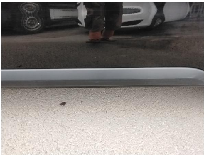
7: Qtr Panel Moulding ns Scuffed (Unpainted) Over 100mm