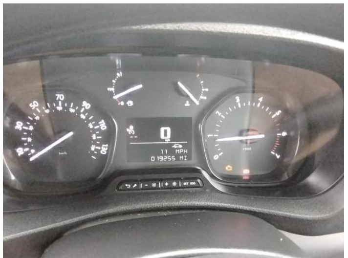
20: Dash Warning Lights Displayed No Action