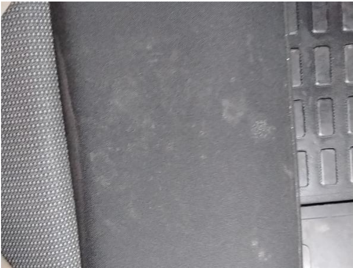
17: Seat Base Cover osf Soiled Light