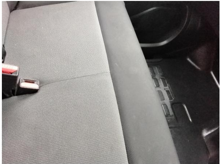
18: Seat Base Cover nsf Soiled Light