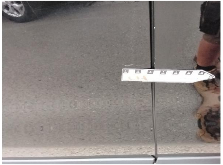
16: Qtr Panel osr Scratched Over 25mm Thru Paint