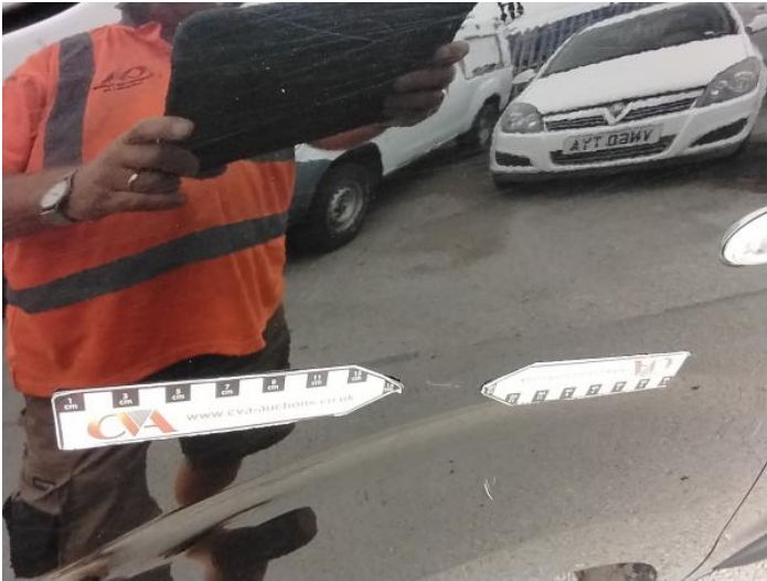
3: Wing nsf Dented With Paint Damage