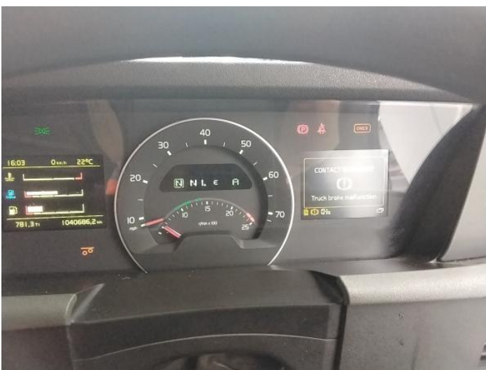
13: Dash Warning Lights Displayed No Action