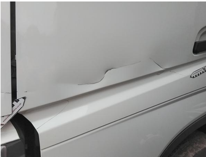
5: Door nsf Dented With Paint Damage