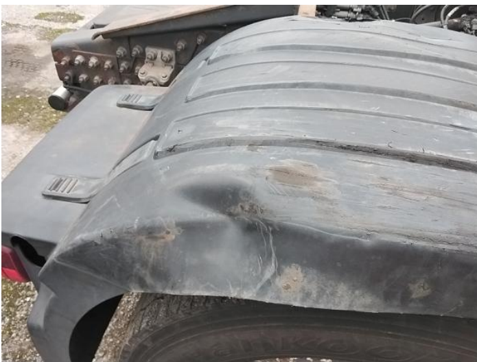
7: Qtr Panel Moulding os Scuffed (Unpainted) Over 100mm