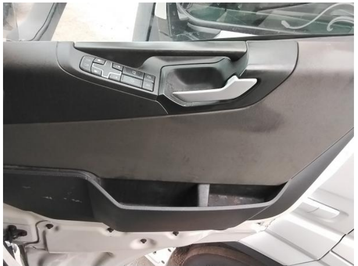
12: Door Pad osf Soiled Heavy