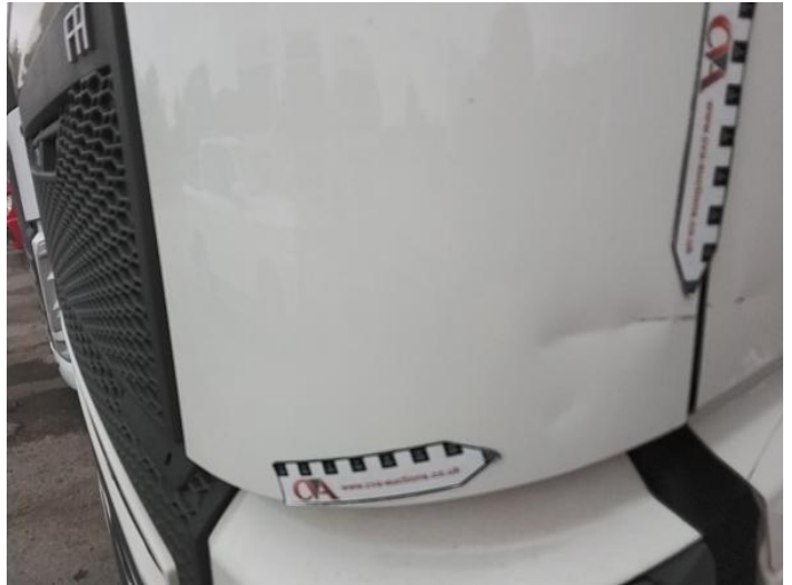
4: Bonnet Dented With Paint Damage