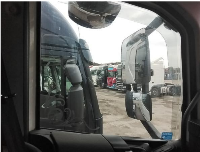
11: Door Window nsf Scratched Over 30mm