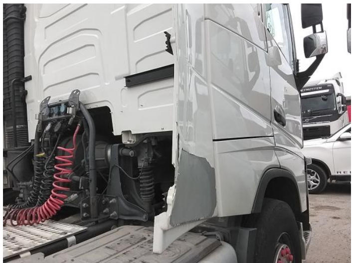
8: Qtr Panel Trim os Broken Replace