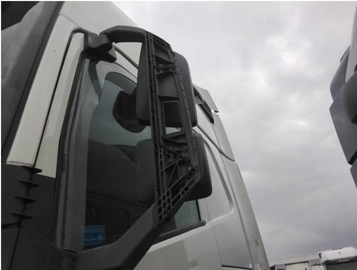
3: Door Moulding nsf Missing Replace