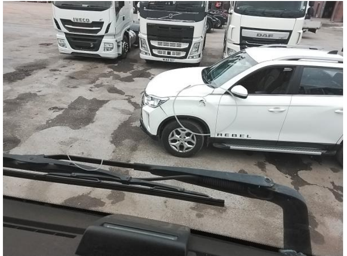
10: Screen Front Chipped Over 10mm