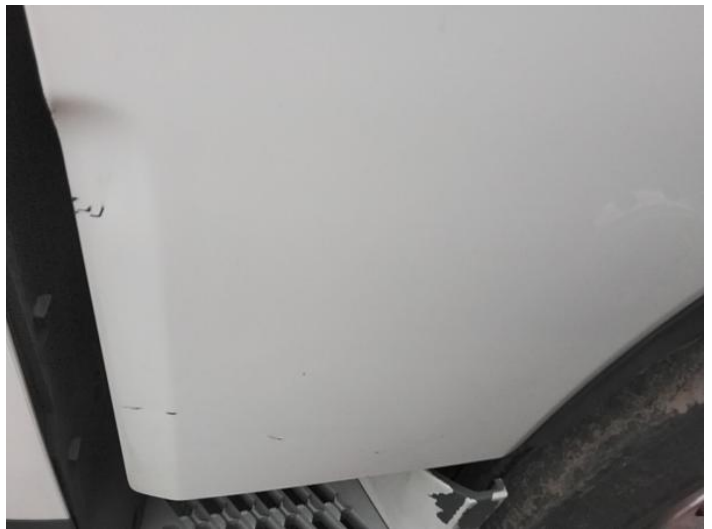
6: Door nsf Scratched Over 25mm Thru Paint