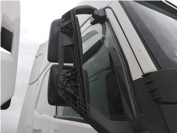
9: Door Moulding osf Missing Replace